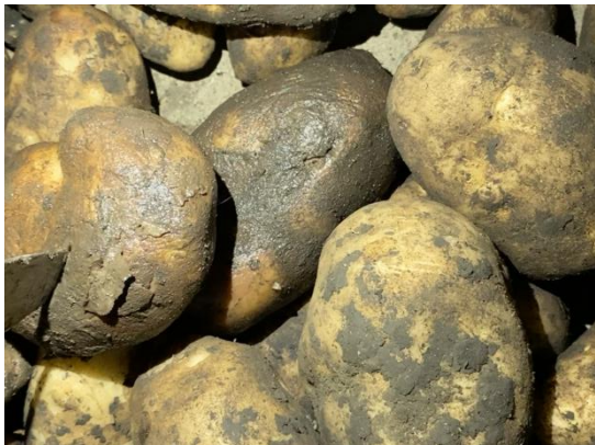
Fig.3. Overnight freezing temperatures had affected a few fields which had not been harvested by Oct. 9-11 and then Oct. 14-15.