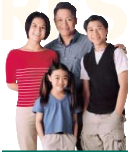
Family of 4, One Earner, Income: $40,000