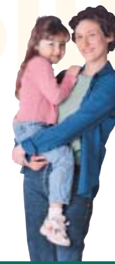
Parent and One Child, Income: $20,000