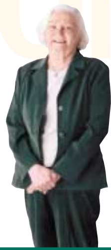
Single Senior, Income: $20,000