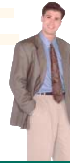
Single Person, Income: $35,000