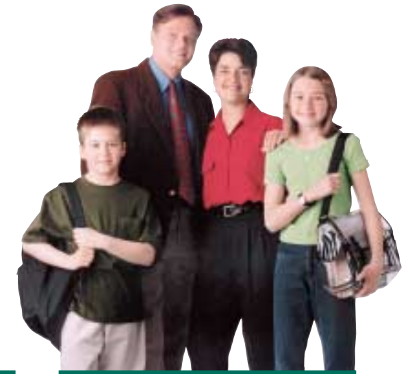
Family of 4, Two Earners, Income: $60,000