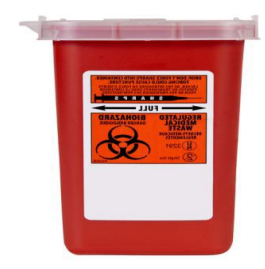
An image of a sharps container

When waste cannot be treated on-site, it must be sent off-site by transporters to facilities licensed or permitted to accept those specific waste types for interim storage or treatment and disposal.