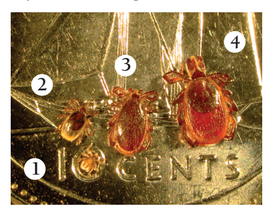
Figure 1: Life stages of the blacklegged tick (1-larva, 2-nymph, 3-adult male, 4-adult female). Sizes presented in relation to underlying 10-cent coin.

Blacklegged ticks ( Ixodes scapularis ) exist in three active stages: larva, nymph and adult. The life cycle of blacklegged ticks takes at least three years to complete and each active stage usually survives for up to one year. Blood is required by the tick to move to the next stage. Unfed larvae and nymphs are light in colour and very difficult to see (Figure 1).