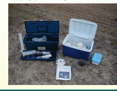
Figure 1. USDA Soil Quality Test Kit.

A field testing of this kit was conducted on a number of Manitoba soils and cropping systems during 2003.