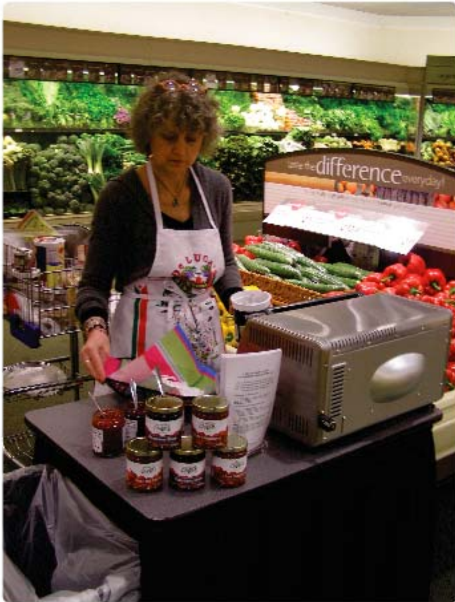
A demo at Lunds & Byerly's