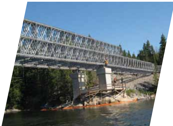
Bridge construction at God's Lake Narrows.