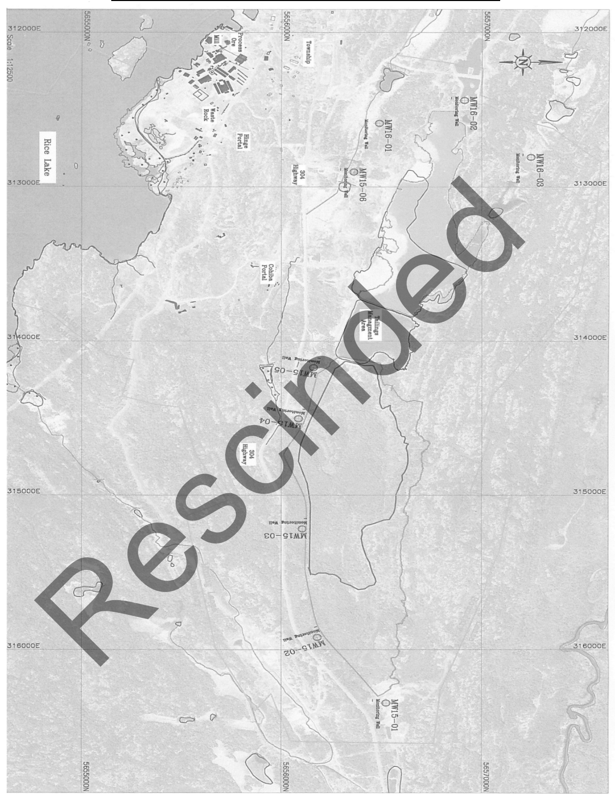
Appendix A of Environment Act Licence No. 2628 RRR