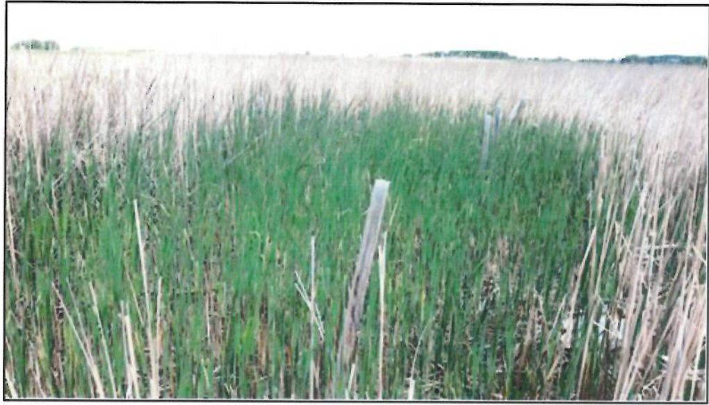
Figure 1. Regrowth of cattail in a harvested plot in the secondary cell, June 2017.