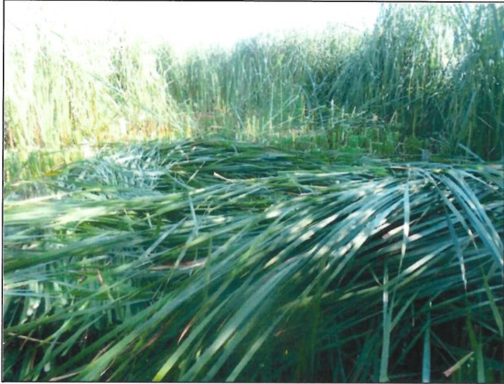
Figure 3. Survey transect in the wetland cell (Photo courtesy of N. Jeke).