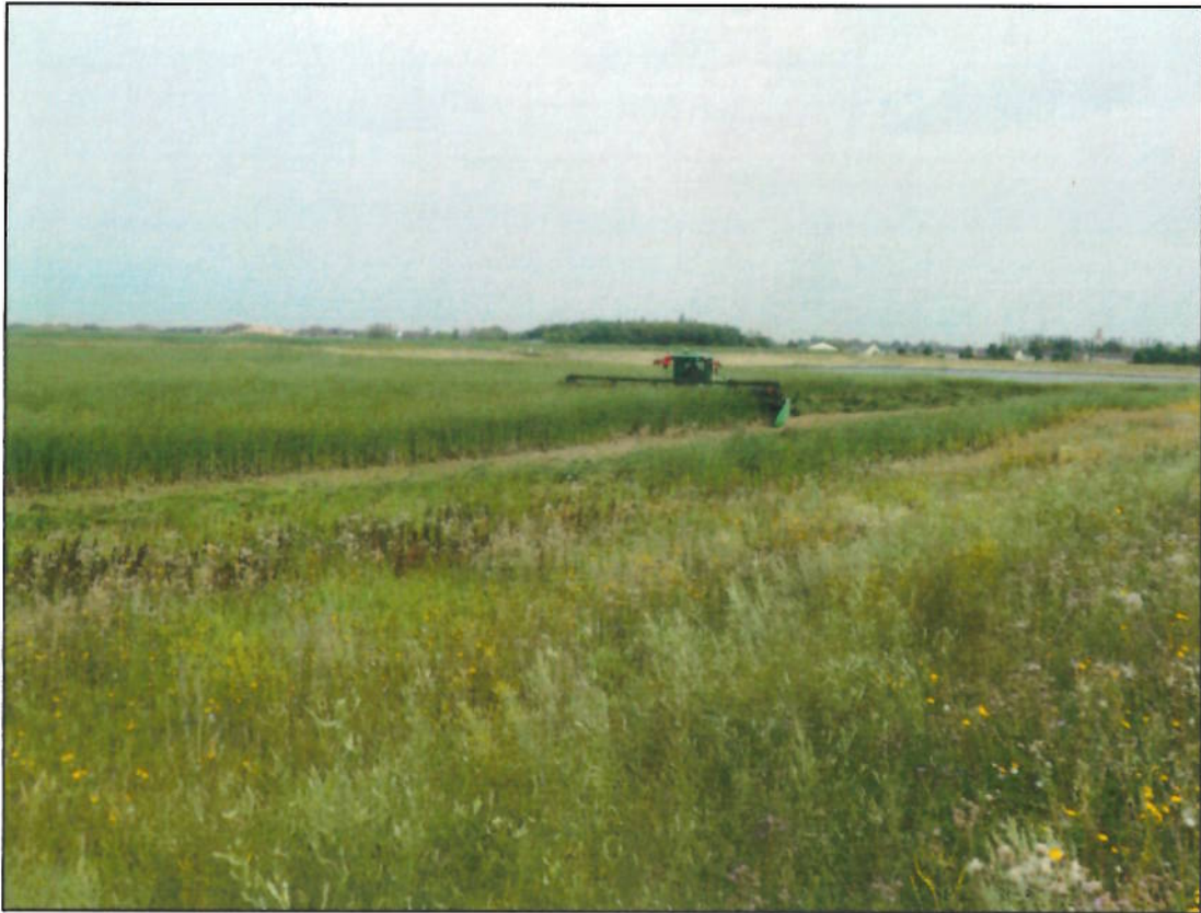
Figure 5. Cattail harvesting conducted on the former dry cell in August 2017, in preparation for landscaping in 2018.