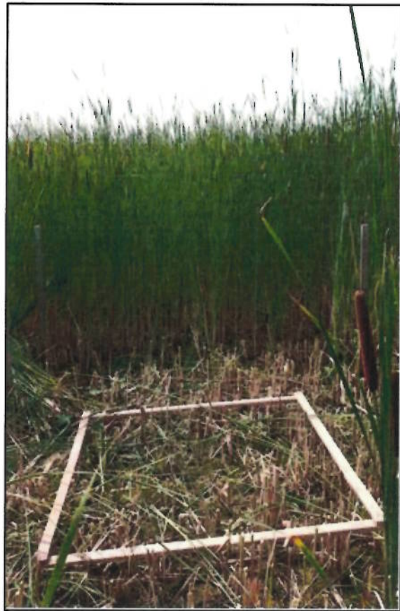
Figure 2. Plot harvested in the secondary cell, July 2017.