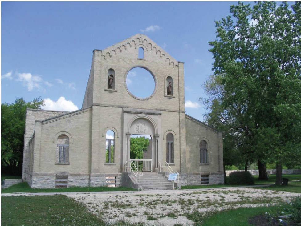
Photo 14: Remains of Trappist Monastery at Provincial Heritage Site (east of proposed project site).