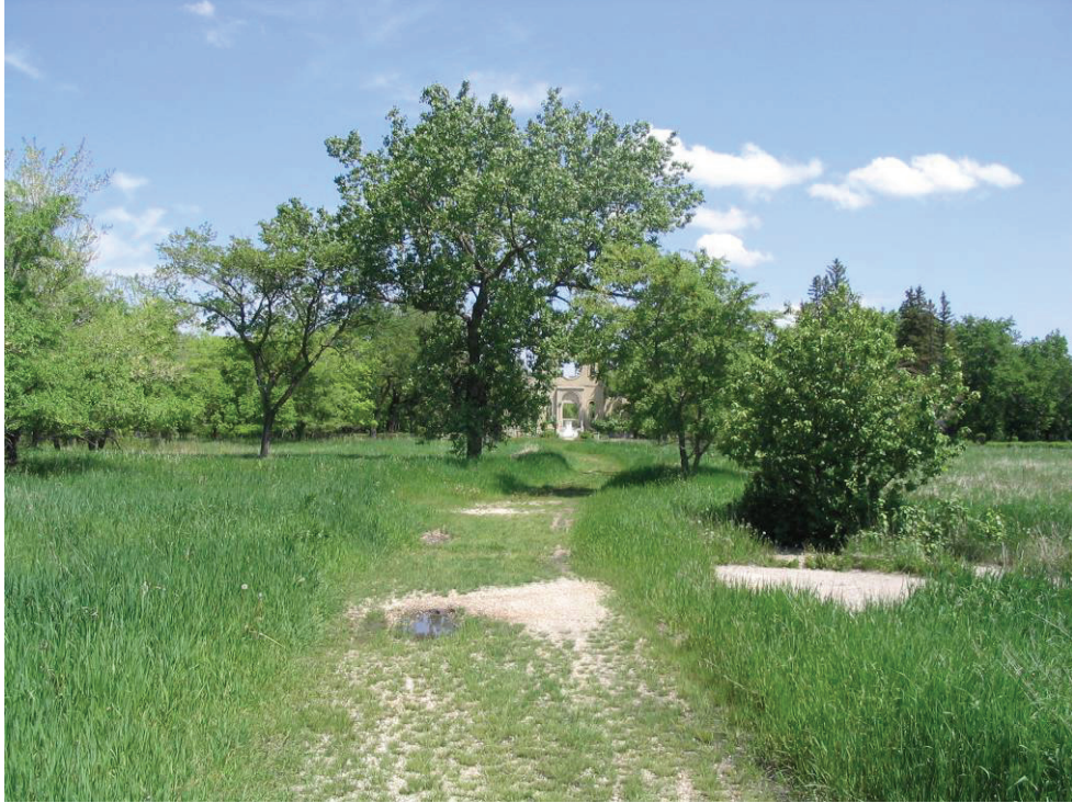
Photo 13: Looking west to the Trappist Monastery along an access trail on the subject site (note concrete foundation at lower right of photo).