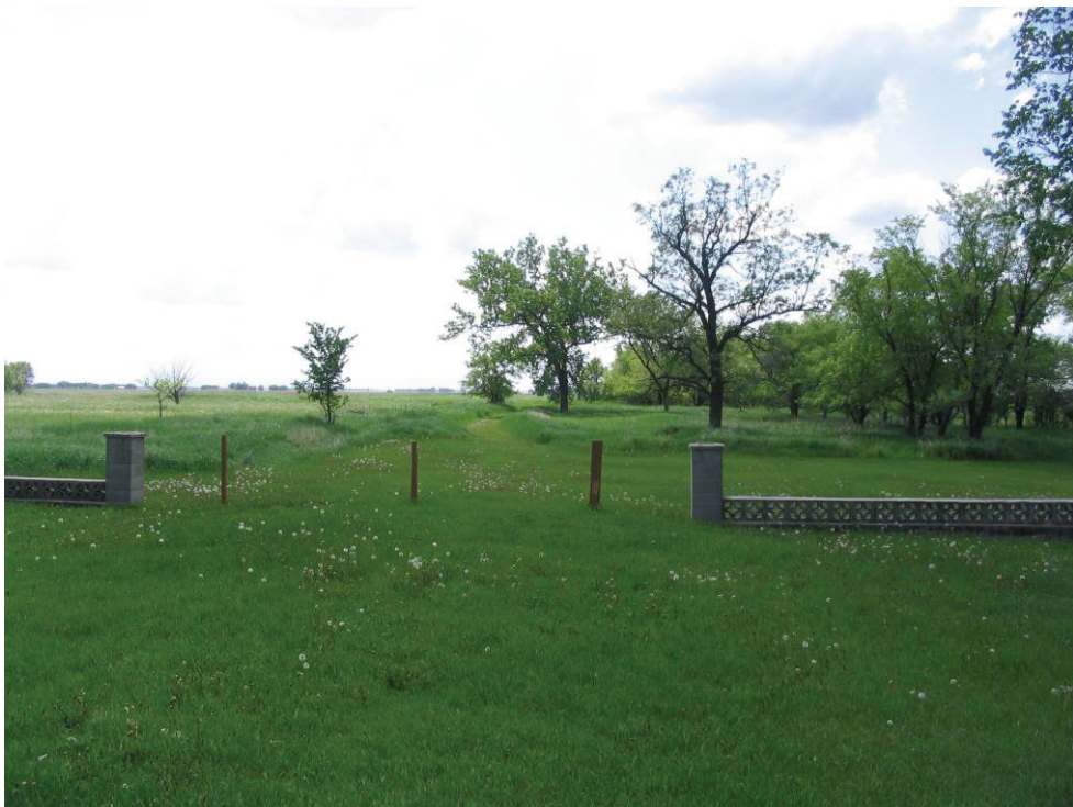
Photo 12: Looking west from Trappist Monastery Site to subject property.