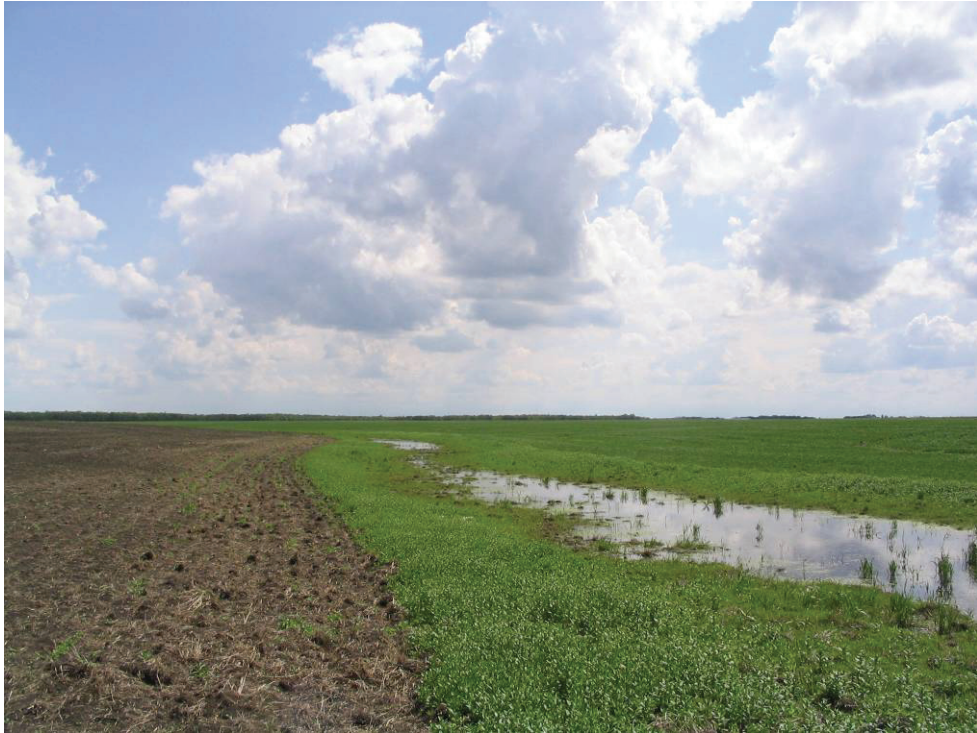
Photo 11: Looking south along a natural drainage channel on the proposed project site (at the northern end of the property).