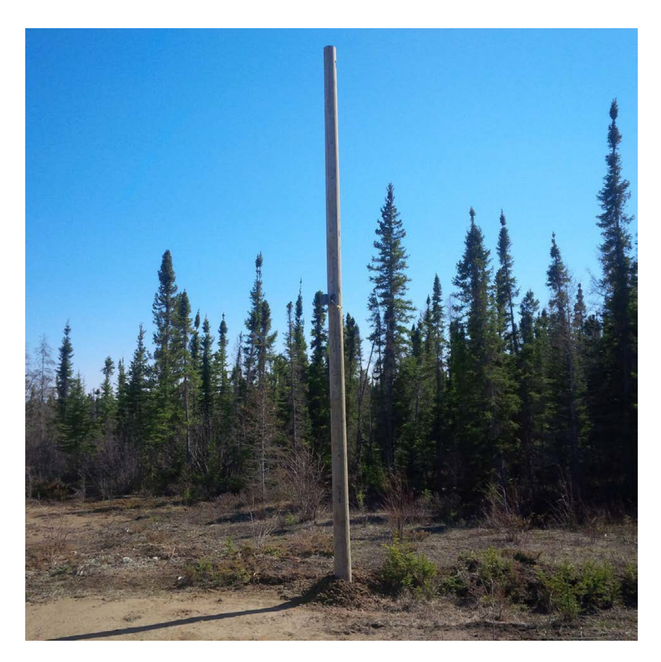
Figure 8-B Installed trail camera

The table presents the total number of vehicles passing through the security gate in a month, as well as the average number of vehicles passing through the security gate in a day for each month in the reporting period. On average 76 vehicles per day used the road during the reporting period beginning October 1, 2014 to September 31, 2015.