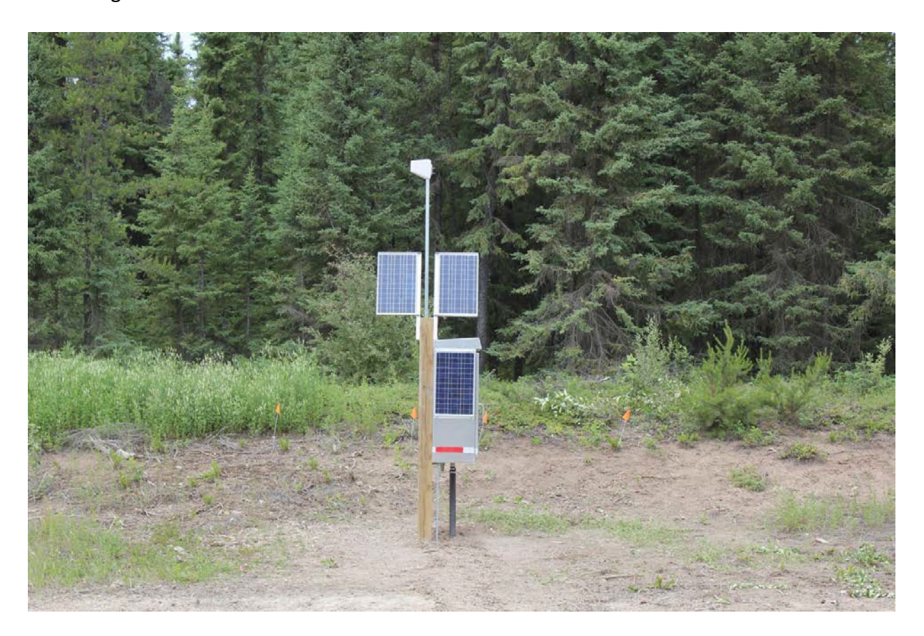
Figure 6-A Traffic monitoring station

Figure 6-A below shows a typical traffic monitoring station. Figure 6-B shows the locations of the monitoring stations.