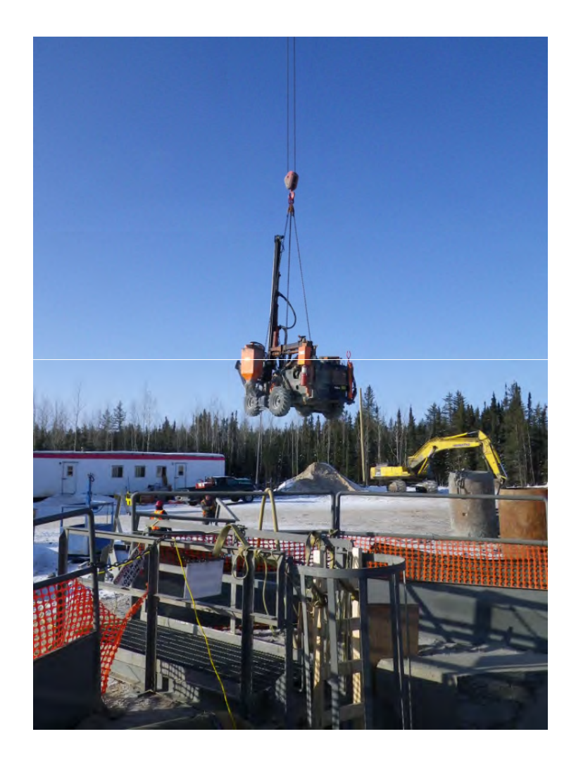
Lowering drill – Feb 24, 2011