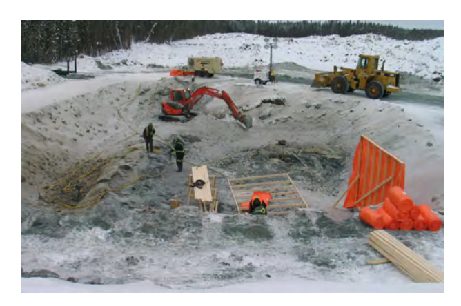
Excavation - Jan 24, 2011