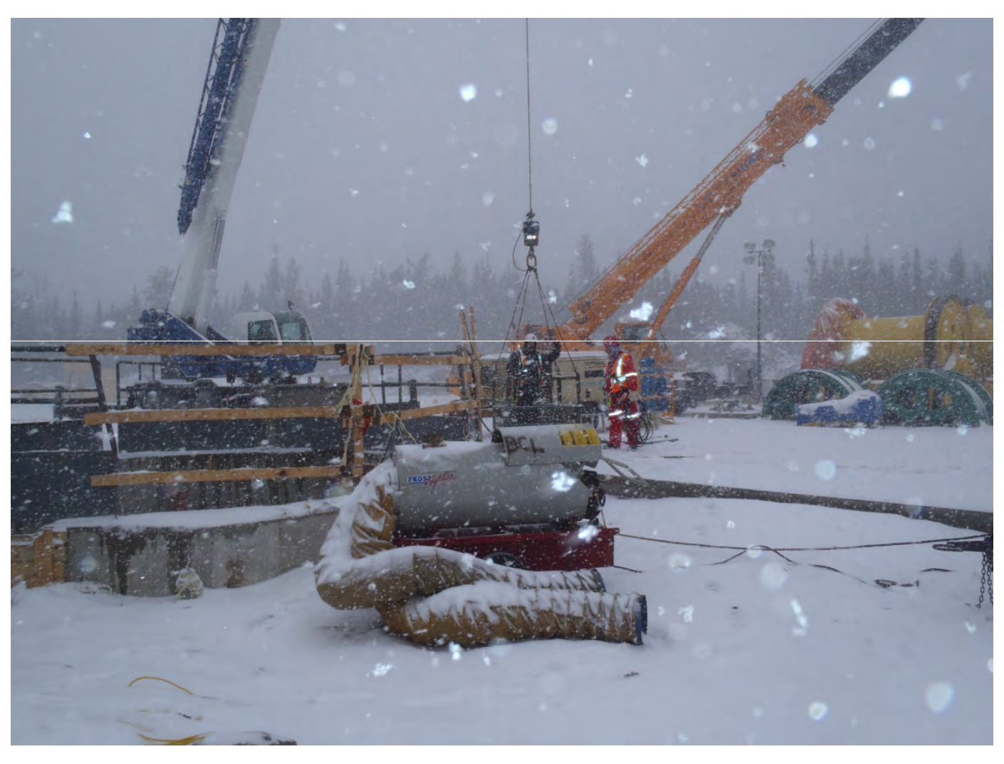
Spring?? – Apr 12, 2011