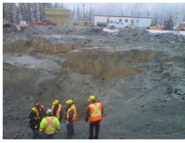
Collar excavation completed – Jan 12, 2011