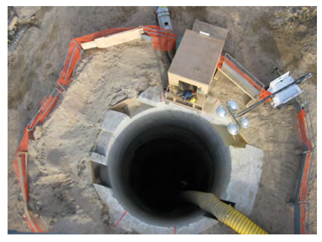
Looking down collar - Mar 20, 2011