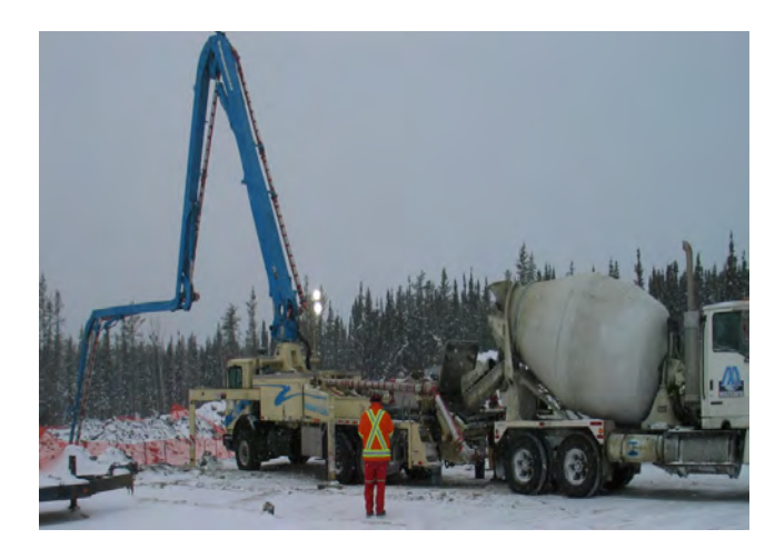
Collar First Concrete Pour - Jan 21, 2011