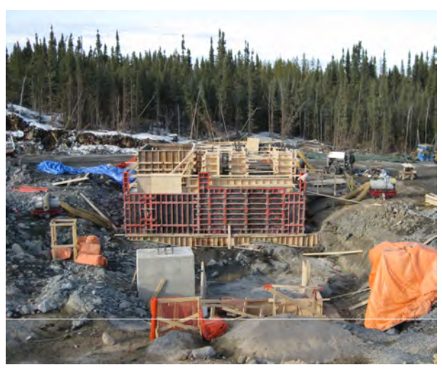
Hoisthouse foundation work - Mar 20, 2011