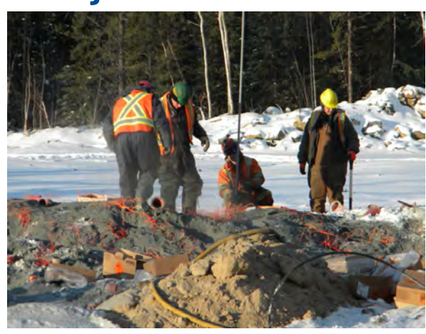
Loading first blast on collar - Dec 16, 2010