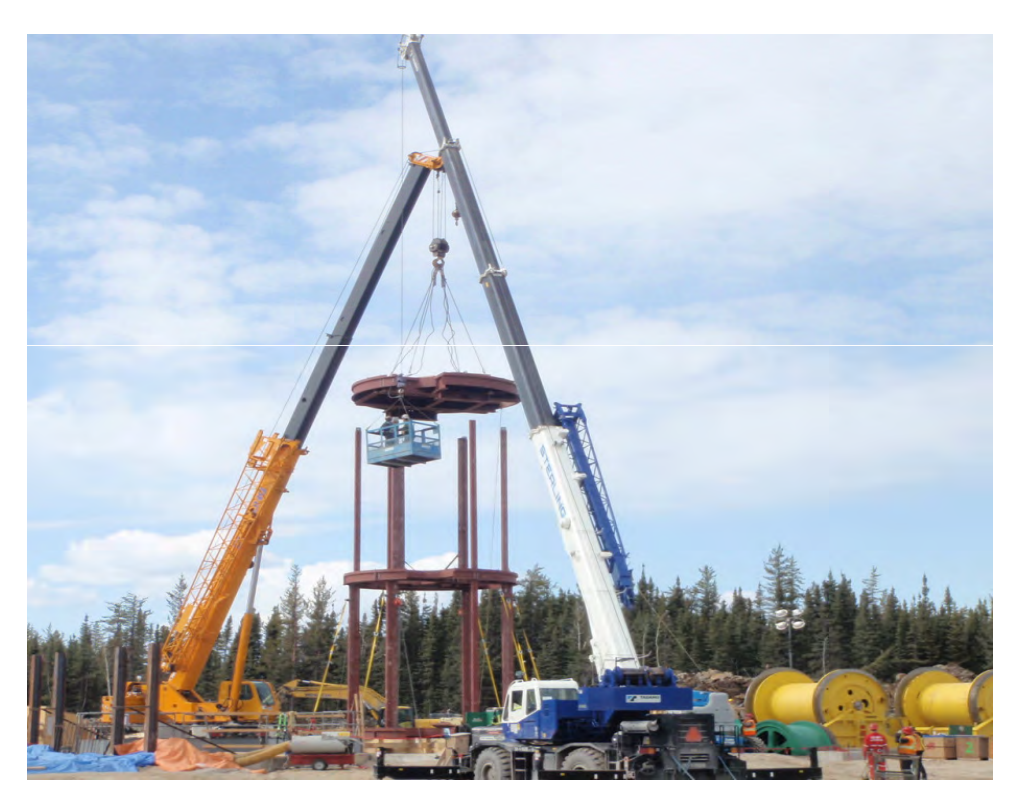
Placing Top Deck on Stage - Apr 10, 2011