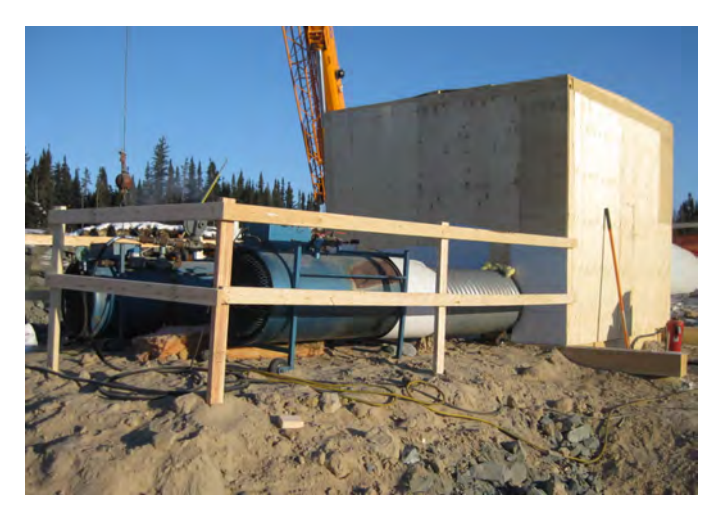
Shaft heating system - Mar 5, 2011