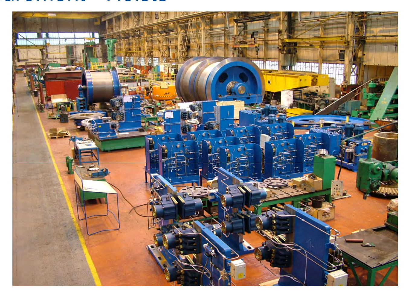
Lalor Auxiliary/Service Hoist Assembly DavyMarkham – Sheffield, UK