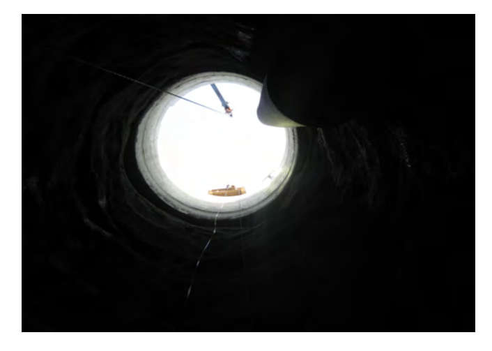
Looking up collar – Mar 20, 2011