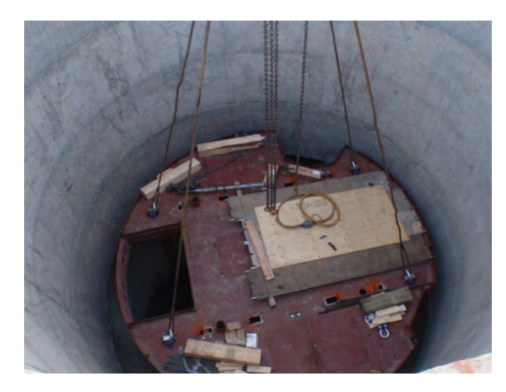
Galloway in Shaft – Apr 10, 2011