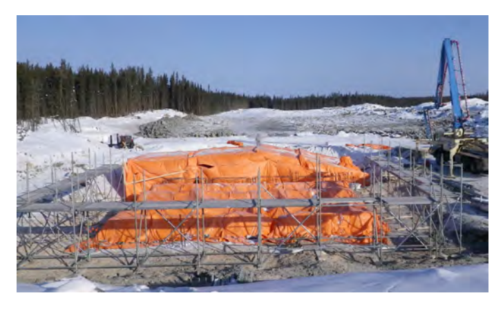
Initial formwork - Feb 24, 2011