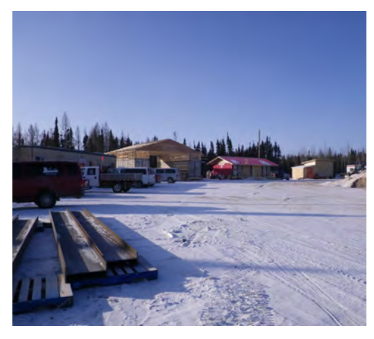
Offices - Feb 24, 2011