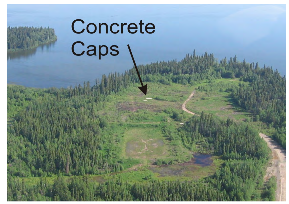
Spruce Point Mine (Currently)

Spruce Point Mine (During production - 1980's)