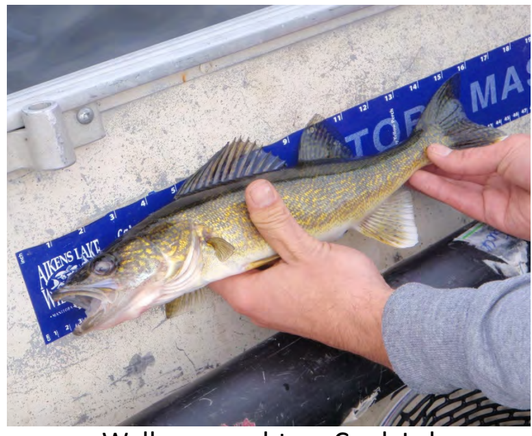
Walleye caught on Cook Lake