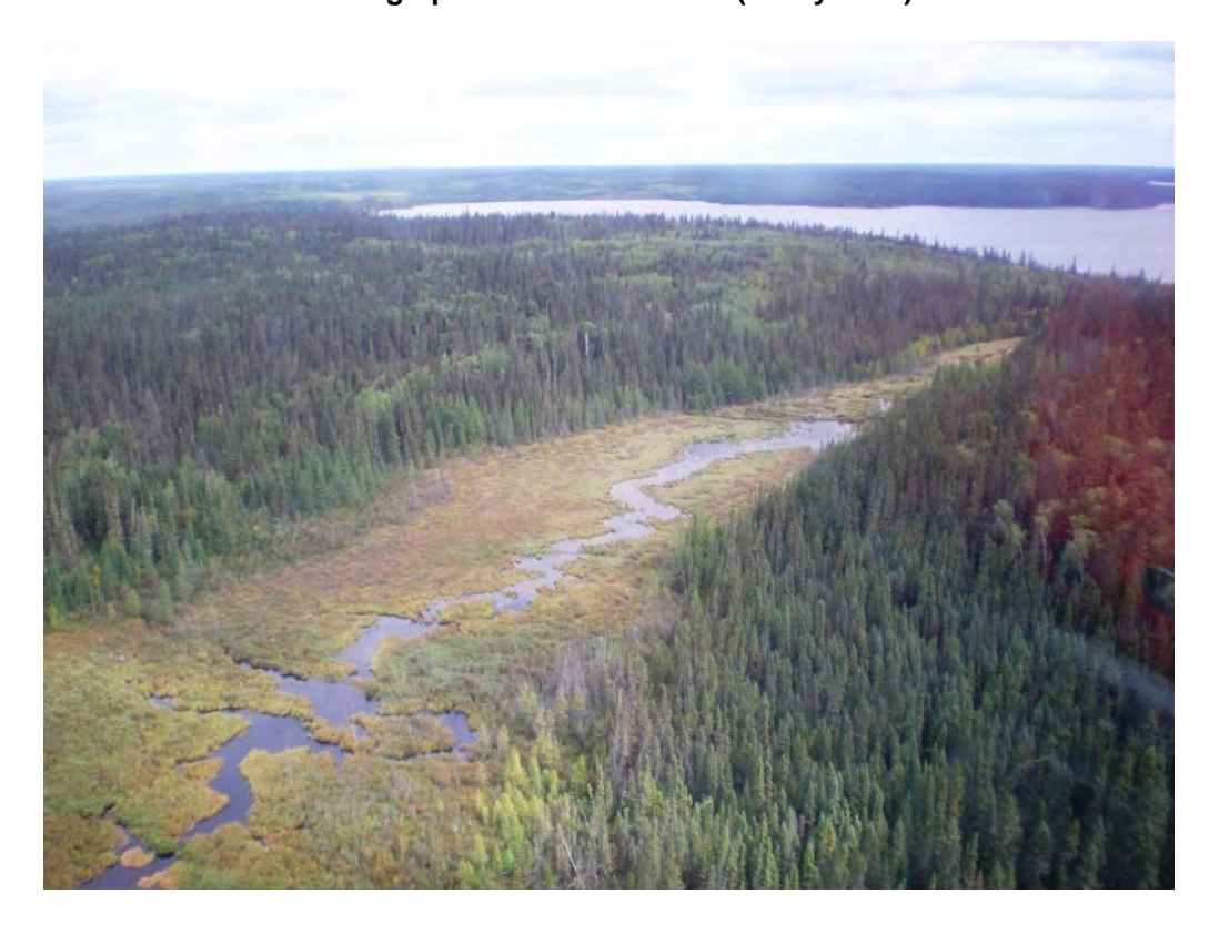
Photograph 04. Outflow from Varnson Lake into Squall Lake (background) (5 Sept 2007)