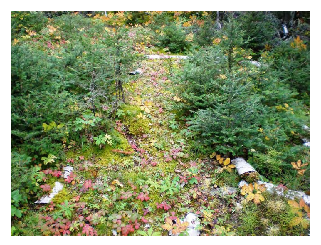
Photograph 07. Under canopy on south shore of Squall Lake (5 Sept 2007)