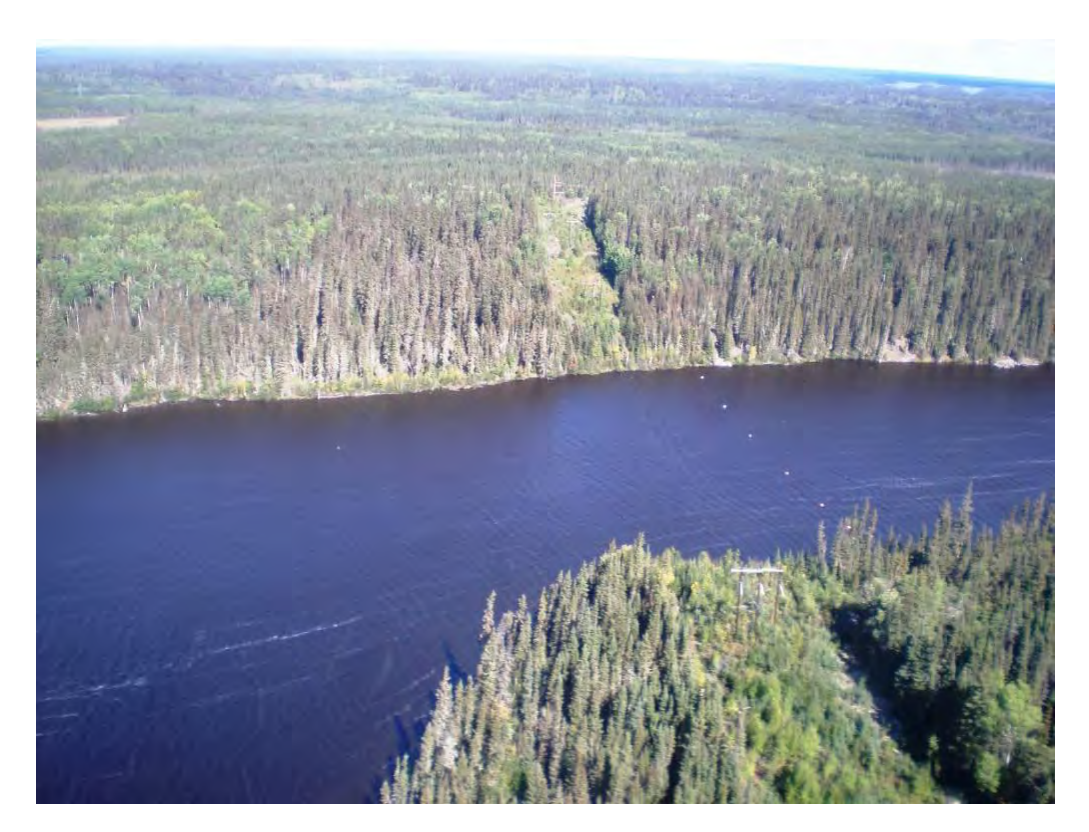
Photograph 11. Power line crossing to Chisel Lake across Snow Lake, looking North (5 Sept 2007)