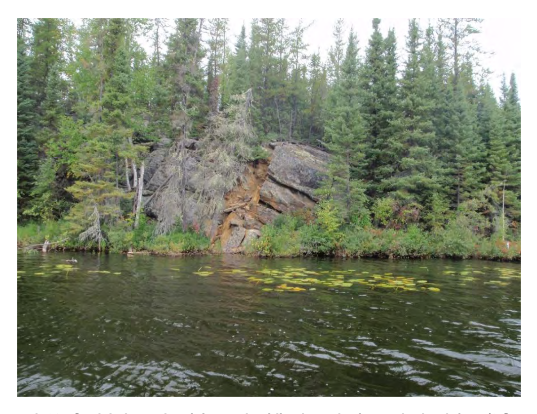
Photograph 28. Cook Lake: red staining and oxidized weathering on bedrock face (9 Sept 2008)