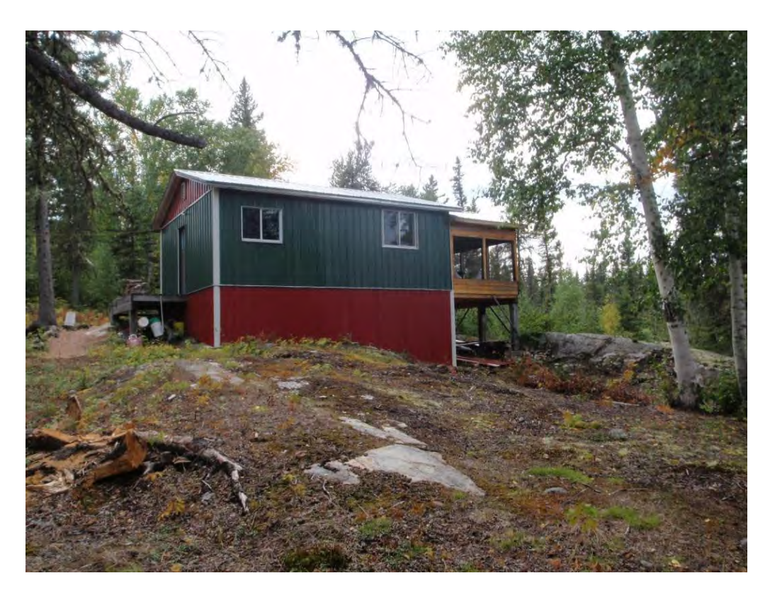
Photograph 25. C01- Four season cabin and dock on peninsula of Cook Lake (9 Sept 2008)