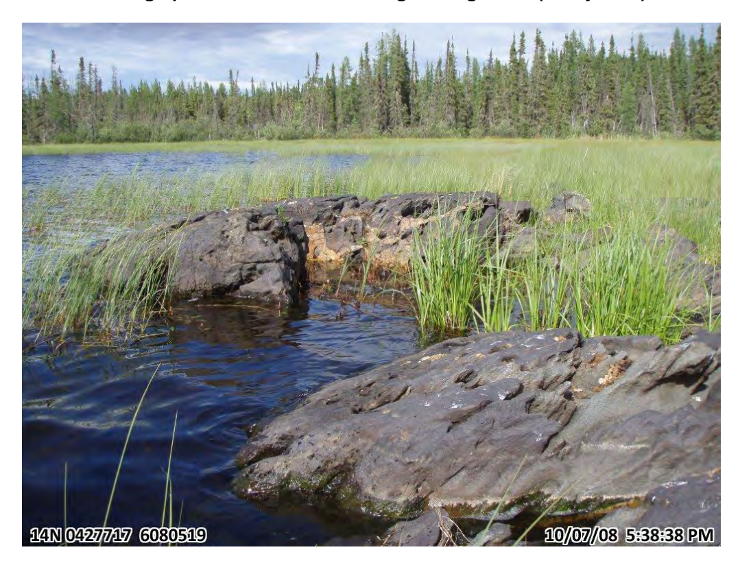
Photograph 20. Rocky habitat in Tern Ditch Pond (8 July 2010)