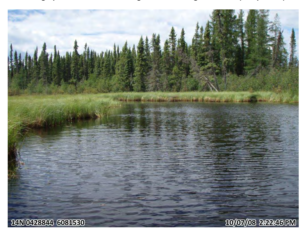
Photograph 16. Sampling location in Tern Creek (8 July 2010)