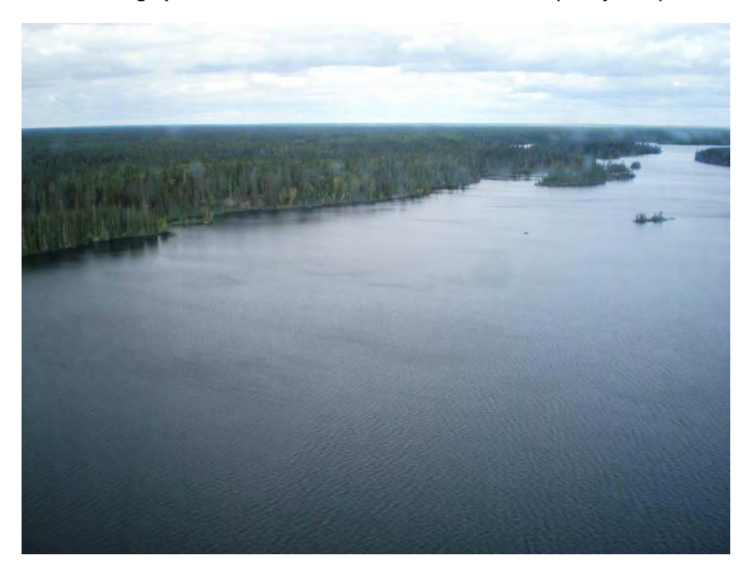
Photograph 22. Cook Lake looking south (5 Sept 2007)