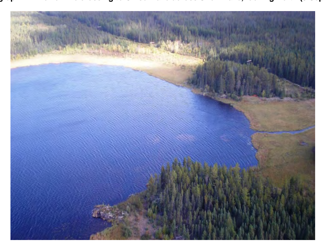
Photograph 12. Tern Lake looking east, power line in background (5 Sept 2007)