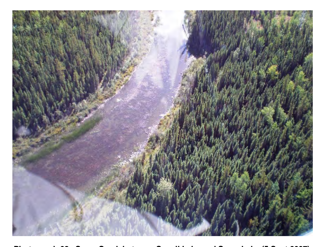
Photograph 08. Snow Creek between Squall Lake and Snow Lake (5 Sept 2007)