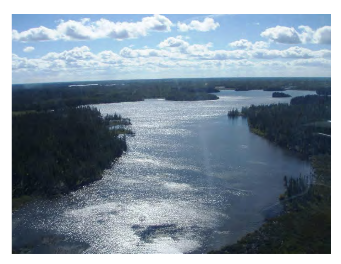
Photograph 23. Cook Lake looking south (5 Sept 2007)