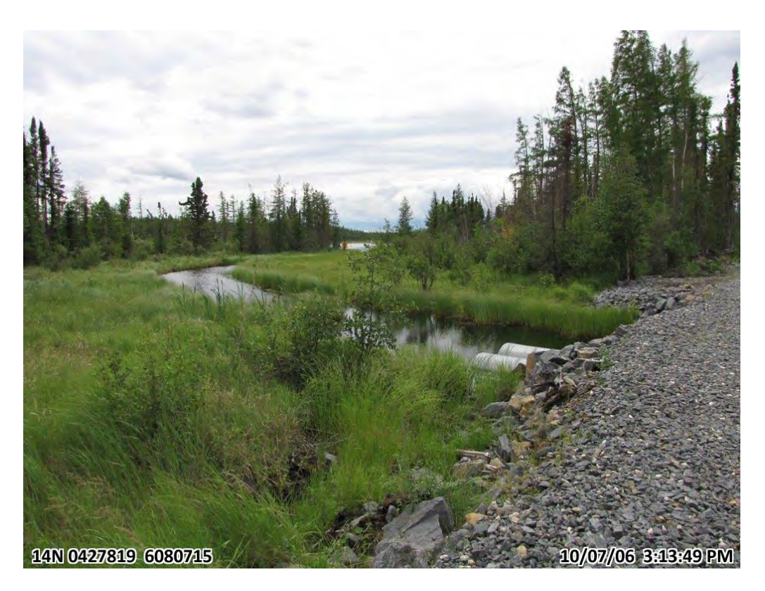
Photograph 19. Tern Ditch crossing looking south (6 July 2010)