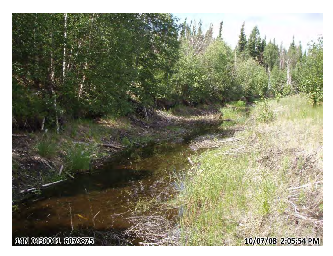
Photograph 17. Sampling location in Tern Ditch (8 July 2010)