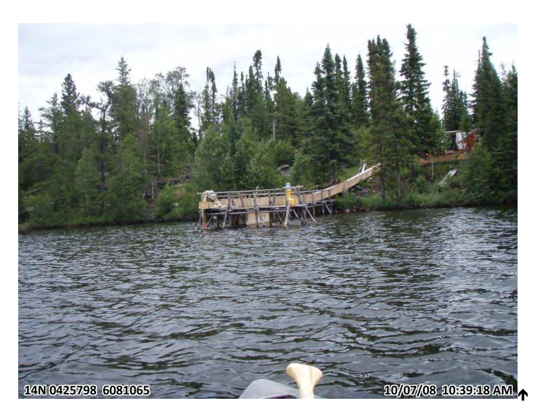
Photograph 29. Lalor Lake temporary water supply (8 July 2010)