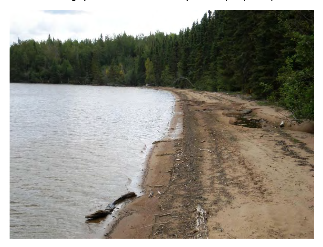
Photograph 06. Beach at south shore of Squall Lake looking East (5 Sept 2007)