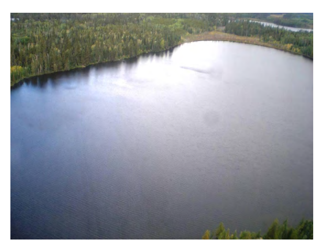
Photograph 01. Maw Lake viewed from the south (5 Sept 2007)