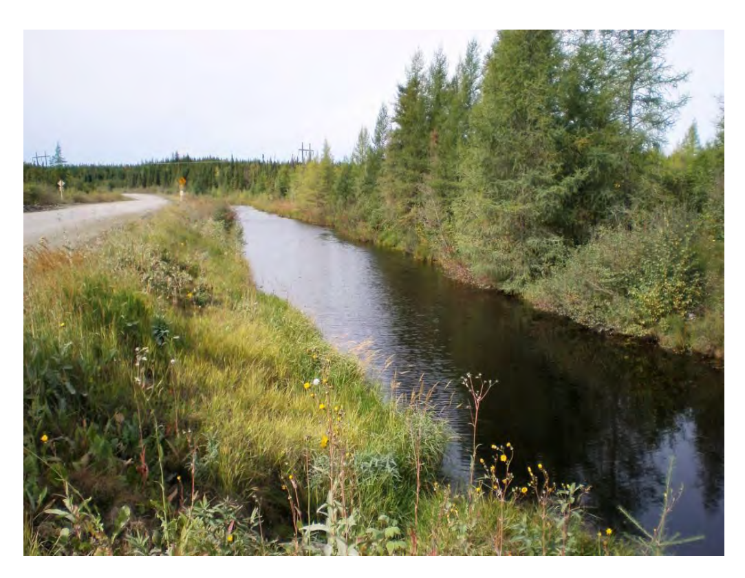
Photograph 15. Tern Creek along PR 395 looking northwest (6 Sept 2007)