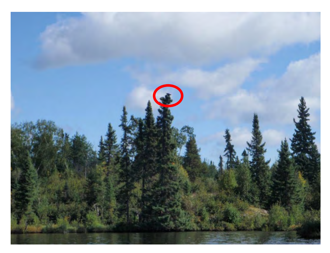
Photograph 27. Pair of bald eagles in south arm of Cook Lake. (One adult, one juvenile) (10 Sept 2008)