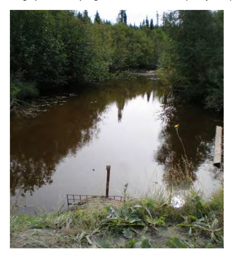
Photograph 18. Tern Ditch culvert in old rail bed north of Ghost Lake, looking north (6 Sept 2007)