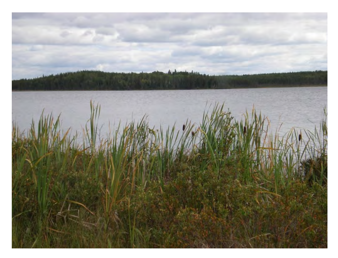
Photograph 03. Varnson Lake (8 July 2010)