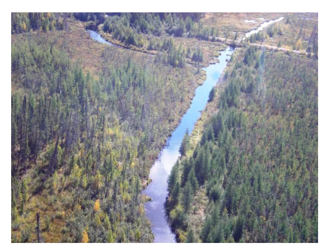
Photograph 13. Drainage channel to Tern Lake, PR 305 in background, looking south southeast (5 Sept 2007)