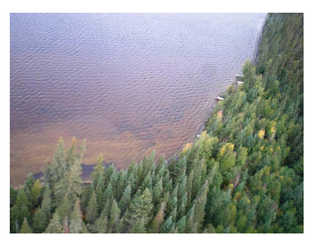
Photograph 05. Southeast end of Squall Lake (5 Sept 2007)