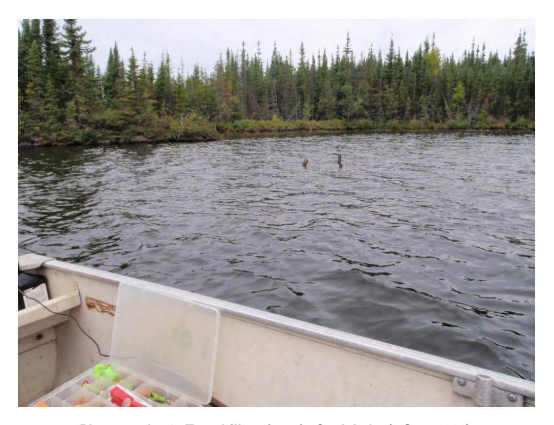
Photograph 24. Two drill casings in Cook Lake (9 Sept 2008)