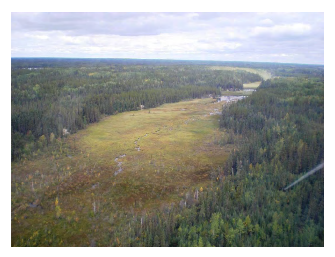
Photograph 02. Wetland drainage from Maw Lake to Varnson Lake looking north (5 Sept 2007)