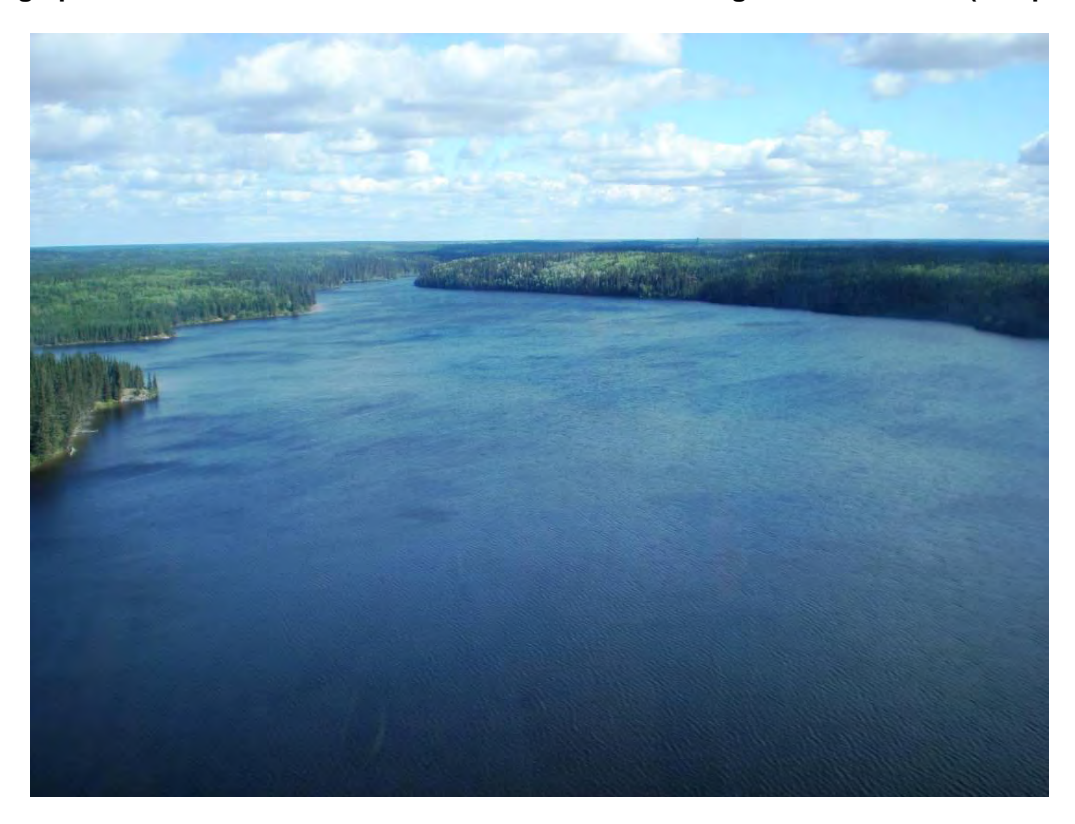
Photograph 10. Snow Lake looking East (5 Sept 2007)