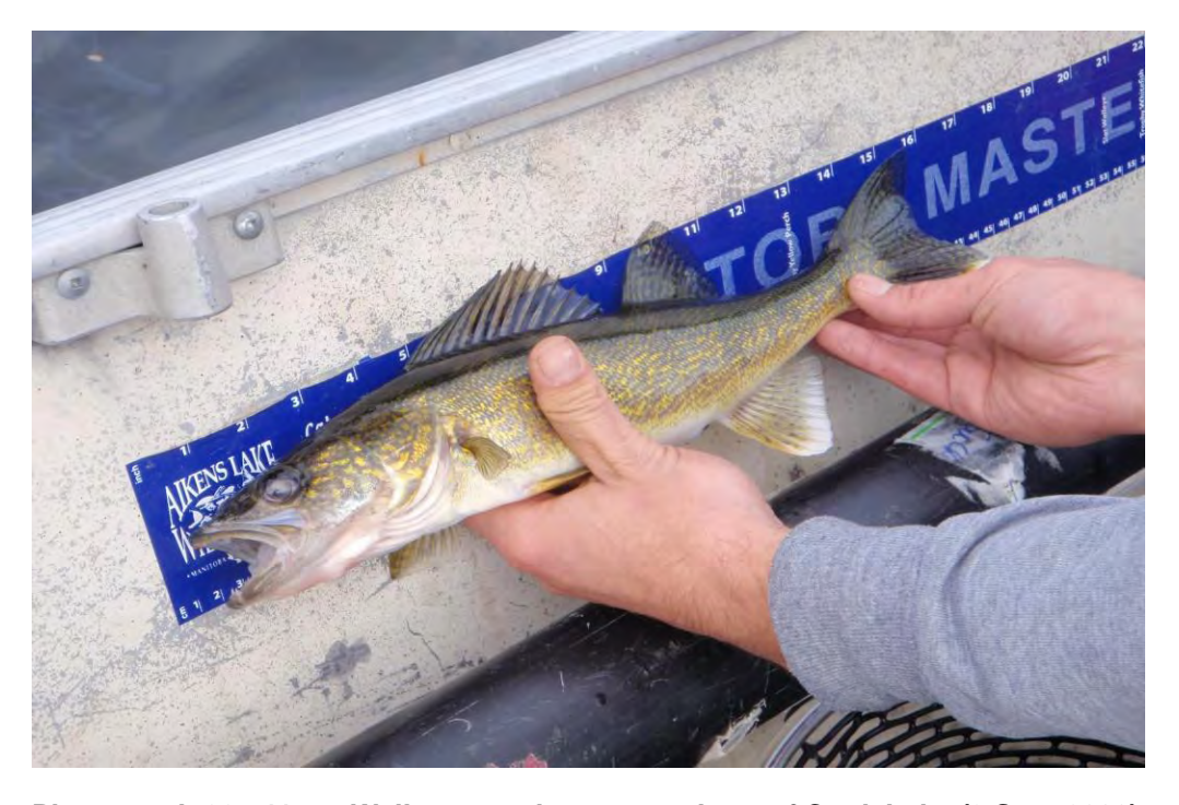
Photograph 26. 41 cm Walleye caught on east shore of Cook Lake (9 Sept 2008)