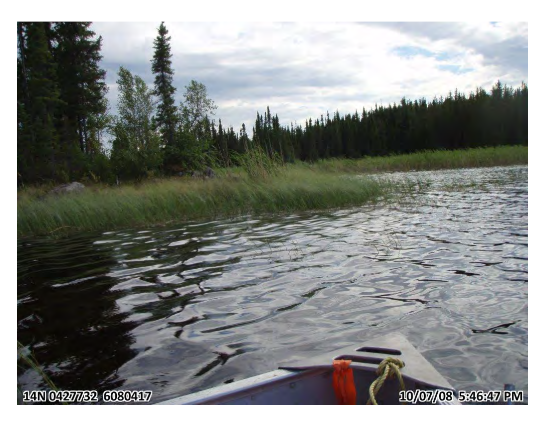
Photograph 21. Shoreline habitat in Tern Ditch Pond (8 July 2010)