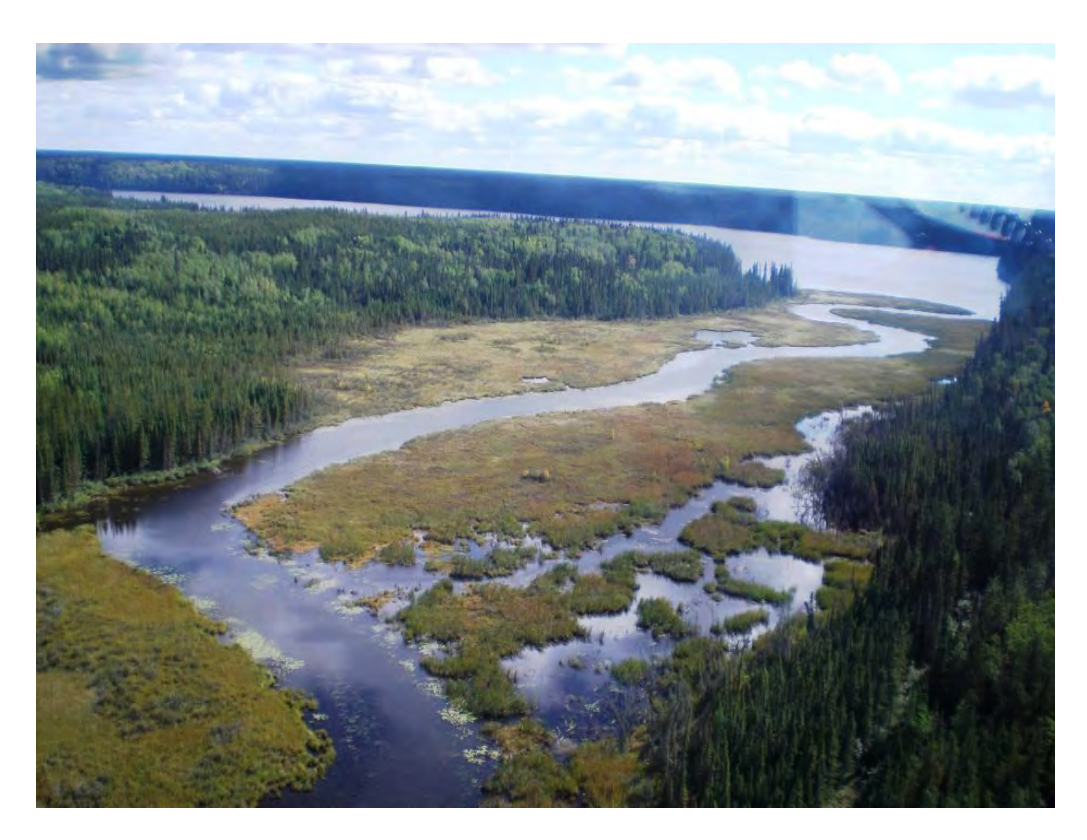
Photograph 09. Outflow of Snow Creek into Snow Lake looking south southeast (5 Sept 2007)