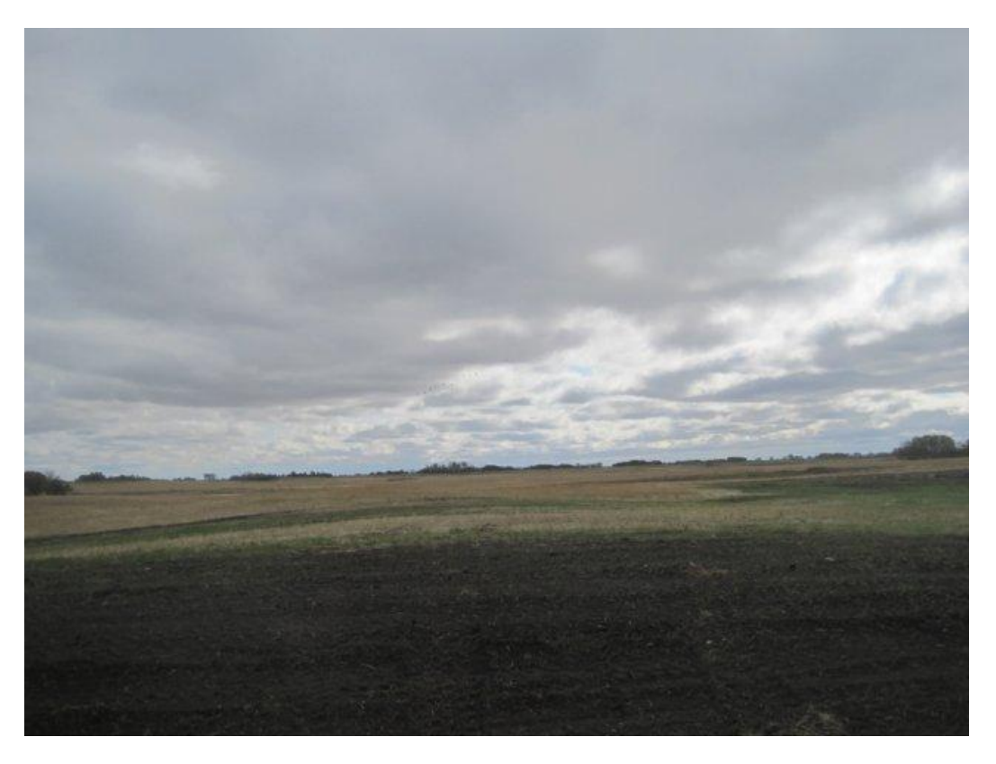
Photoplate 65 - View north on pipeline route in NE 29-2-29 WPM.