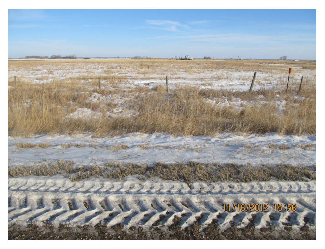
Photoplate 51 - View east in NW 23-2-29 WPM on pipeline route.