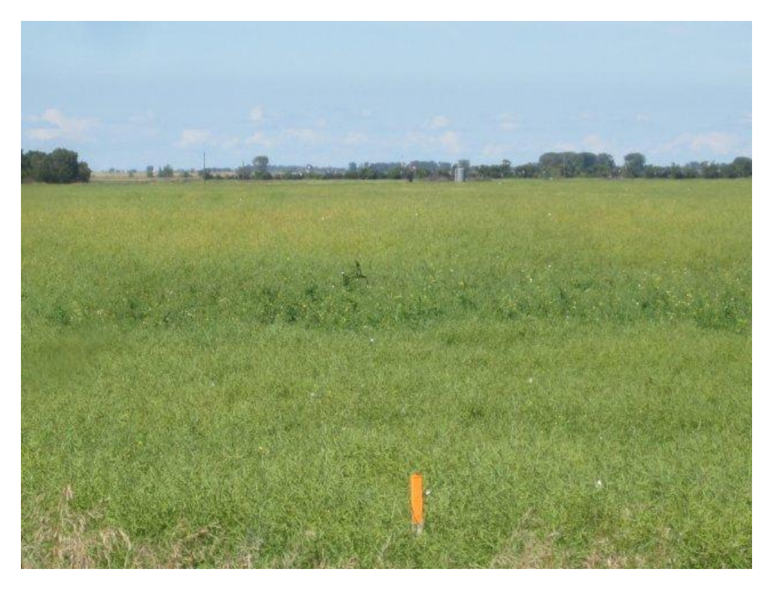
Photoplate 27 - View west on pipeline route in SE 8-2-28 WPM.