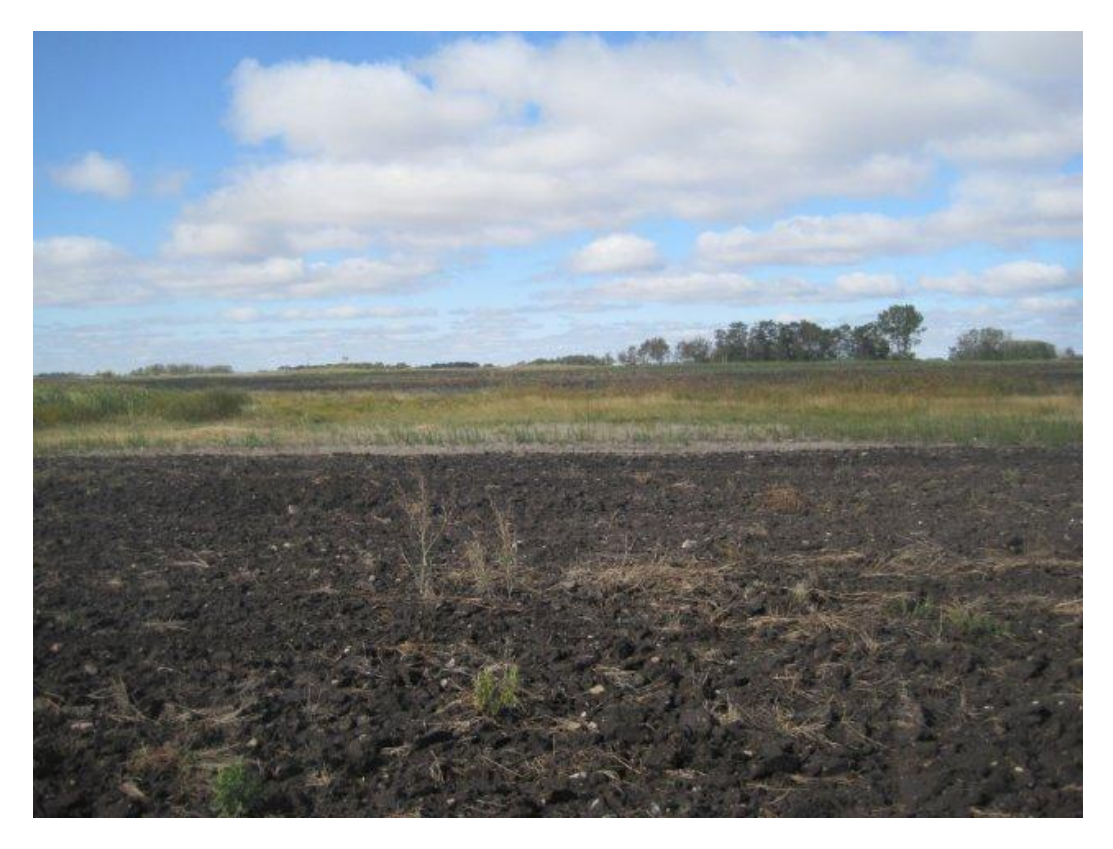
Photoplate 87 - View west over drainage crossing in SW 6-3-29 WPM on pipeline route.