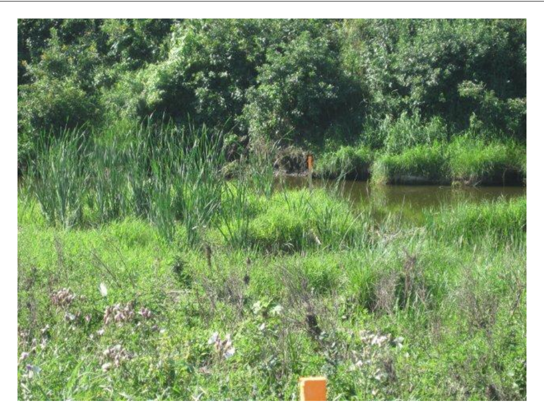
Photoplate 13 - View south toward Gainsborough Creek pipeline crossing route in SE 2-2-28 WPM.