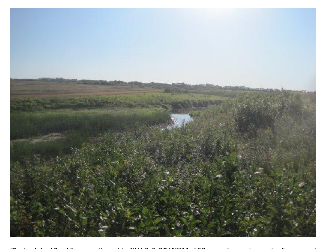
Photoplate 10 – View southeast in SW 3-2-28 WPM, 100m upstream from pipeline crossing route.