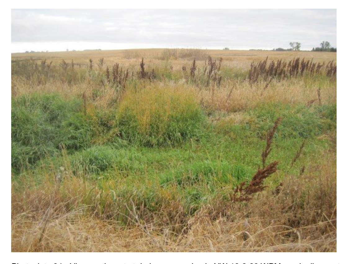
Photoplate 34 - View northwest at drainage crossing in NW 18-2-28 WPM on pipeline route.