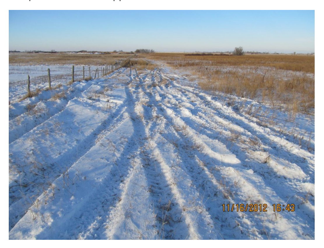
Photoplate 54 – View north at quarter line in NE 22-2-29 WPM on pipeline route.