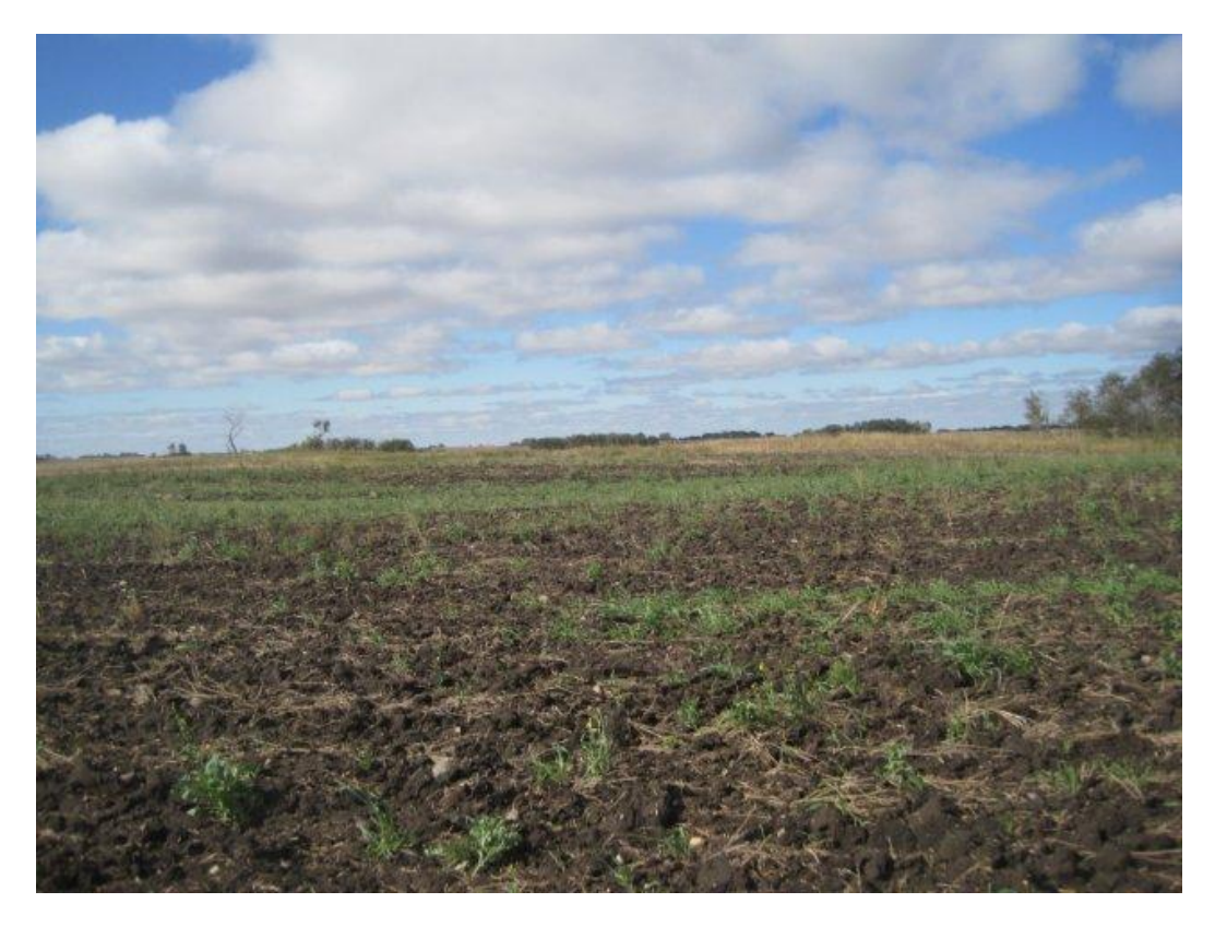
Photoplate 93 - View west on pipeline route west of drainage in SW 6-3-29 WPM.