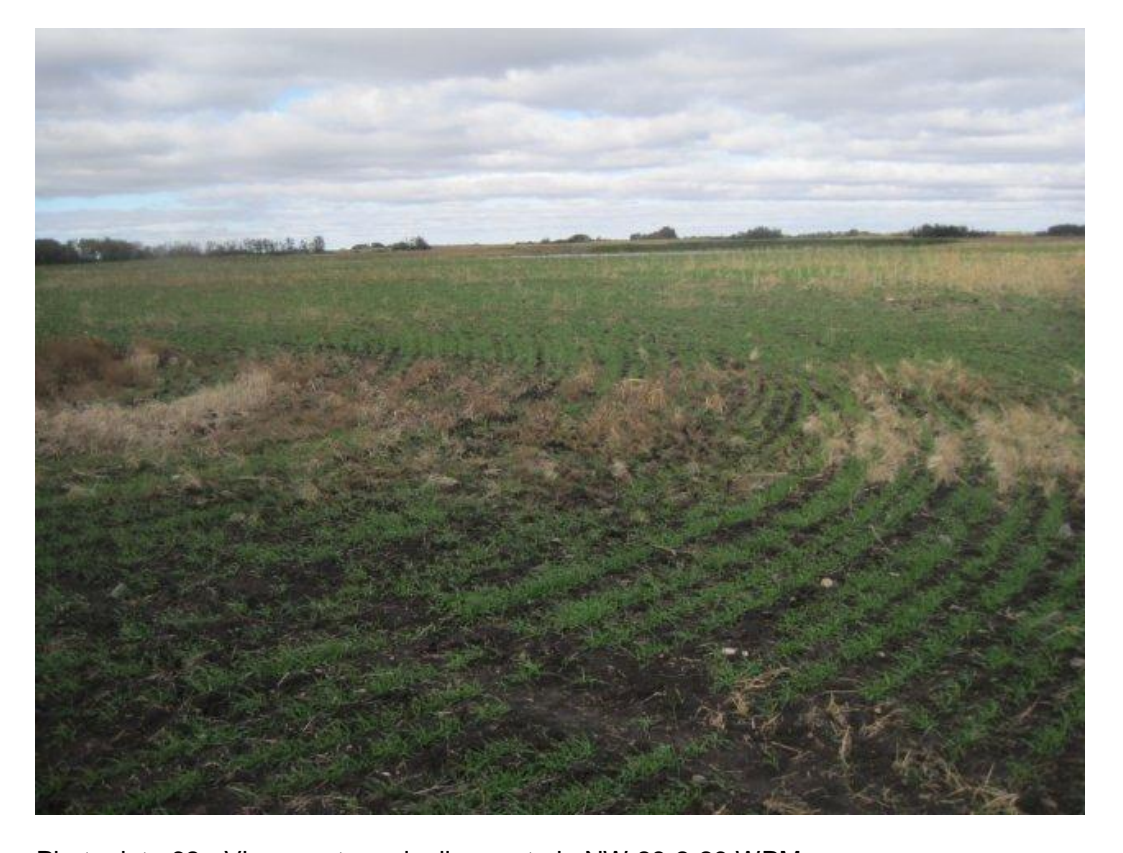
Photoplate 62 - View west on pipeline route in NW 28-2-29 WPM.