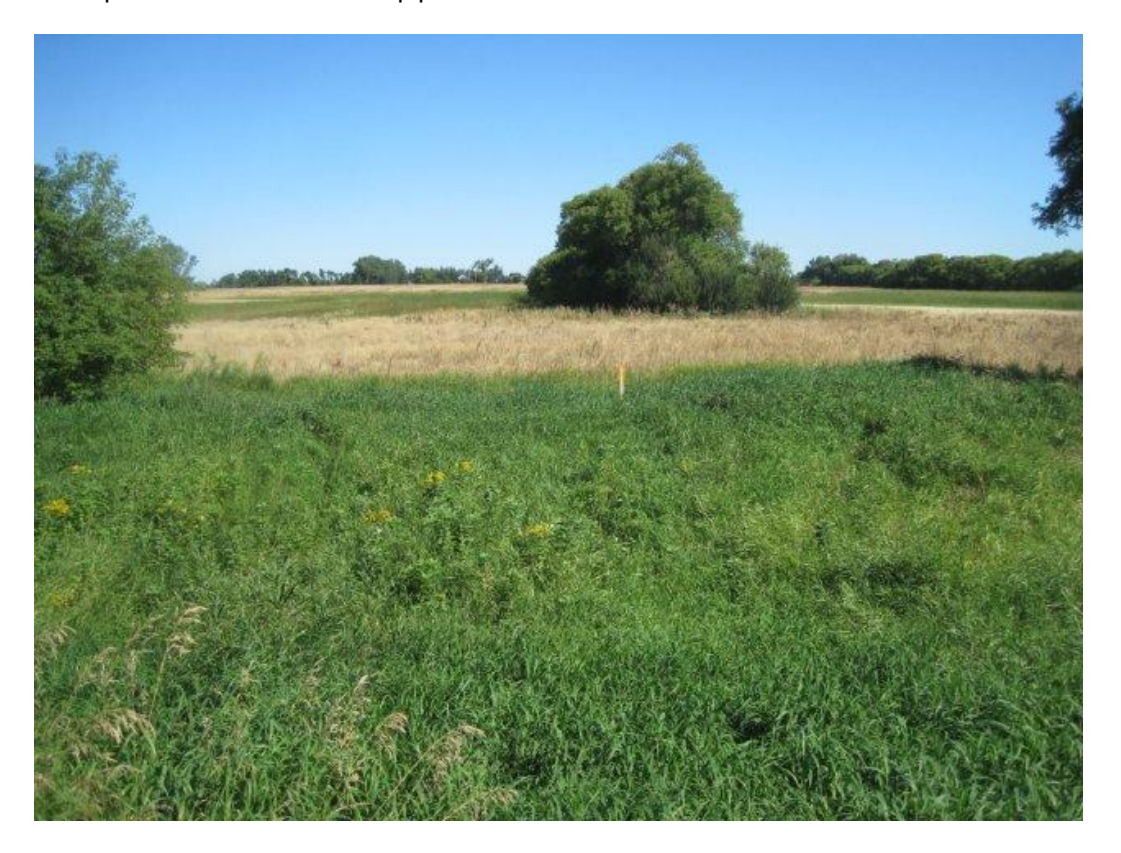
Photoplate 20 - View north on pipeline route from road allowance into SW 10-2-28 WPM.