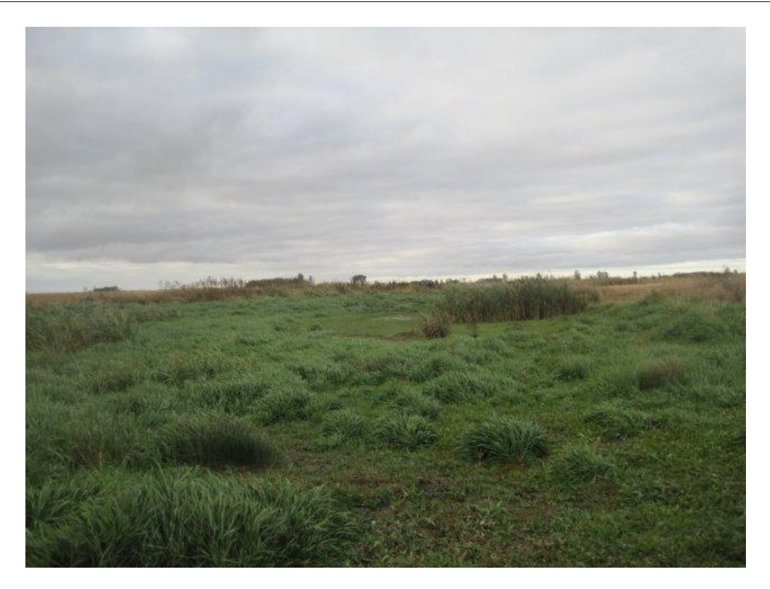
Photoplate 39 - View west 100m upstream (west) of drainage crossing in NW 18-2-28 WPM.