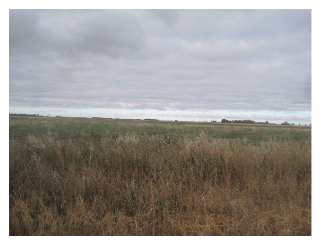
Photoplate 45 - View of pipeline route on NW 13-2-29 WPM.