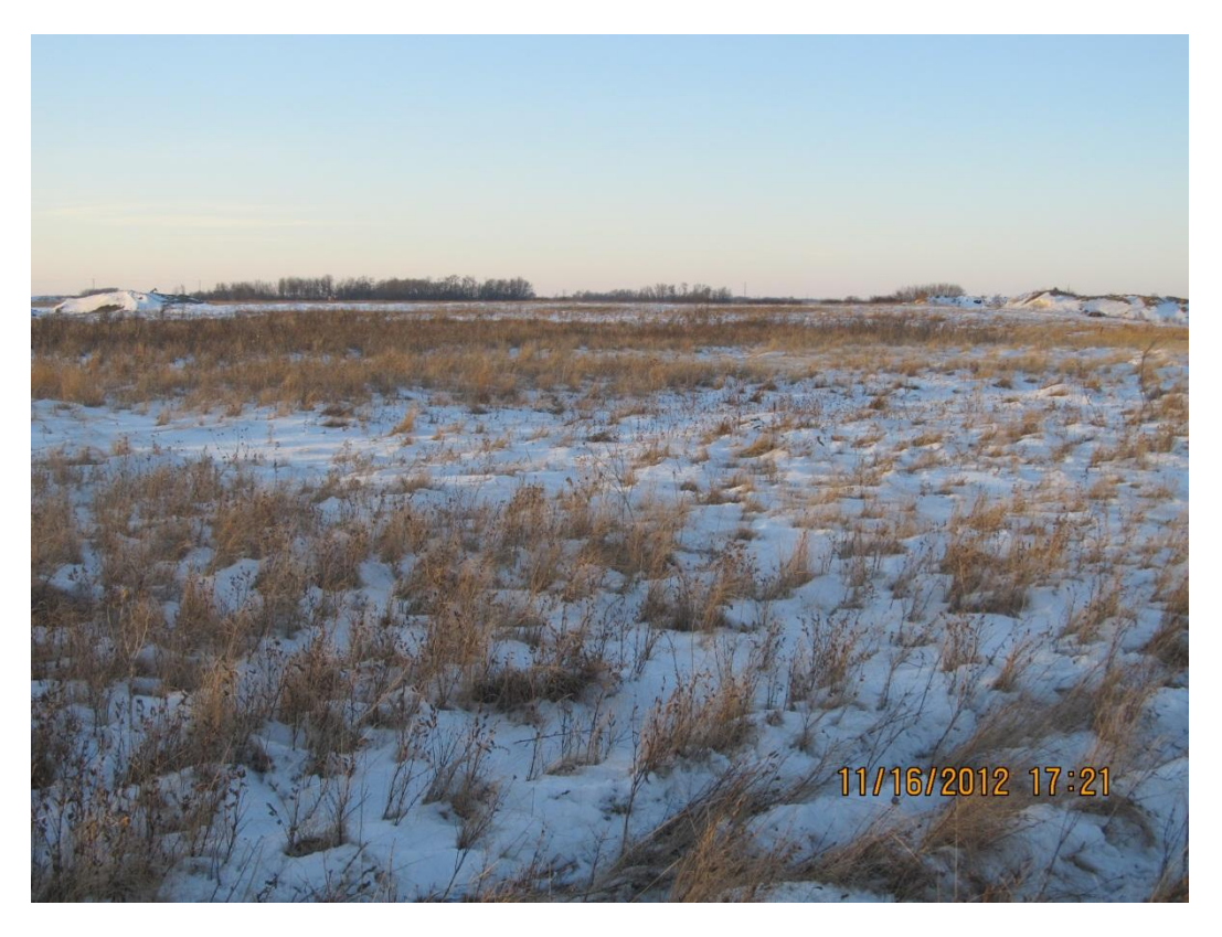
Photoplate 55 – View northwest on pipeline route in NW 22-2-29 WPM.