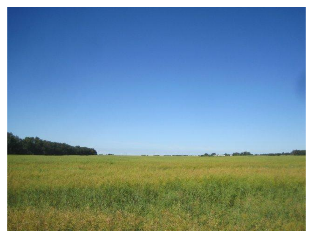
Photoplate 25 - View west on pipeline route in SW 9-2-28 WPM.