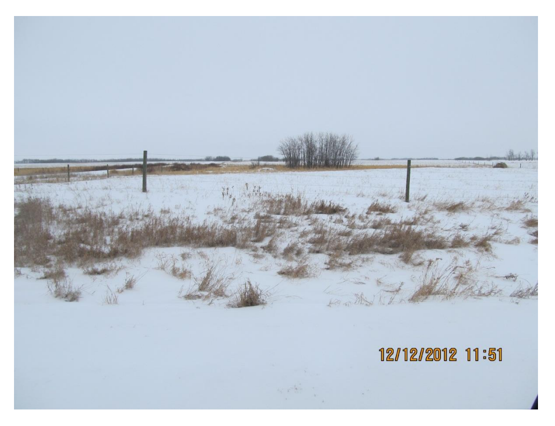
Photoplate 77 – View east on pipeline route in SW 31-2-29 WPM at low spot south of alley.