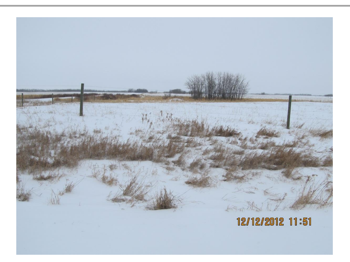
Photoplate 75 – View north on low spot in southwest corner SW 31-2-29 WPM on pipeline route.