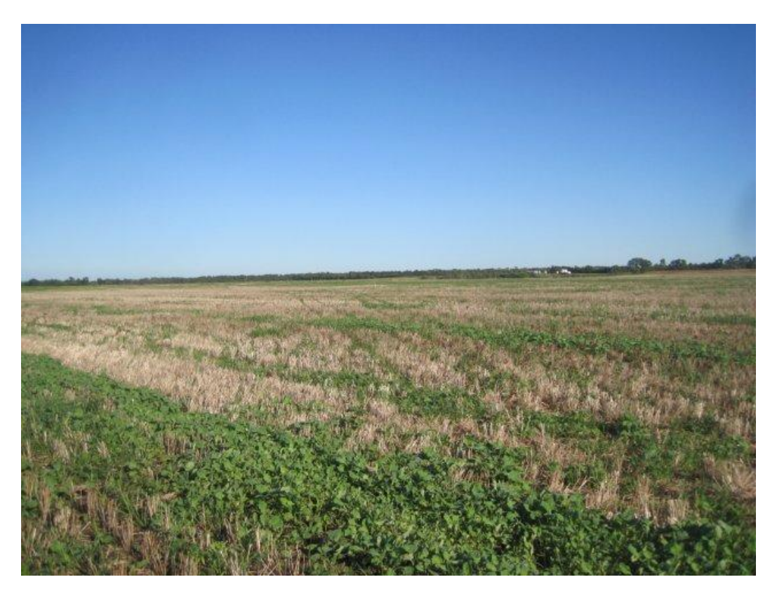
Photoplate 5 - View northwest on pipeline route in SW 3-2-28 WPM.