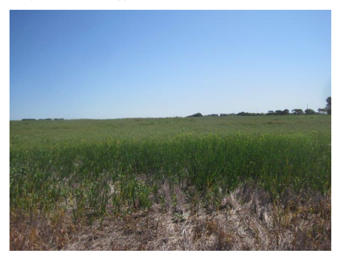
Photoplate 28 - View north on pipeline route in SW 8-2-28 WPM.