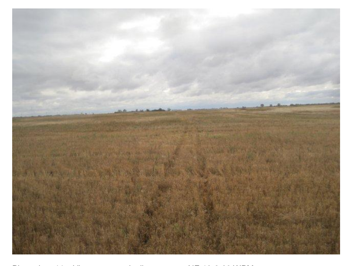
Photoplate 44 – View west on pipeline route on NE 13-2-29 WPM.