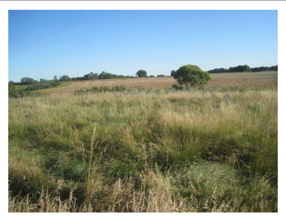
Photoplate 7 - View north toward Gainsborough Creek in SW 3-2-28 WPM on pipeline route.