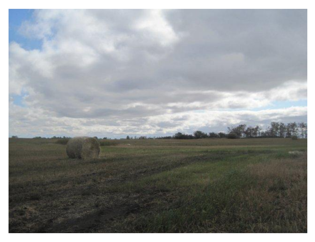
Photoplate 63 - View west on pipeline route in NW 28-2-29 WPM.