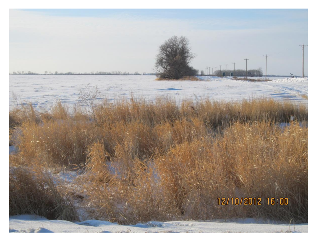
Photoplate 31 - View west in NE 7-2-28 WPM on pipeline route.