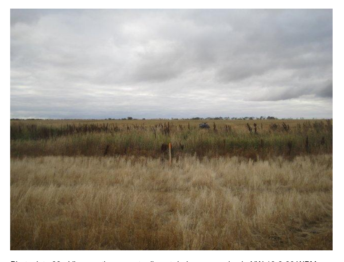
Photoplate 38 - View south on quarter line at drainage crossing in NW 18-2-28 WPM.