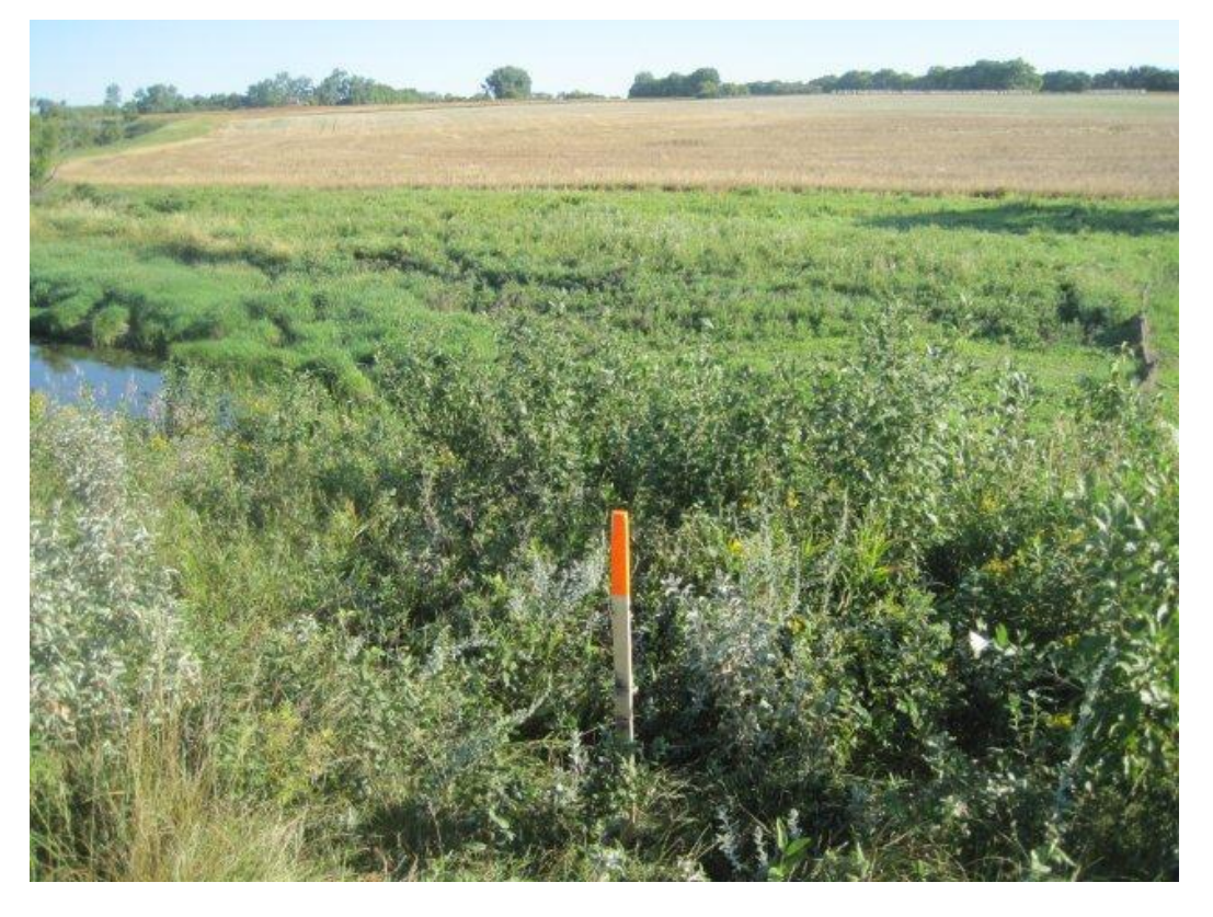
Photoplate 8 - View north at Gainsborough Creek pipeline route crossing in SW 3-2-28 WPM.