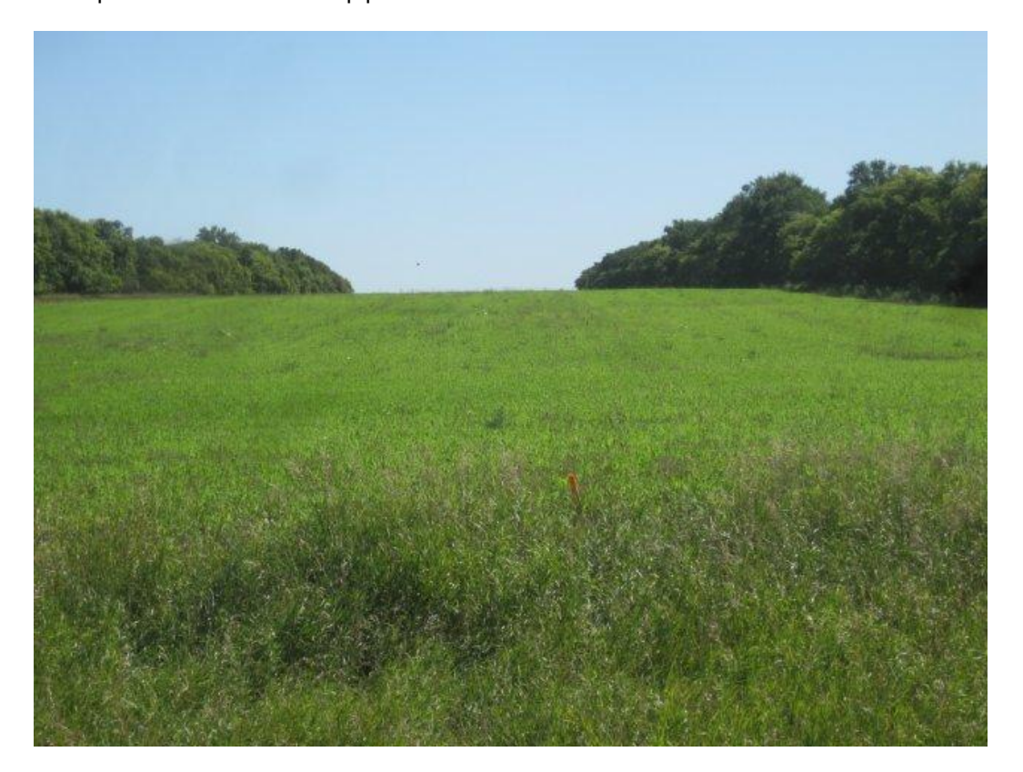
Photoplate 2 – View north on pipeline route in SE 2-2-28 WPM.