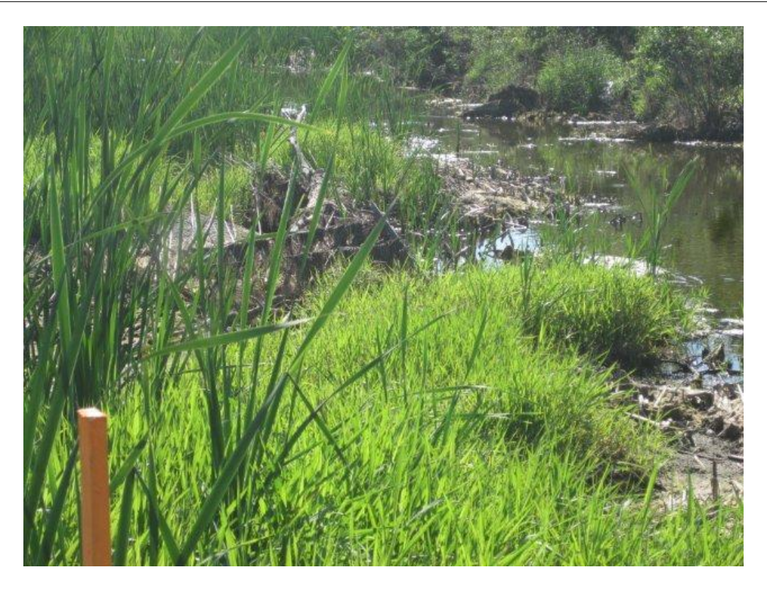
Photoplate 15 - View west toward Gainsborough Creek pipeline crossing route in SW 3-2-28 WPM.