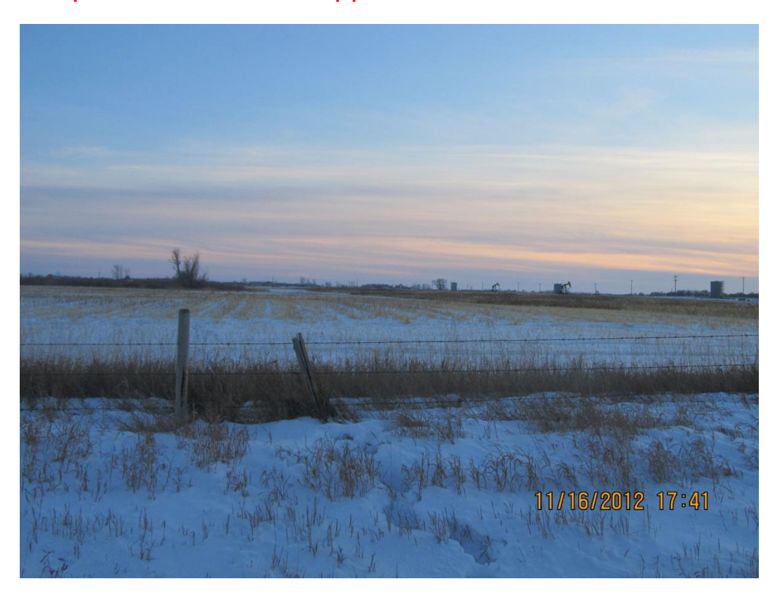
Photoplate 56 – View south on pipeline route in NW 22-2-29.