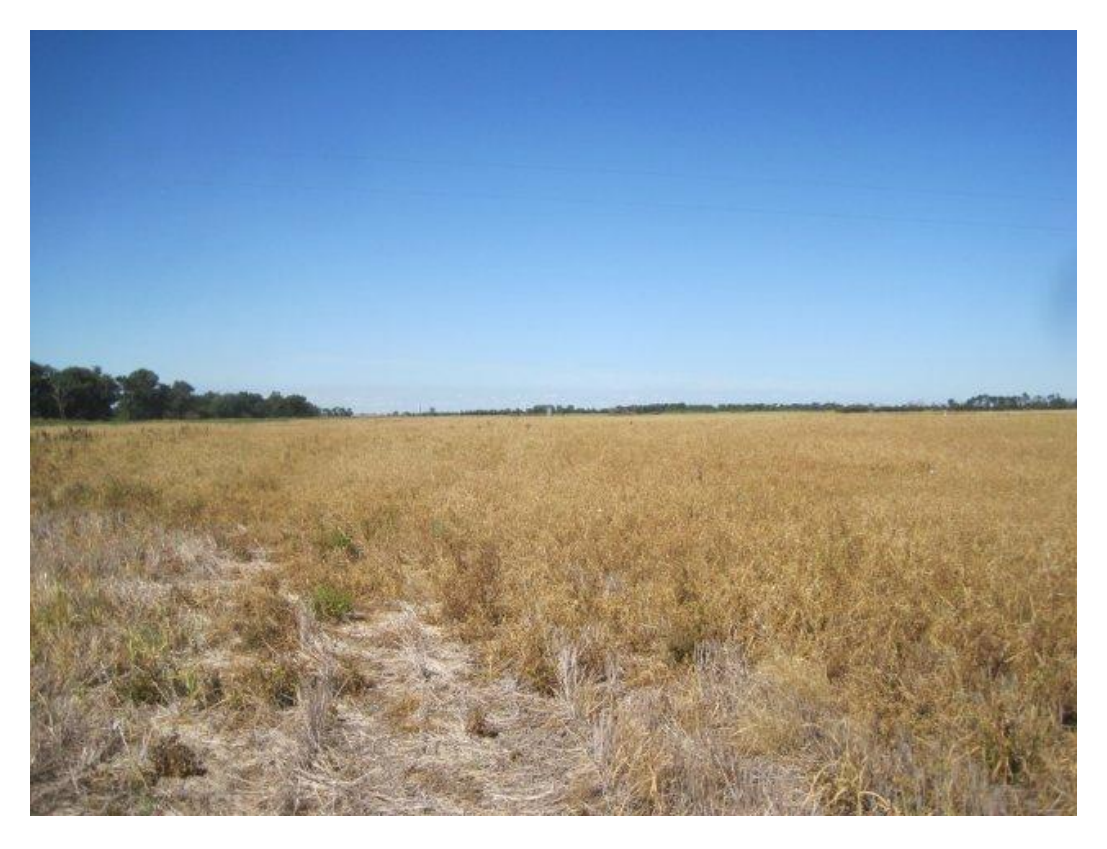
Photoplate 29 - View north on pipeline route in NW 8-2-28 WPM.