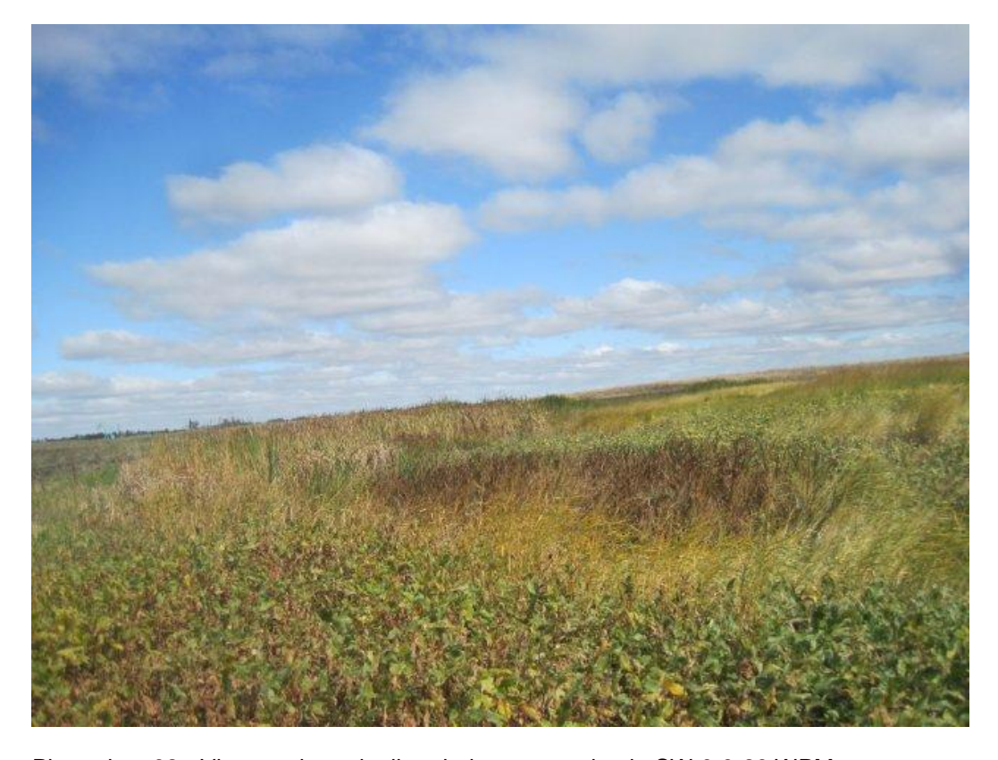
Photoplate 92 - View north at pipeline drainage crossing in SW 6-3-29 WPM.