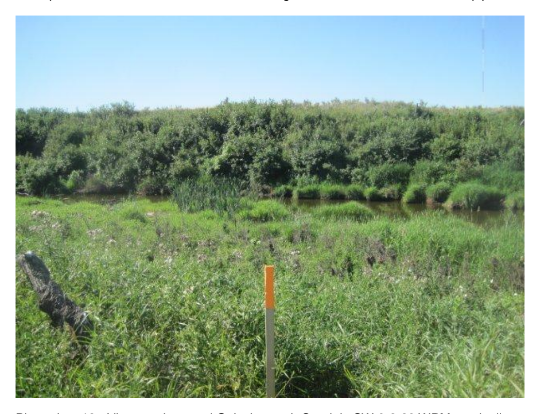
Photoplate 12 - View south toward Gainsborough Creek in SW 3-2-28 WPM on pipeline route.