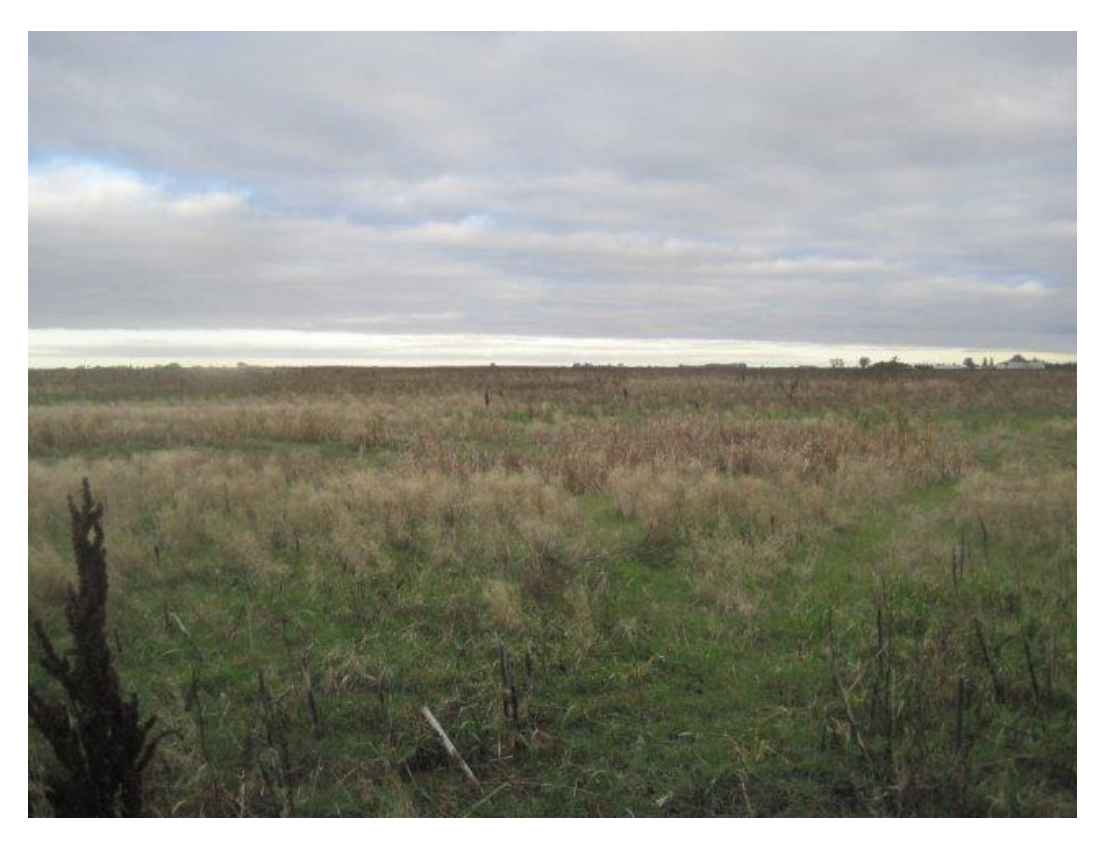
Photoplate 33 - View north on pipeline route in SW 18-2-28 WPM.