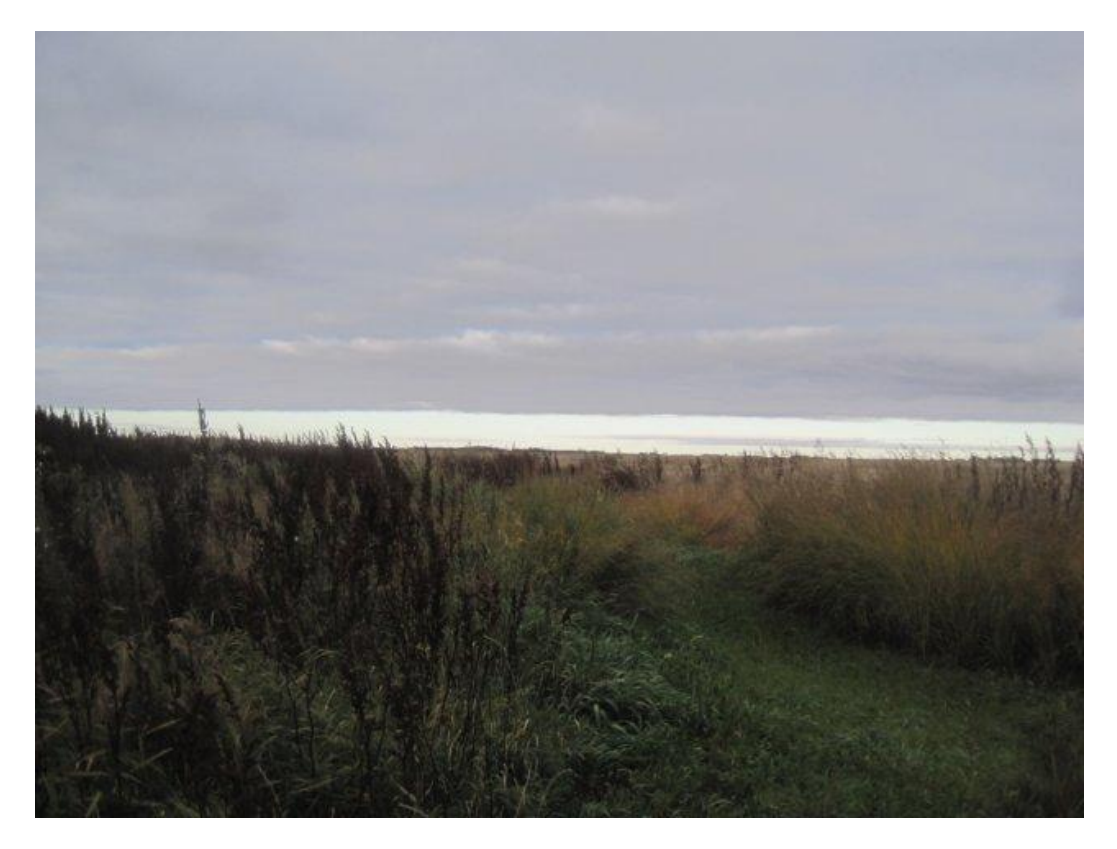
Photoplate 41 - View east over pipeline crossing at drainage in NW 18-2-28 WPM.