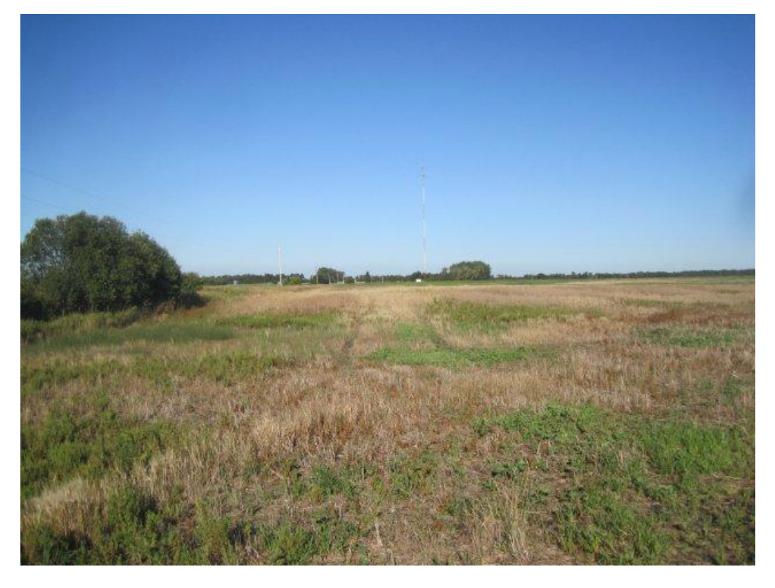
Photoplate 4 - View west on pipeline route in SW 3-2-28 WPM.