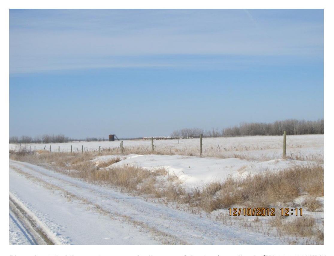
Photoplate 74 - View northwest on pipeline route following fence line in SW 31-2-29 WPM.