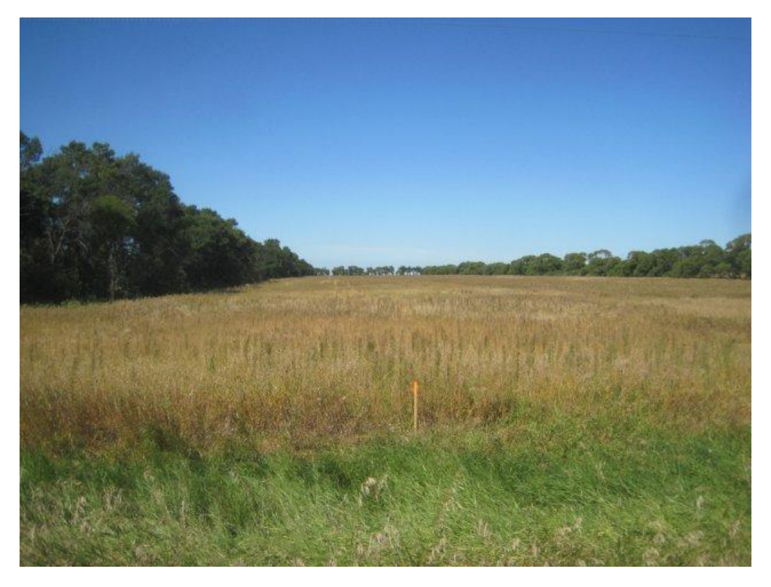
Photoplate 23 - View west on pipeline route in SE 9-2-28 WPM.