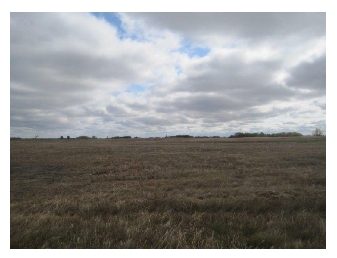
Photoplate 69 - View east on pipeline route in NE 30-2-29 WPM.