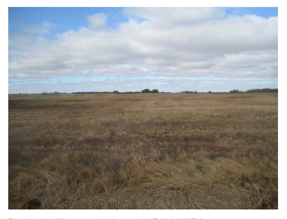
Photoplate 70 - View east on pipeline route in NE 30-2-29 WPM.