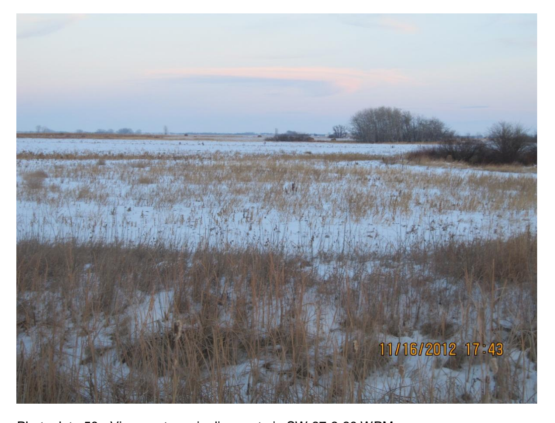
Photoplate 58 - View east on pipeline route in SW 27-2-29 WPM.