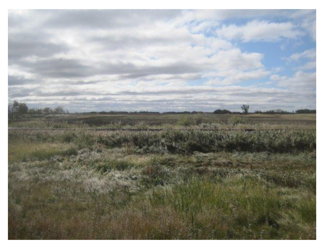
Photoplate 81 - View south toward railway crossing in NW 31-2-29 WPM on pipeline route.