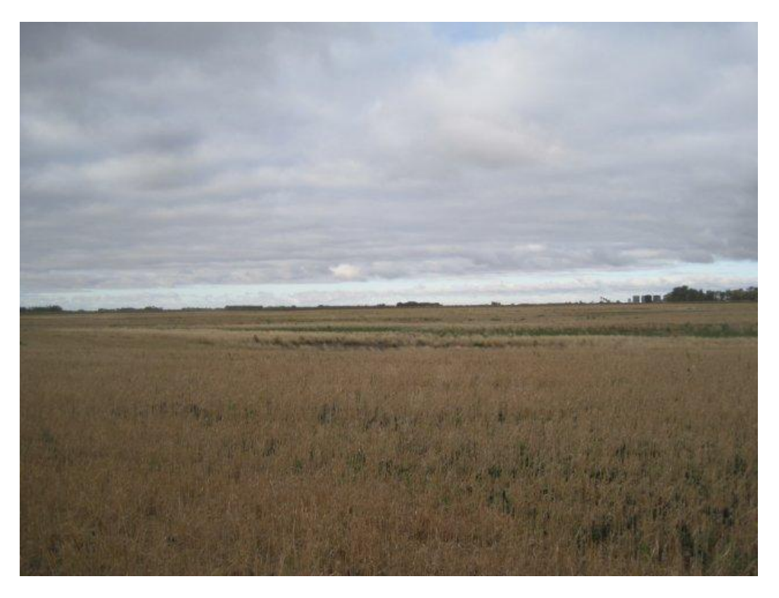
Photoplate 47 – View west on pipeline route on NW 13-2-29 WPM.