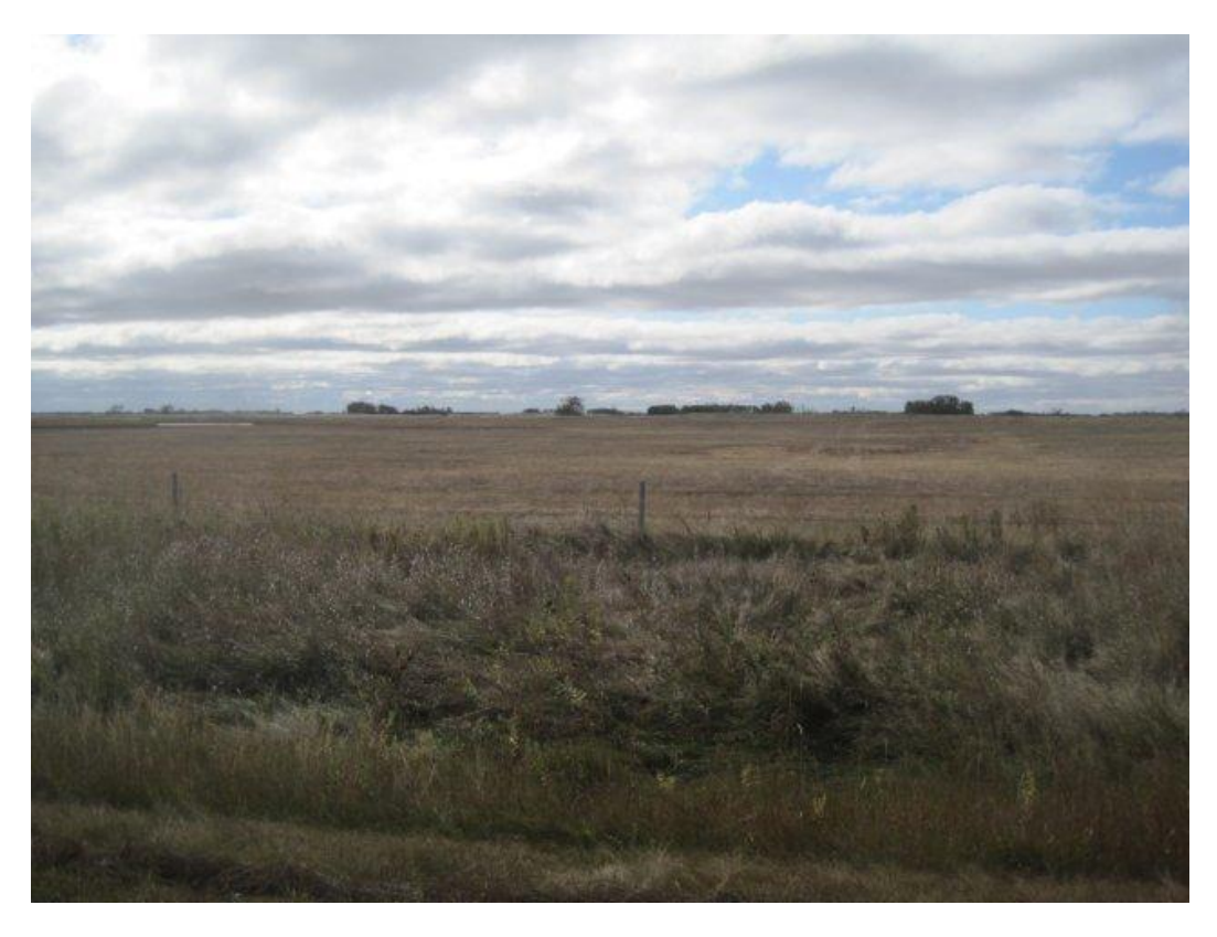
Photoplate 71 - View south at road allowance into NE 30-2-29 WPM on pipeline route.