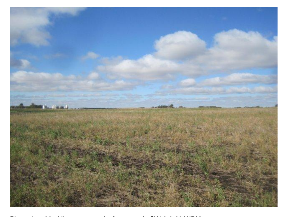
Photoplate 86 - View west on pipeline route in SW 6-3-29 WPM.