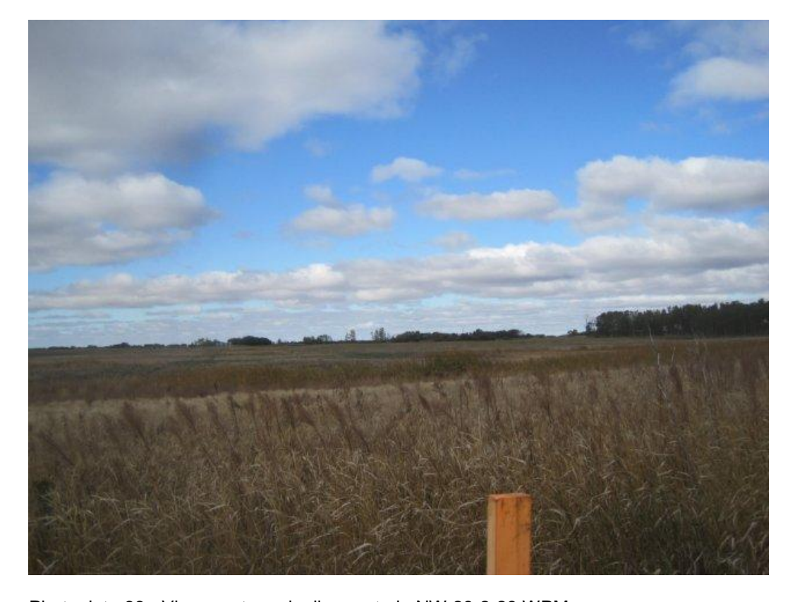
Photoplate 66 - View west on pipeline route in NW 29-2-29 WPM.