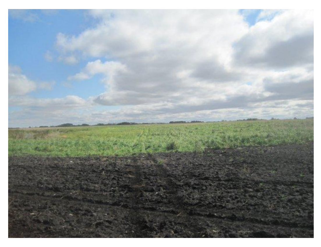
Photoplate 85 - View west on pipeline route in SE 6-3-29 WPM.