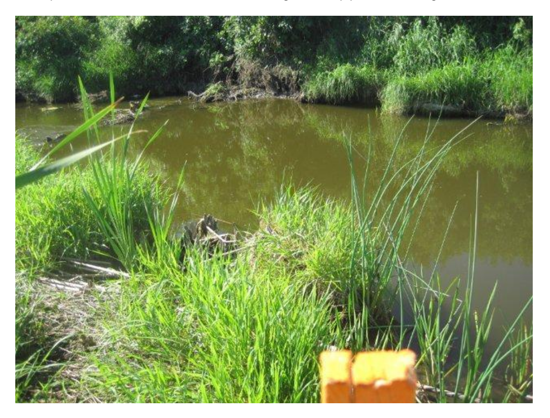
Photoplate 16 - View south toward Gainsborough Creek pipeline crossing route in SW 3-2-28 WPM.