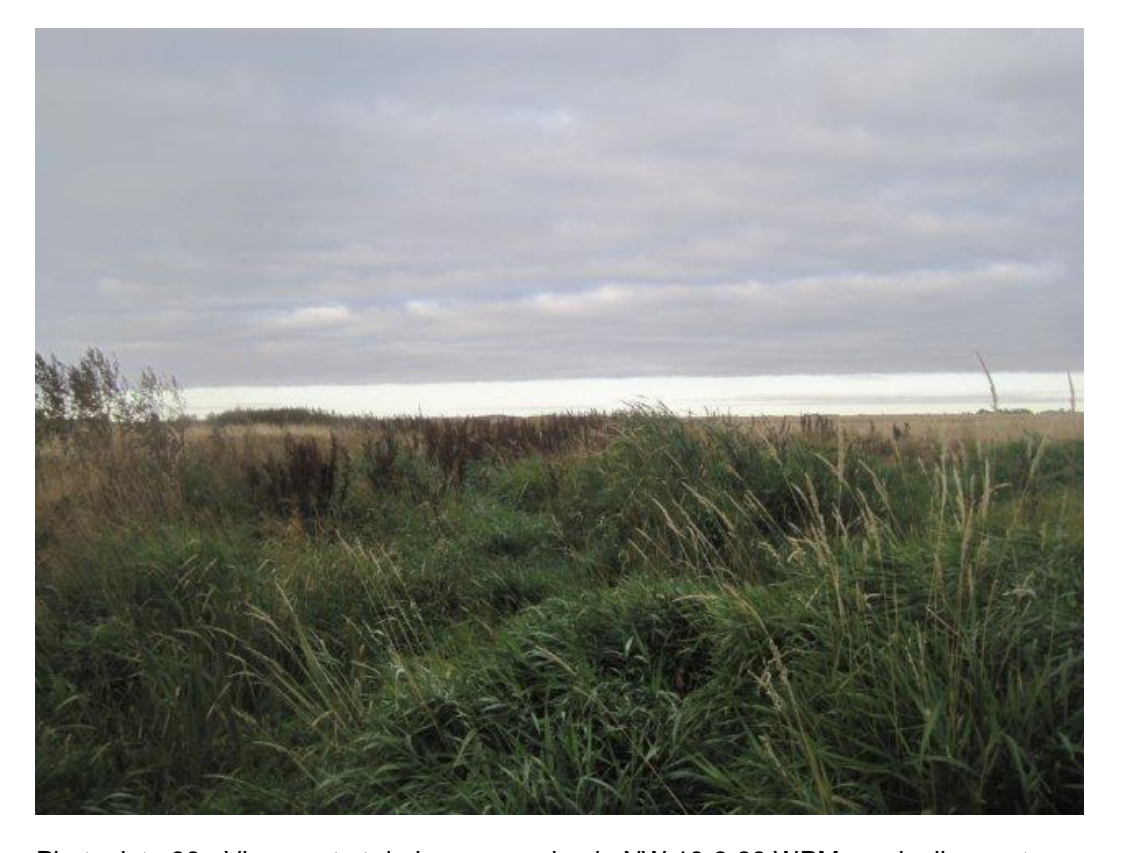
Photoplate 36 - View east at drainage crossing in NW 18-2-28 WPM on pipeline route.