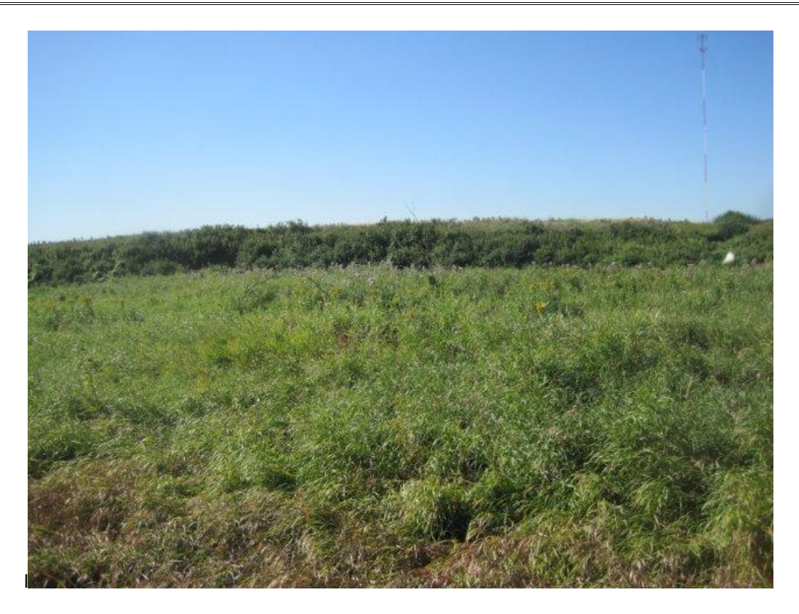
Photoplate 11 - View south toward Gainsborough Creek in SW 3-2-28 WPM on pipeline route.