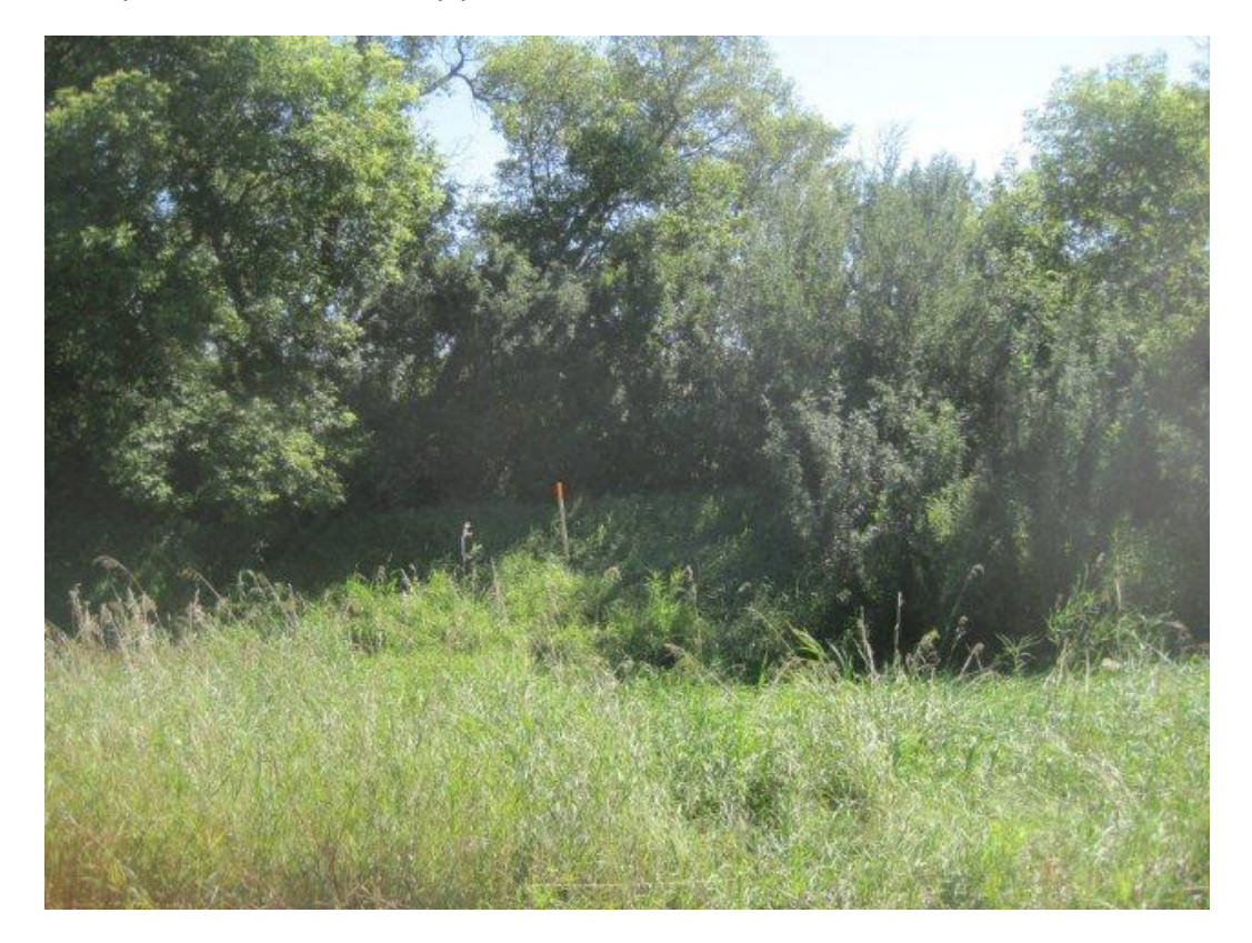
Photoplate 22 - View west at treeline on west side of SW 10-2-28 WPM on pipeline route.