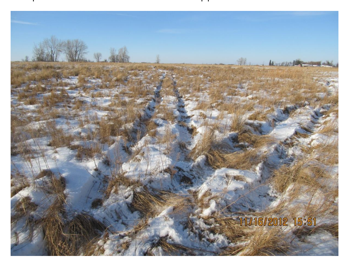
Photoplate 50 - View northwest on pipeline route in SW 23-2-29 WPM.