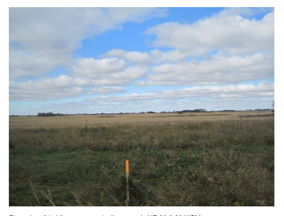
Photoplate 64 - View west on pipeline route in NE 29-2-29 WPM.