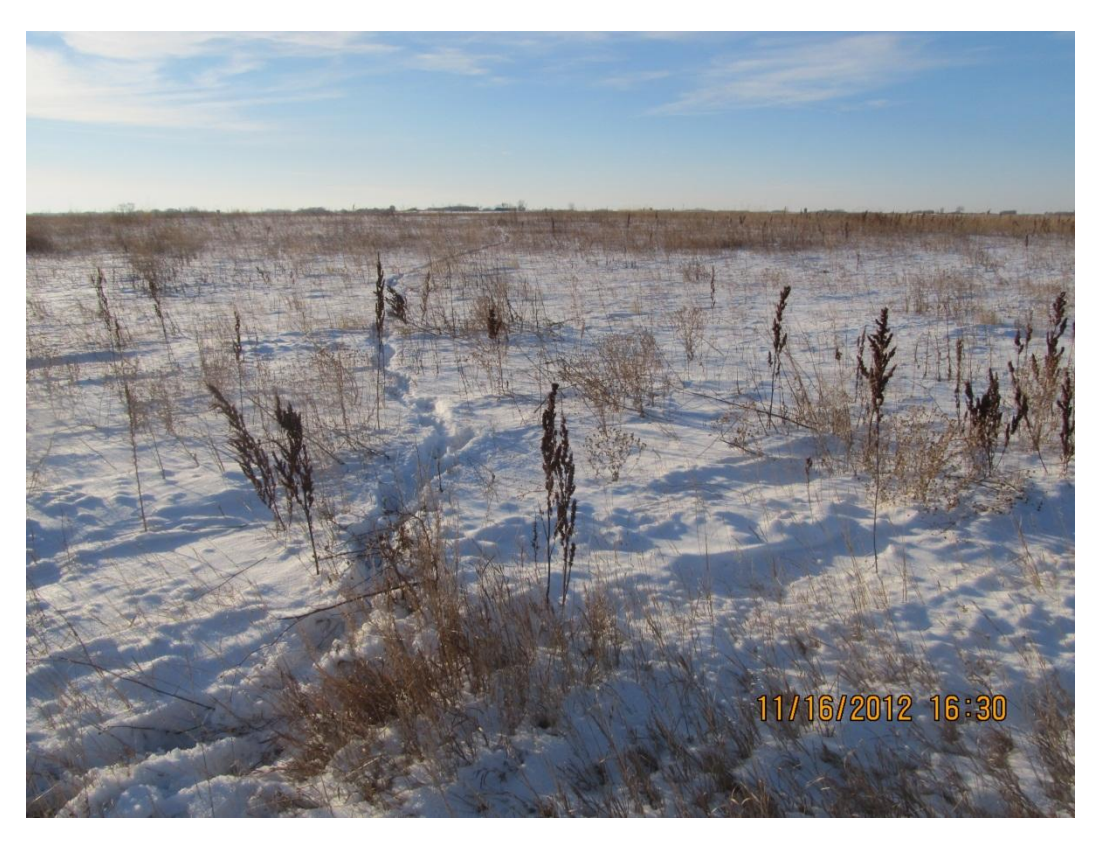
Photoplate 53 – View west on pipeline route in NE 22-2-29 WPM.