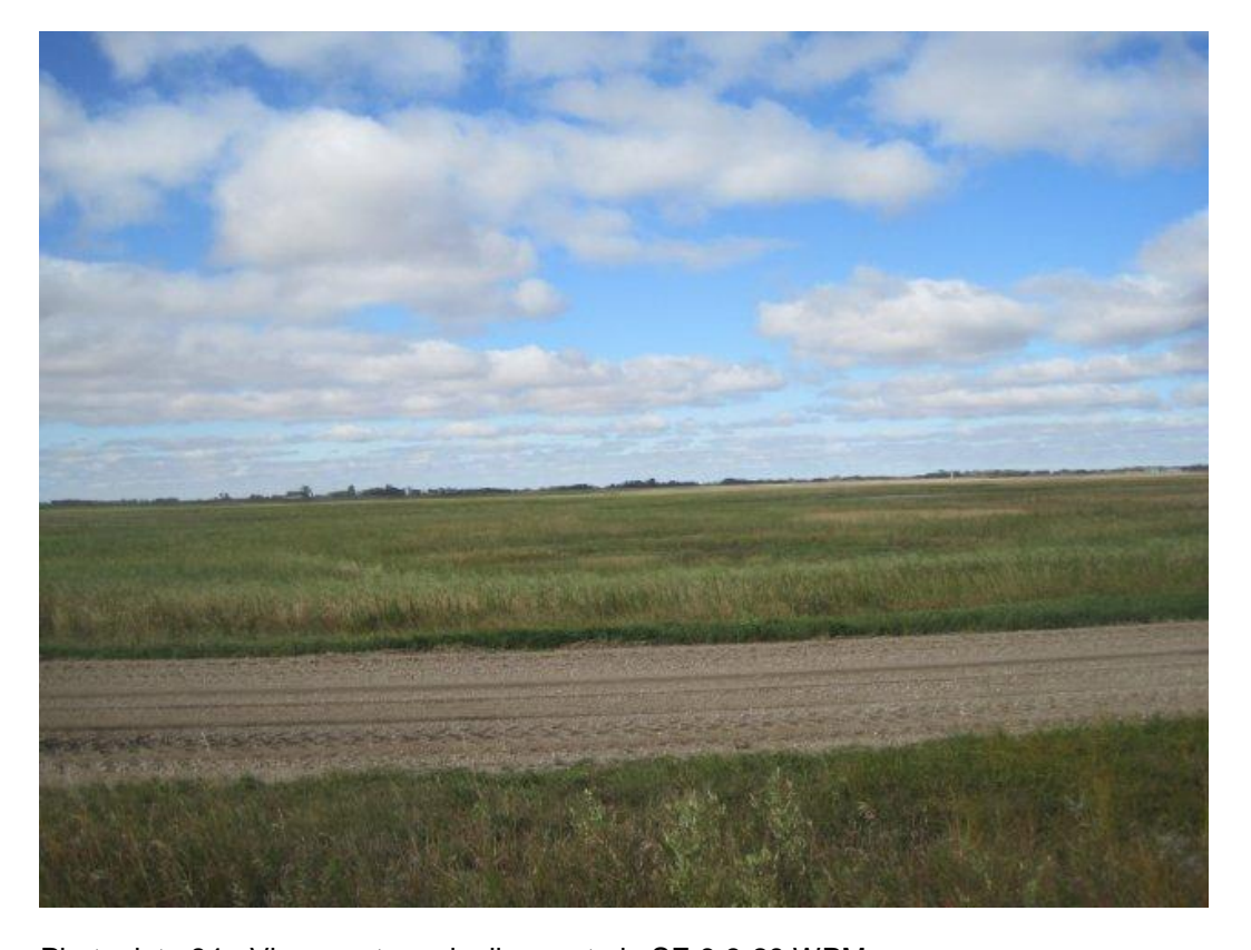
Photoplate 84 - View west on pipeline route in SE 6-3-29 WPM.