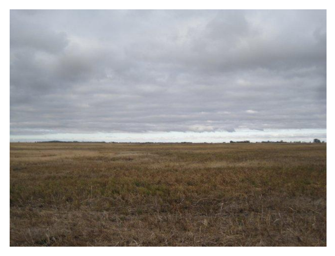
Photoplate 43 – View west on pipeline route on NE 13-2-29 WPM.