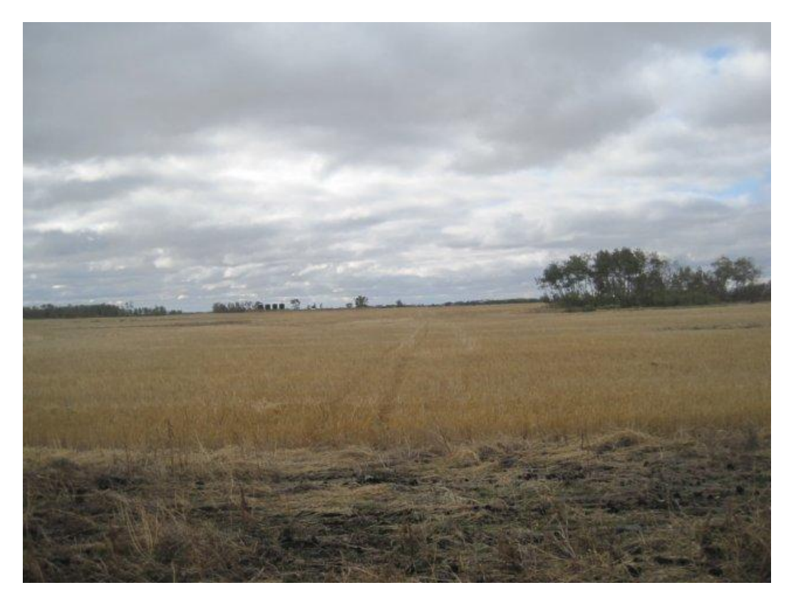
Photoplate 59 - View north on pipeline route in SE 28-2-29 WPM