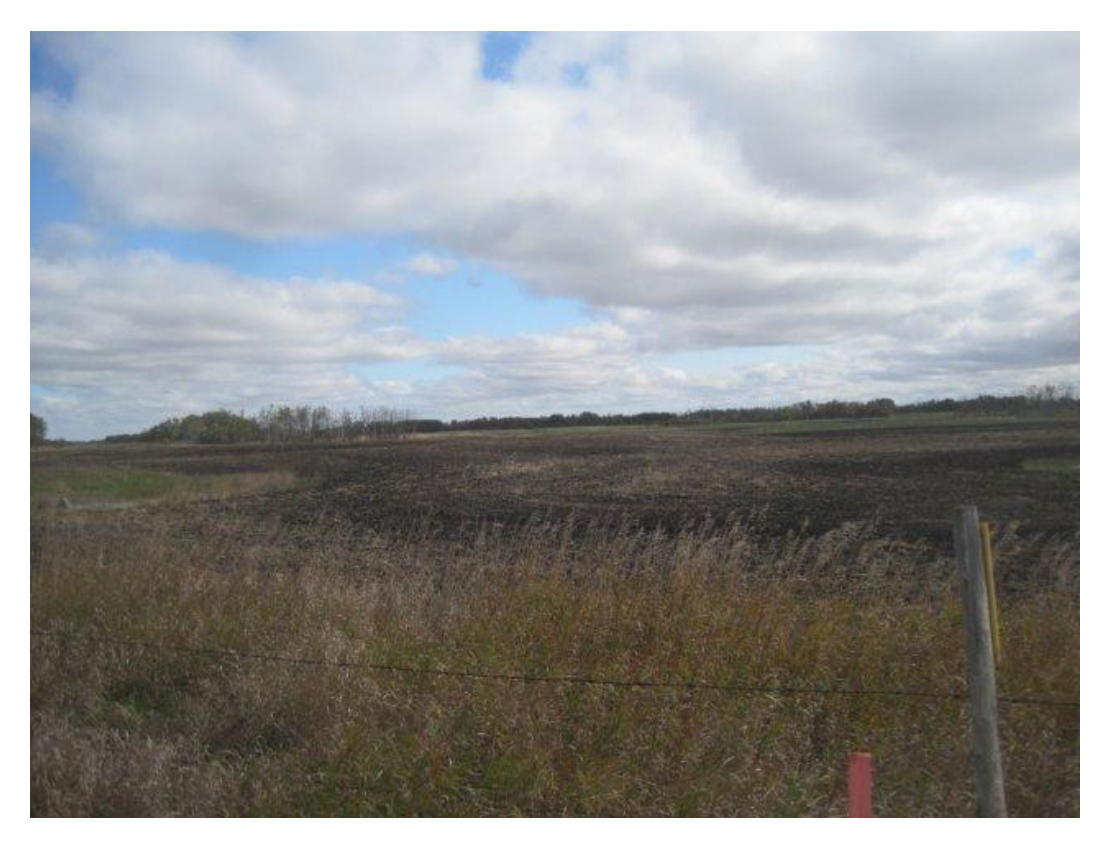
Photoplate 83 - View east on pipeline route in SW 5-3-29 WPM.