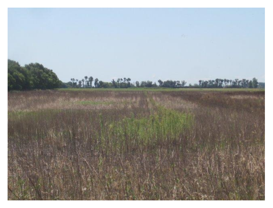
Photoplate 1 - View north on pipeline route in SE 2-2-28 WPM.