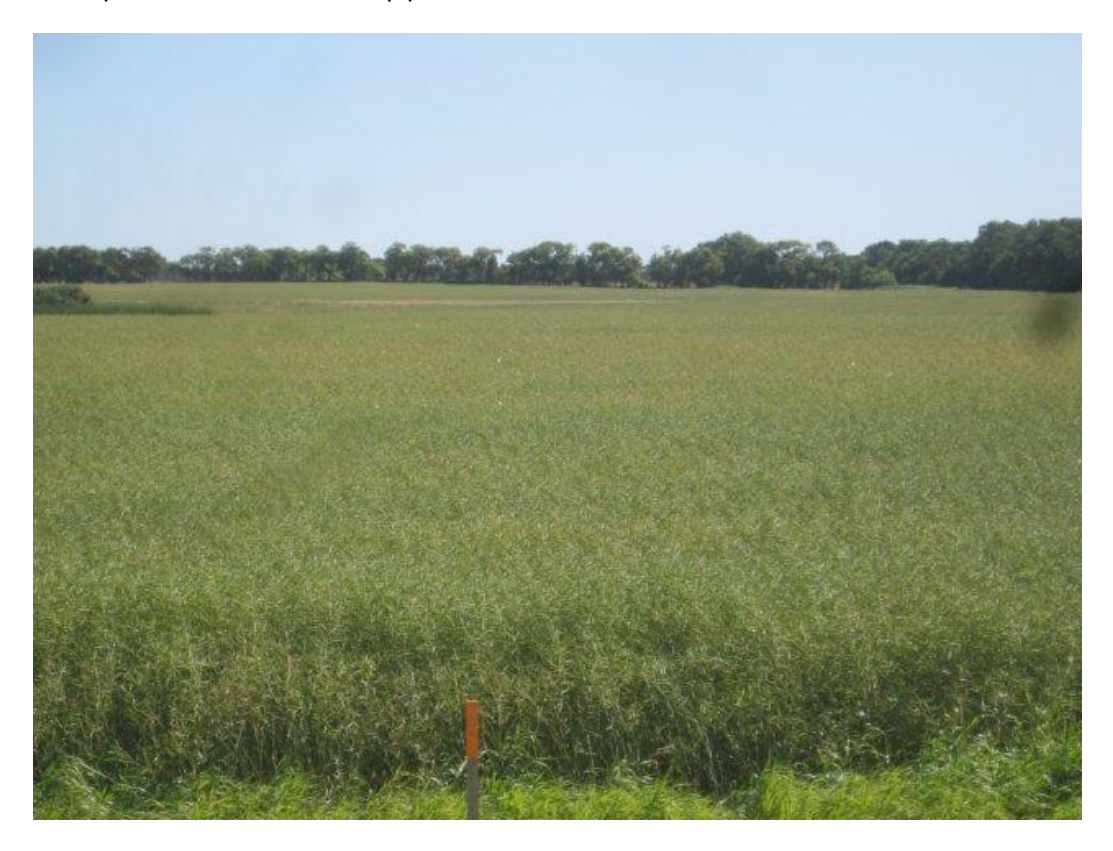
Photoplate 26 - View east on pipeline route in SW 9-2-28 WPM.