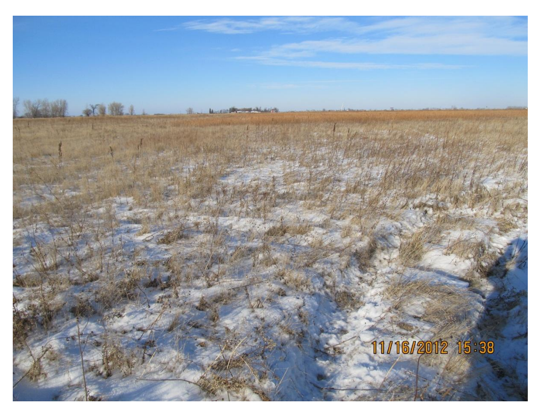
Photoplate 49 - View north in SW 23-2-29 WPM on pipeline route.