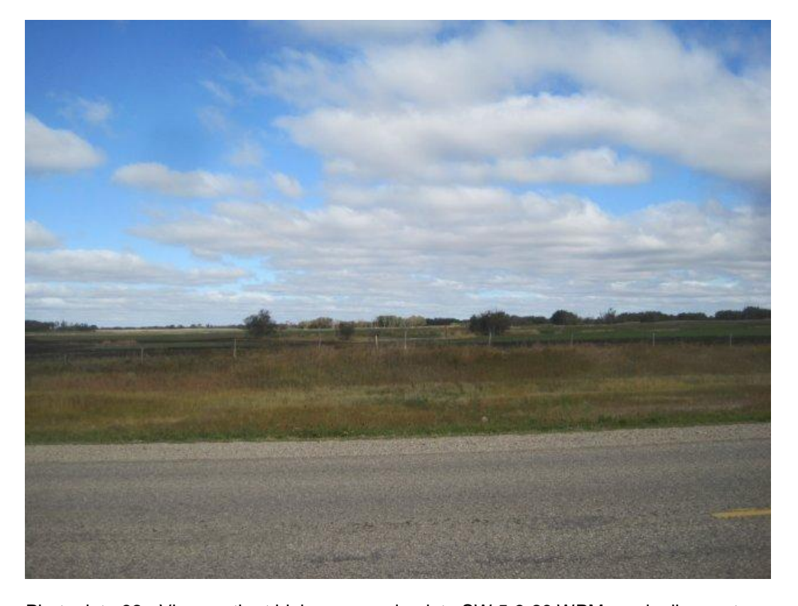
Photoplate 82 - View north at highway crossing into SW 5-3-29 WPM on pipeline route.