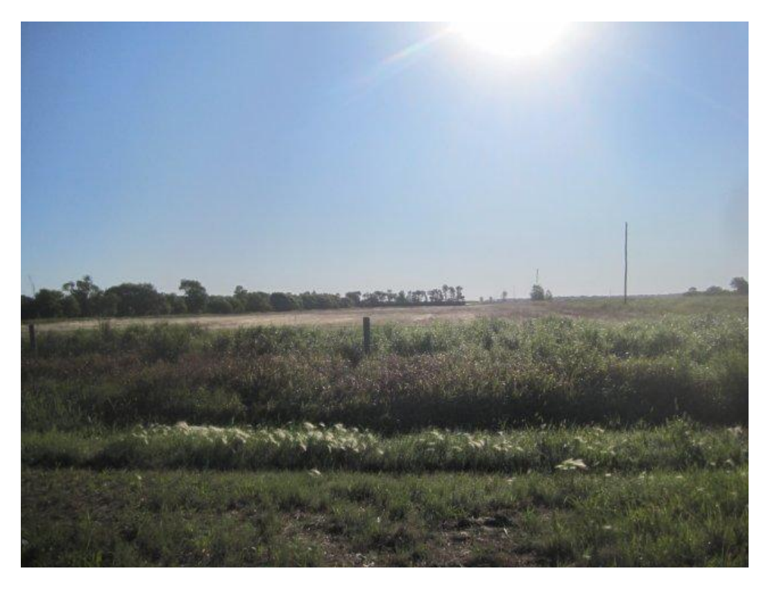
Photoplate 3 - View east at quarter line into SE 3-2-28 WPM on pipeline route.