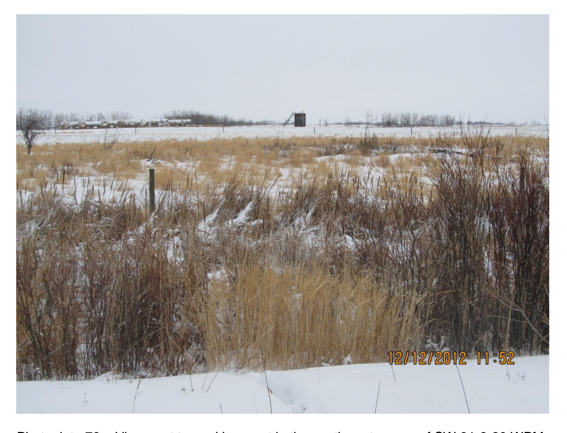
Photoplate 76 – View east toward low spot in the southwest corner of SW 31-2-29 WPM.