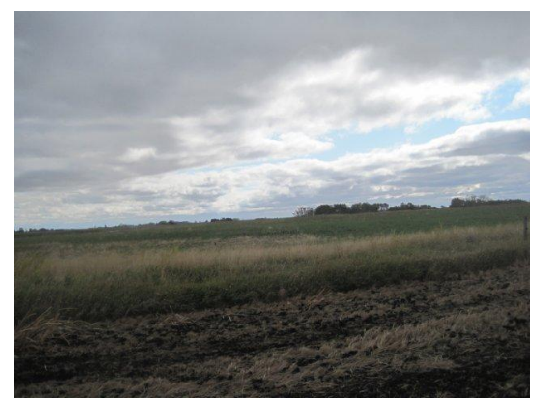
Photoplate 61 - View east on pipeline route in NE 28-2-29 WPM.