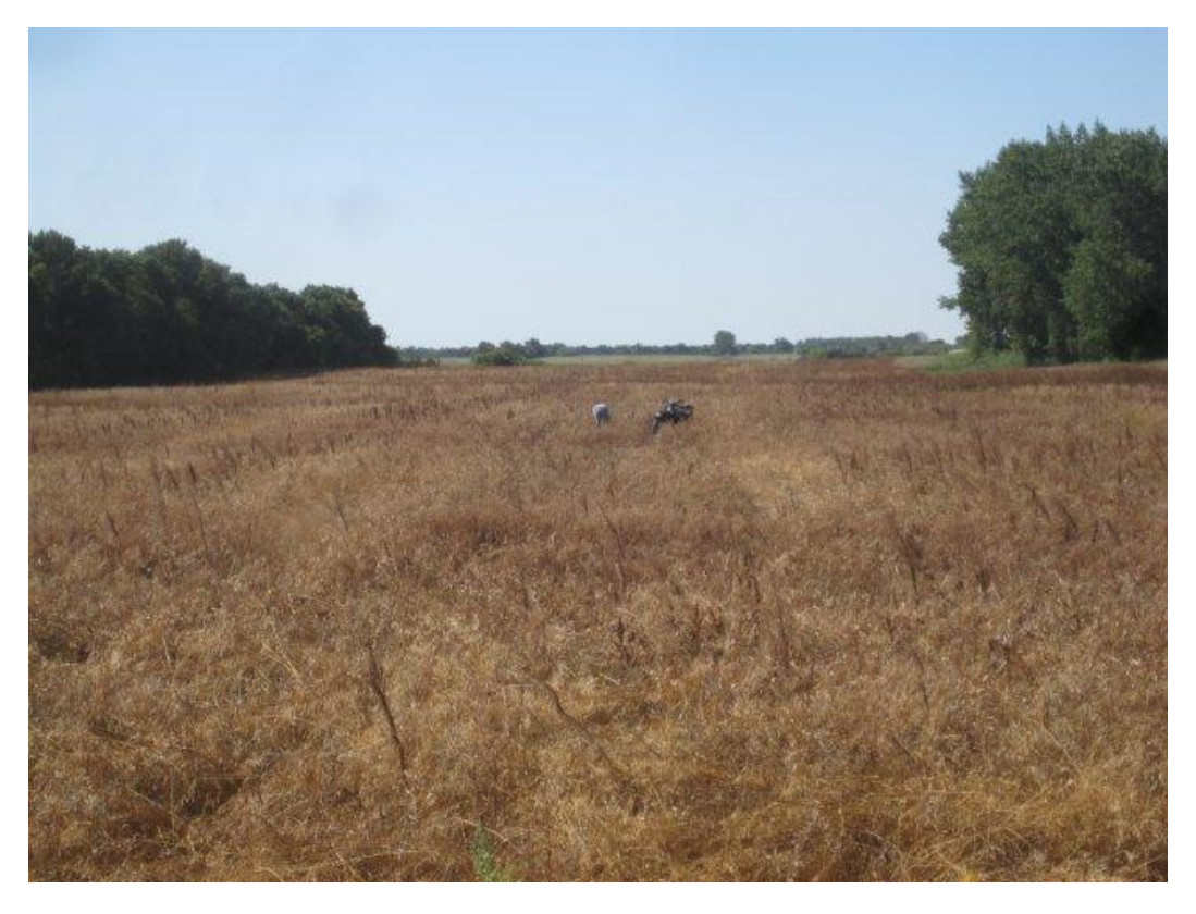
Photoplate 19 - View south on pipeline route in NW 3-2-28 WPM.