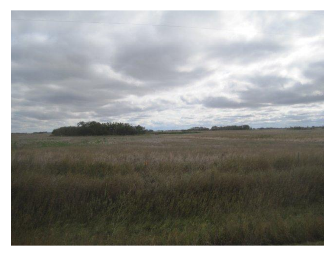
Photoplate 67 – View east on pipeline route in NW 29-2-29 WPM.