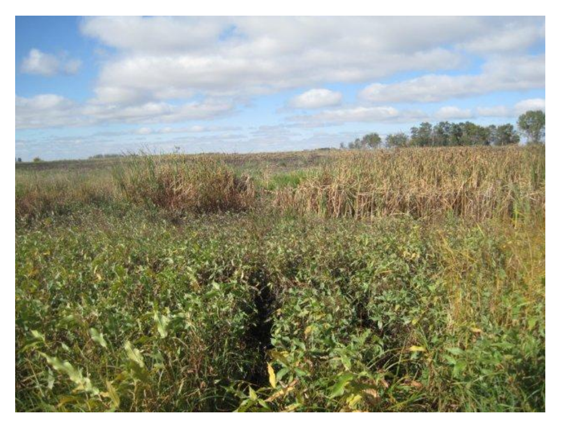
Photoplate 89 - View west over drainage in SW 6-3-29 WPM on pipeline route.