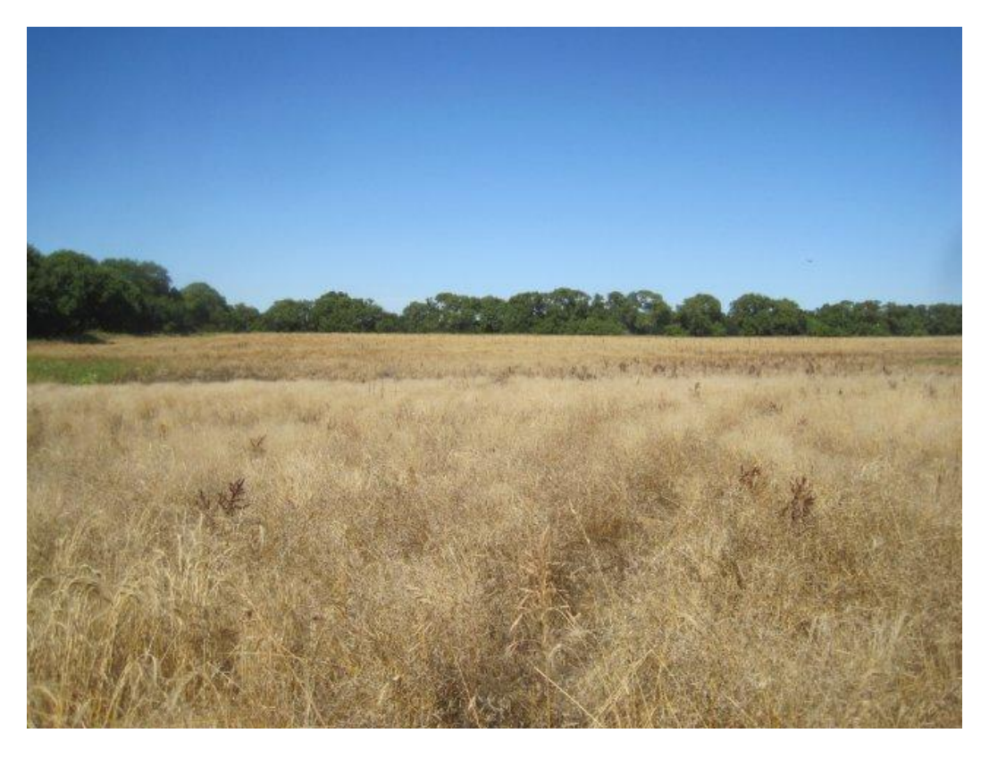
Photoplate 21 - View west on pipeline route in SW 10-2-28 WPM.