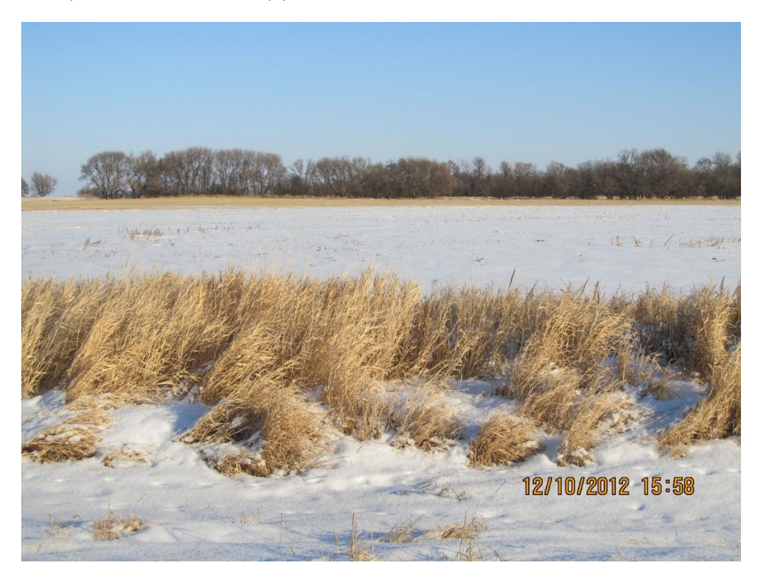
Photoplate 30 - View east in NW 8-2-28 WPM on pipeline route.