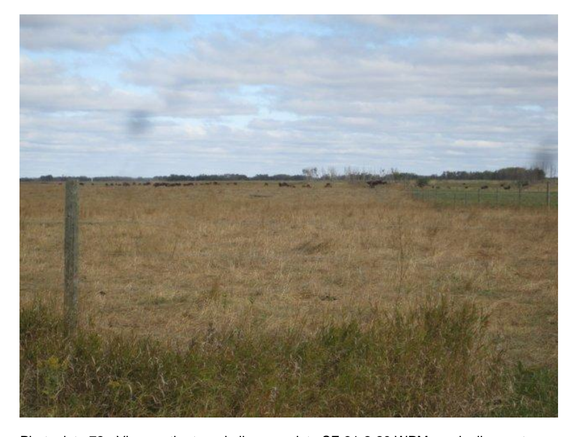
Photoplate 72 - View north at road allowance into SE 31-2-29 WPM on pipeline route.