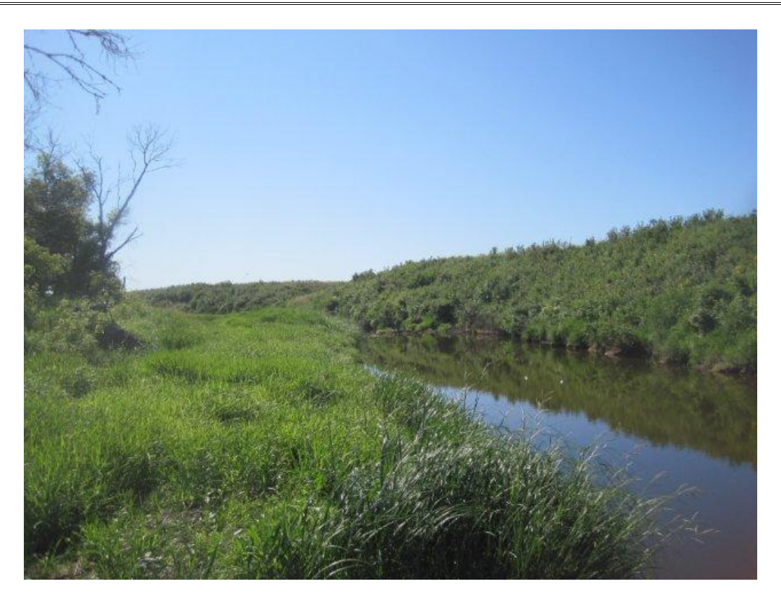
Photoplate 17 - View east 100 m downstream from pipeline crossing route in SW 3-2-28 WPM.