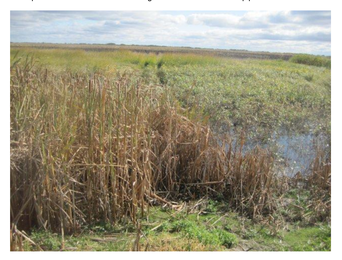
Photoplate 90 - View east toward drainage in SW 6-3-29 WPM on pipeline route.