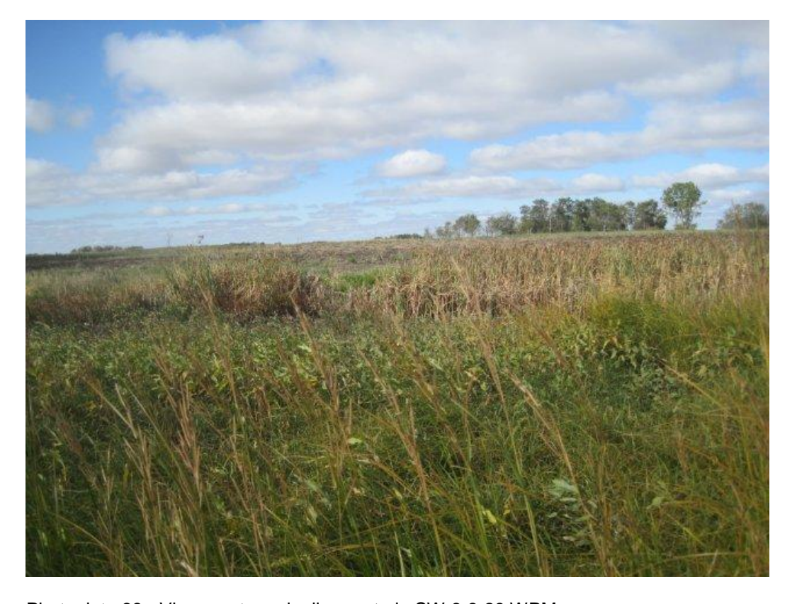
Photoplate 88 - View west on pipeline route in SW 6-3-29 WPM.