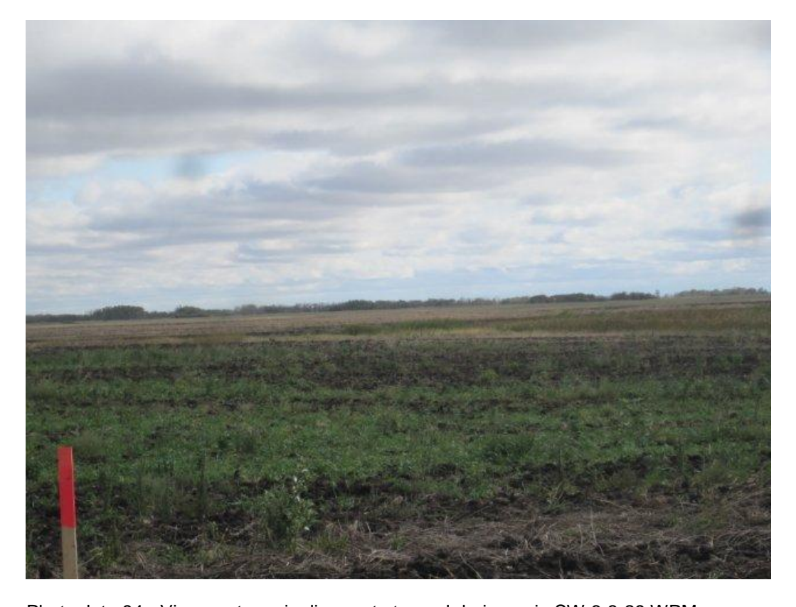
Photoplate 94 - View east on pipeline route toward drainage in SW 6-3-29 WPM.