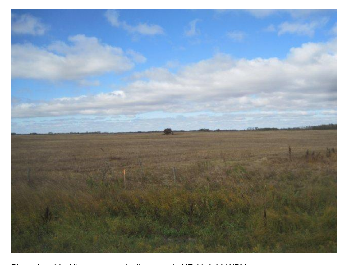
Photoplate 68 - View west on pipeline route in NE 30-2-29 WPM.