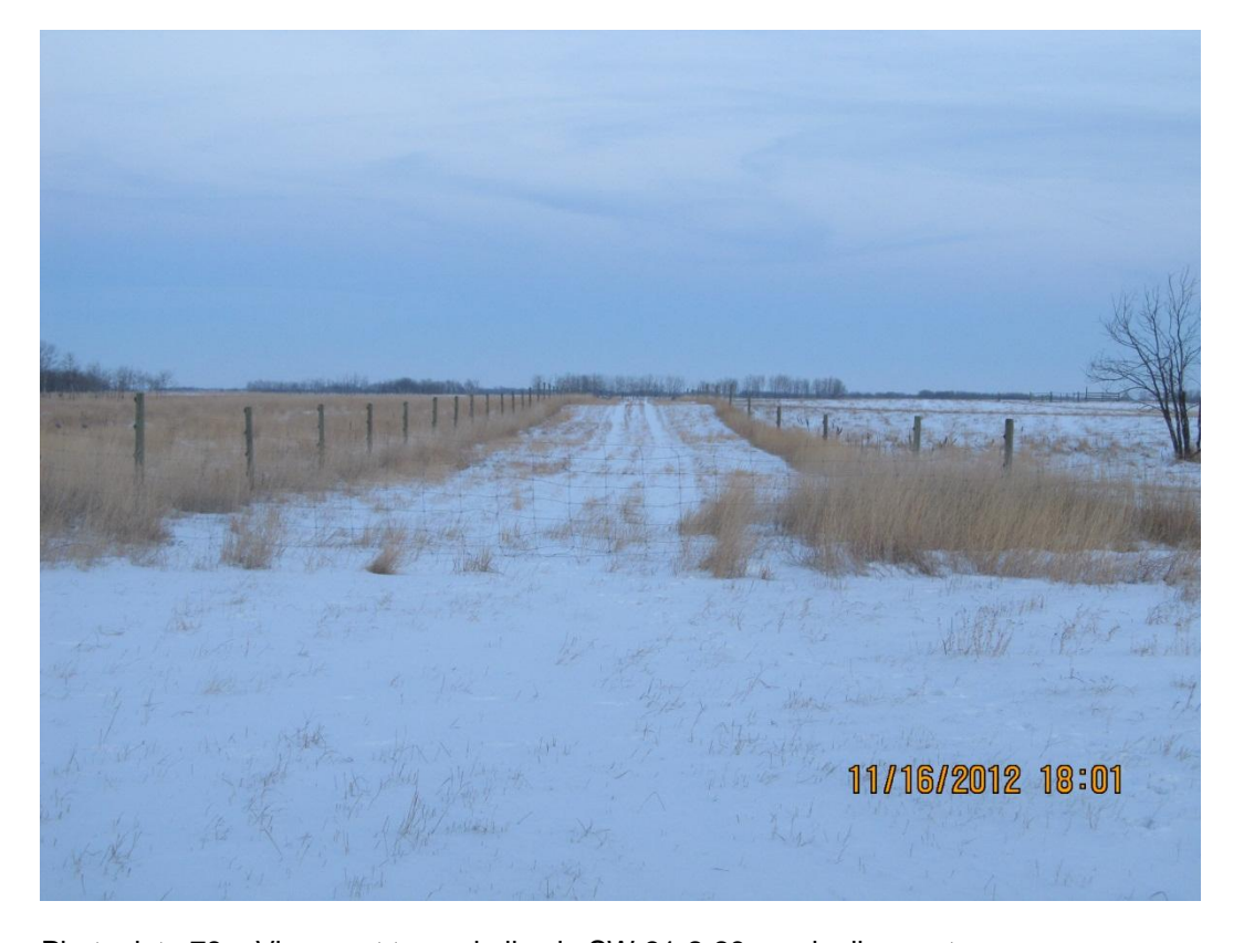
Photoplate 78 – View east toward alley in SW 31-2-29 on pipeline route.