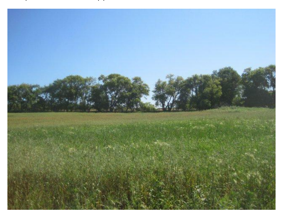
Photoplate 24 - View west at treeline in SE 9-2-28 WPM on pipeline route.