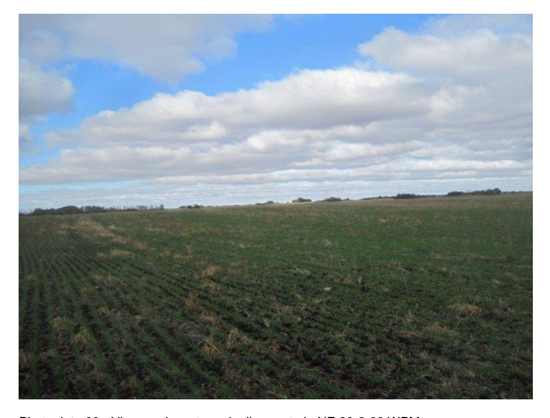
Photoplate 60 - View northwest on pipeline route in NE 28-2-29 WPM.