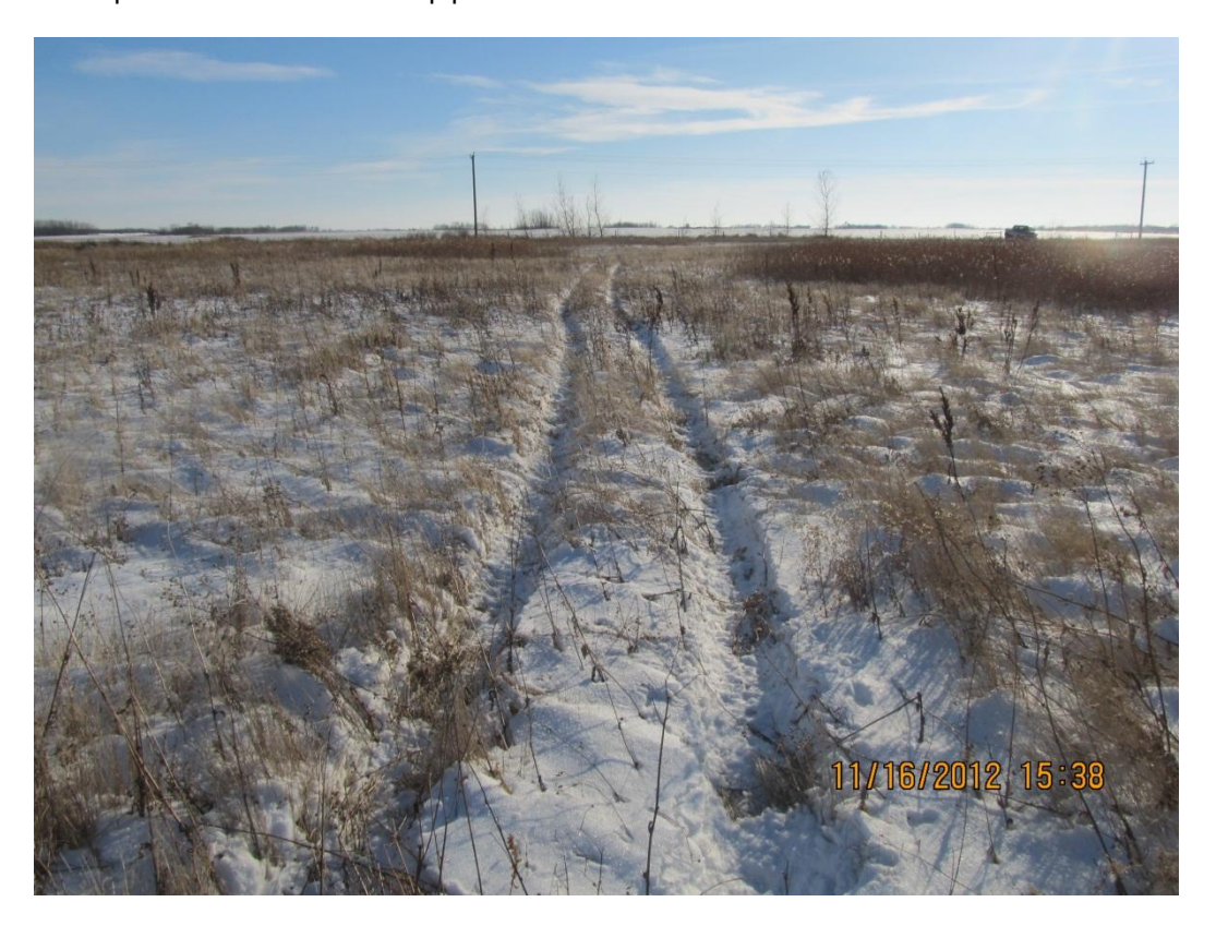
Photoplate 48 - View south on pipeline route in SW 23-2-29 WPM toward NW 14-2-29 WPM.