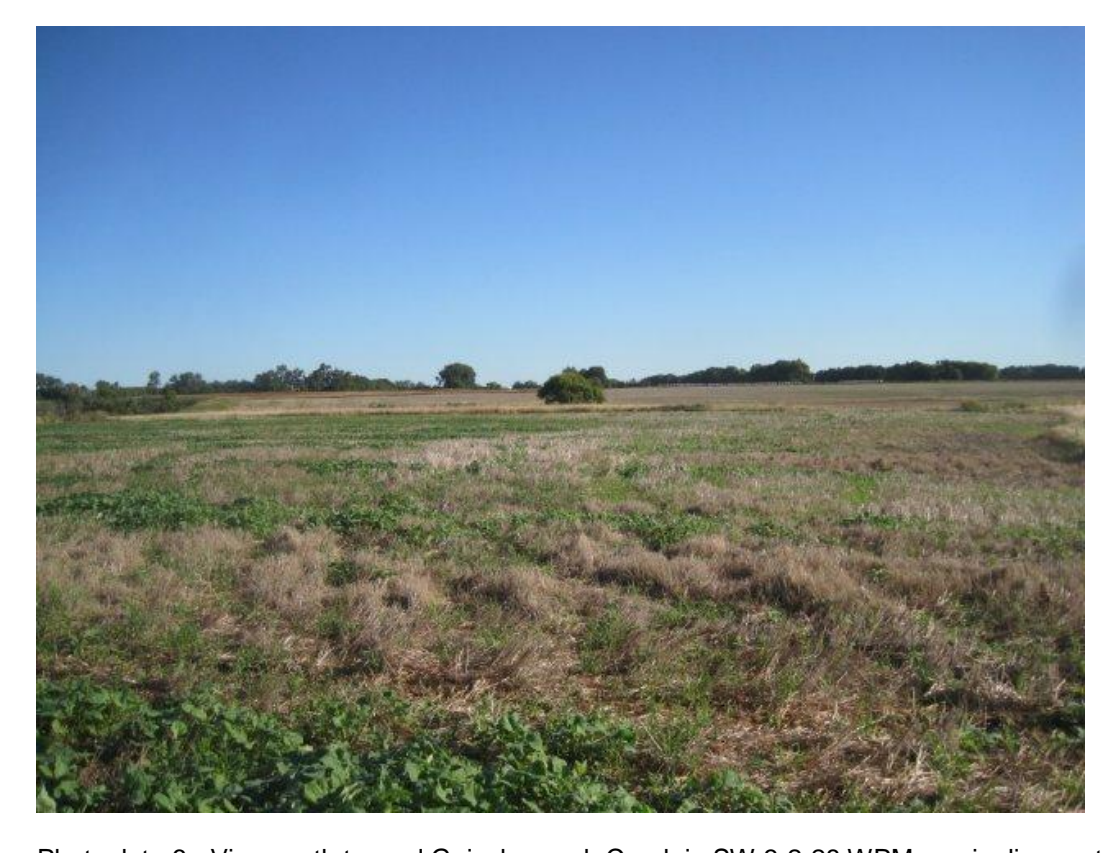
Photoplate 6 - View north toward Gainsborough Creek in SW 3-2-28 WPM on pipeline route.