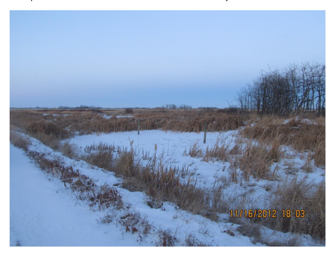
Photoplate 80 – View northeast toward drainage in NW 31-2-29 WPM on pipeline route.