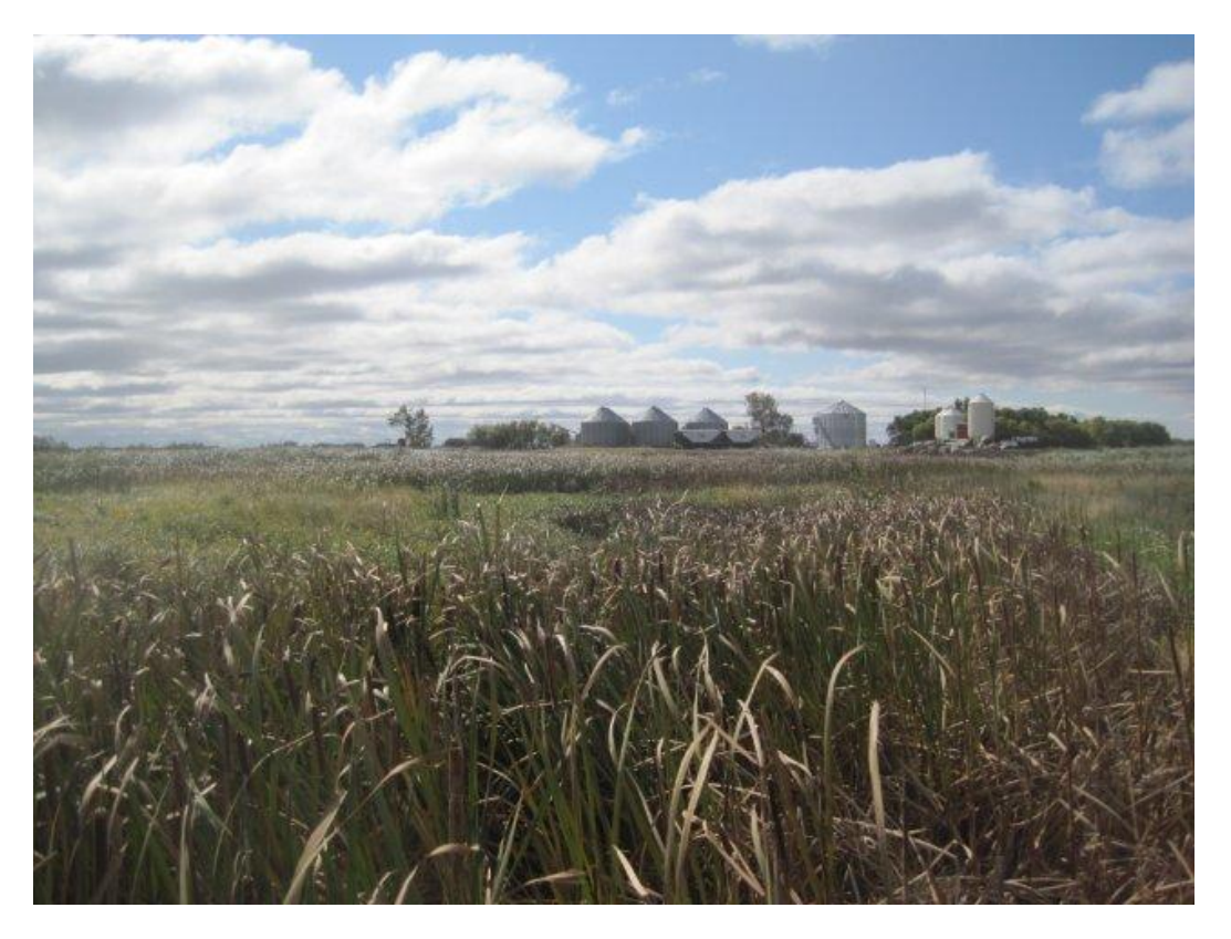
Photoplate 91 - View south at pipeline drainage crossing in SW 6-3-29 WPM.