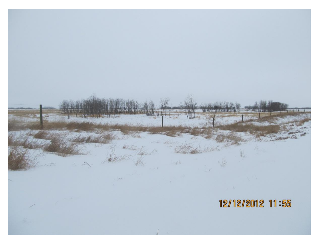
Photoplate 79 – View southeast toward low area north of alley in NW 31-2-29 WPM.