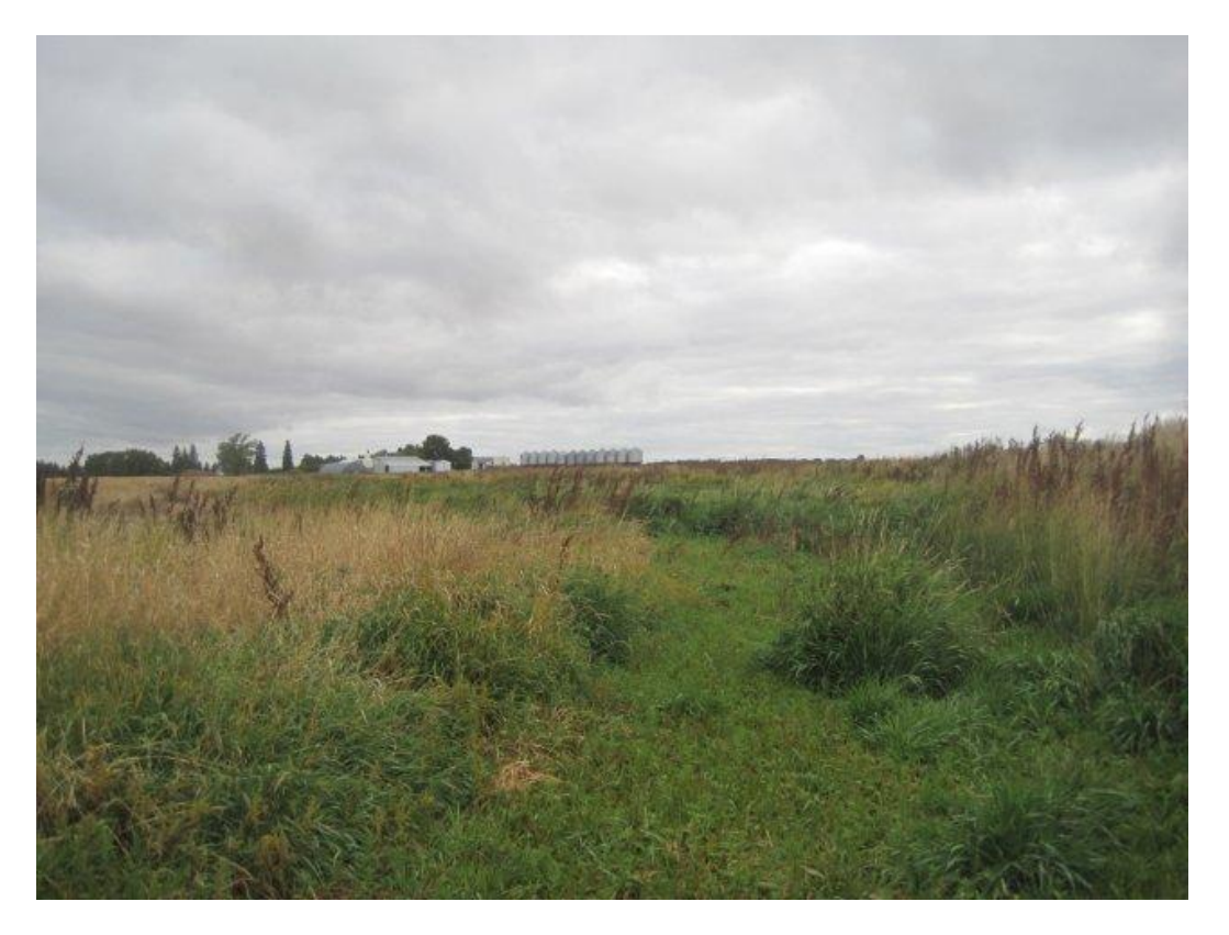
Photoplate 35 - View northeast at drainage crossing in NW 18-2-28 WPM on pipeline route.