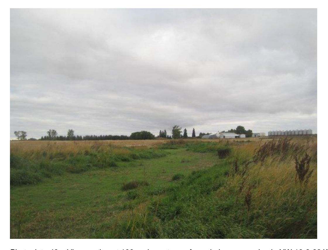
Photoplate 40 – View northeast 100 m downstream from drainage crossing in NW 18-2-28 WPM.