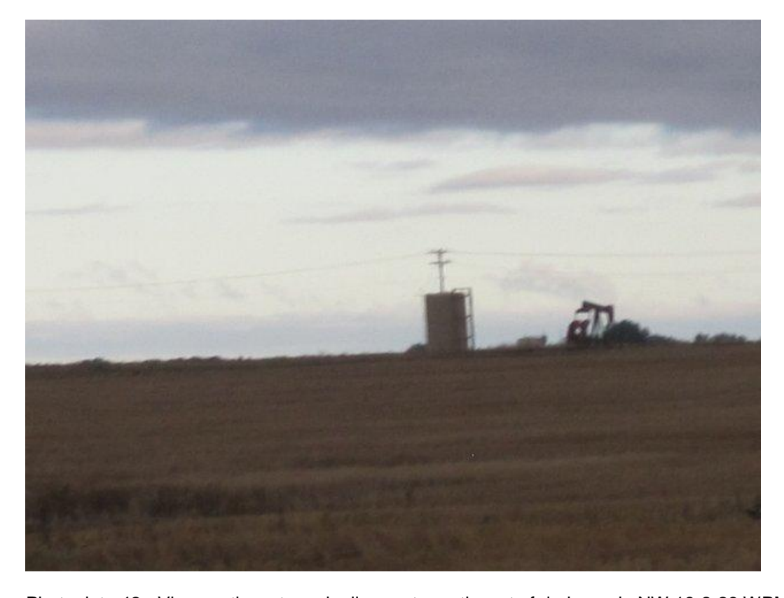
Photoplate 42 - View northwest on pipeline route northwest of drainage in NW 18-2-28 WPM.