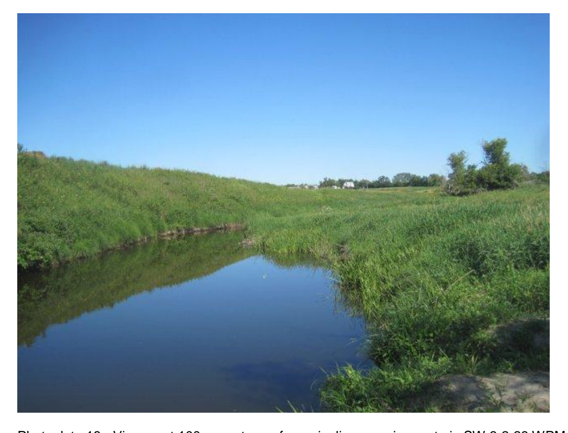
Photoplate 18 - View west 100 m upstream from pipeline crossing route in SW 3-2-28 WPM.