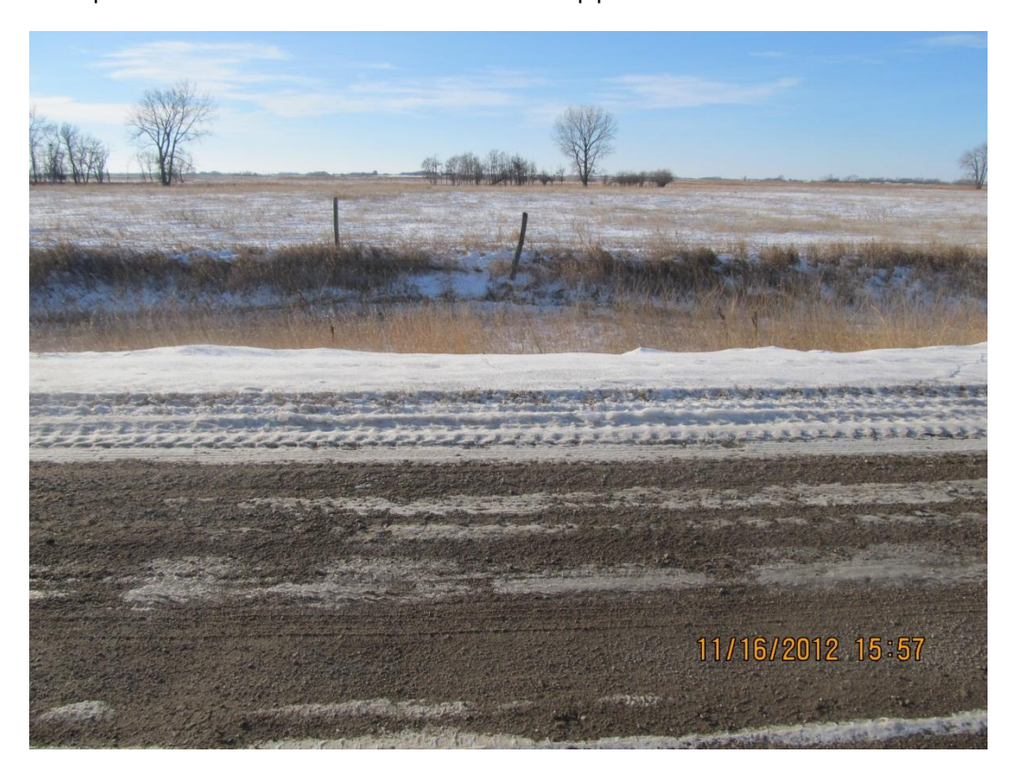
Photoplate 52 - View west on pipeline route in NE 22-2-29 WPM.