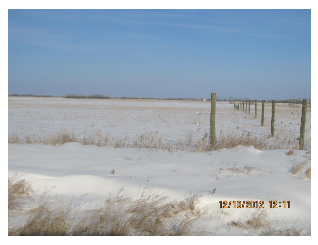
Photoplate 73 – View north into SW 31-2-29 WPM on pipeline route.