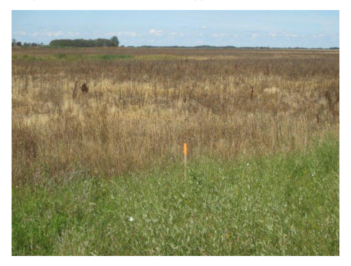
Photoplate 32 - View northwest in SE 18-2-28 WPM on pipeline route.