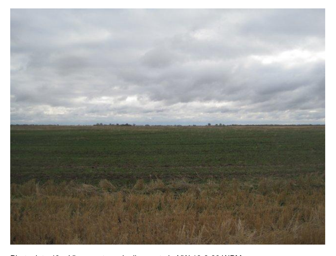
Photoplate 46 – View west on pipeline route in NW 13-2-29 WPM.