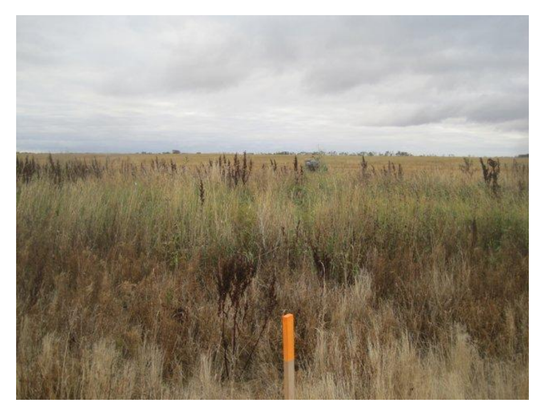
Photoplate 37 - View south at drainage crossing in NW 18-2-28 WPM on pipeline route.