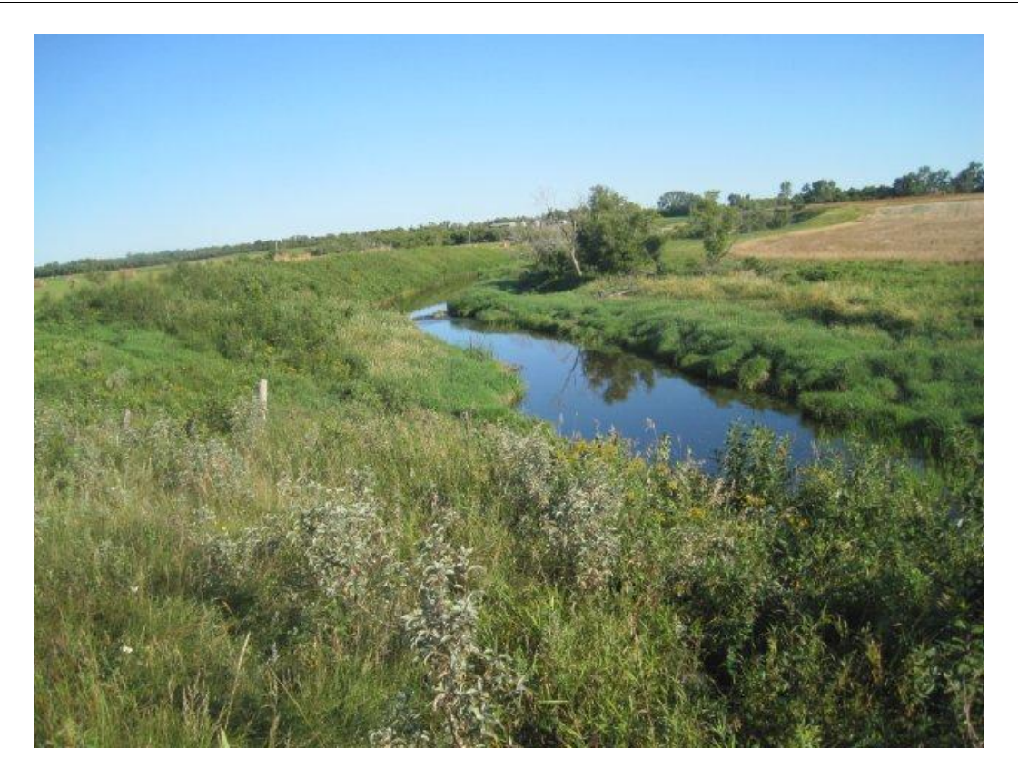
Photoplate 9 - View northwest in SW 3-2-28 WPM, 100 m downstream from pipeline crossing route.