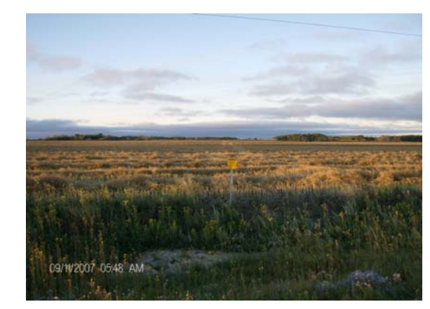
Post construction and restoration

• Restoration/Clean-up: After the pipeline is energized the topsoil will be re-spread and