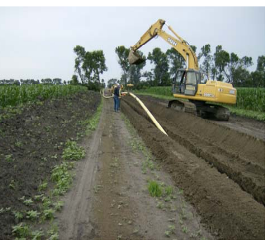
Trenching being undertaken for a past gas pipeline project by Manitoba Hydro