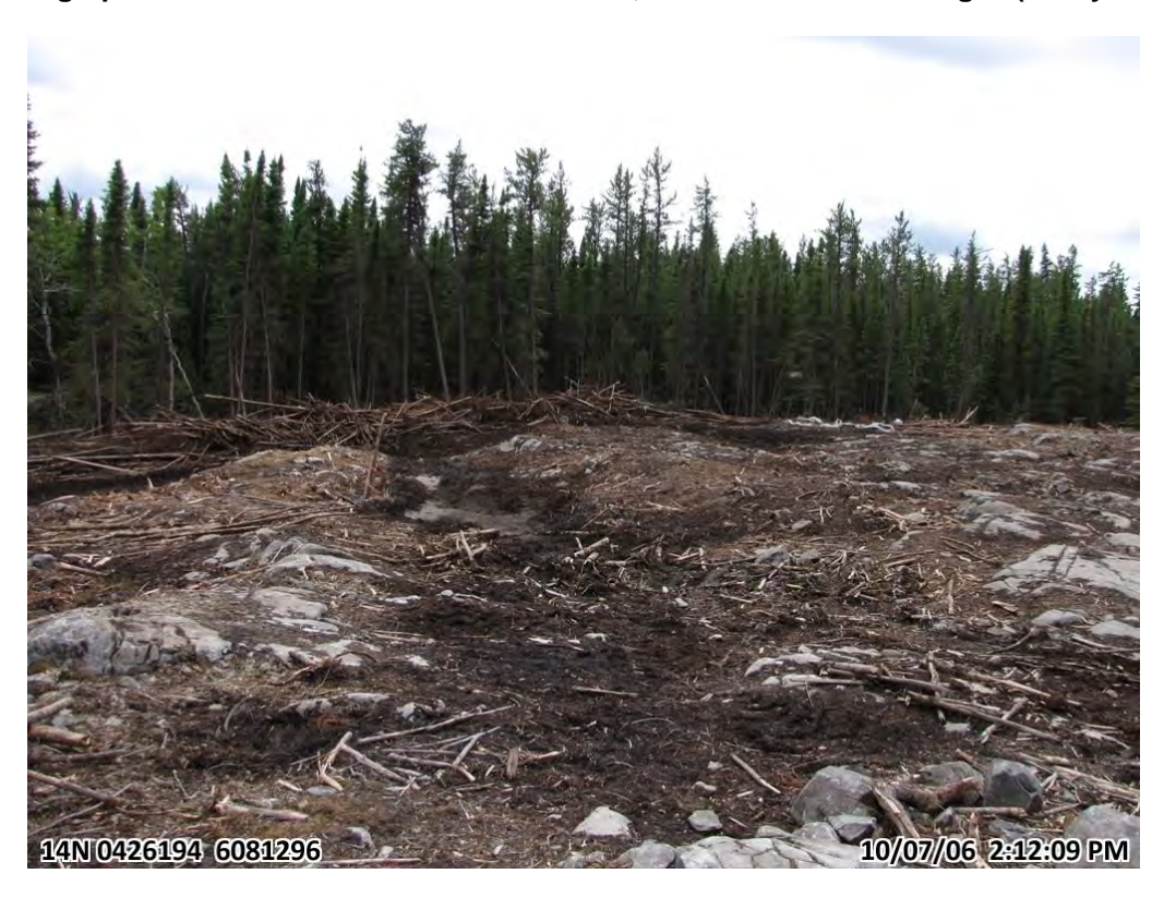
Photograph 14. Panoramic of cleared Lalor site, numerous bedrock ridges (6 July 2010)