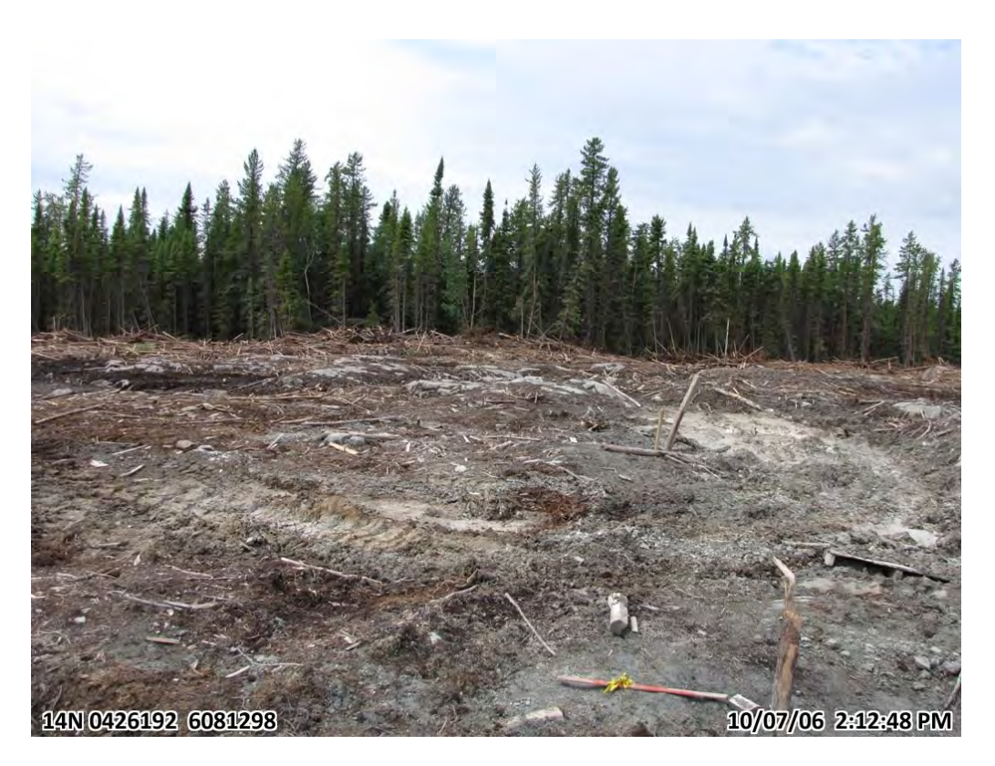
Photograph 17. Panoramic of cleared Lalor site, numerous bedrock ridges (6 July 2010)