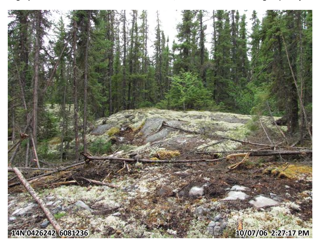
Photograph 20. Bedrock and lichen south of the Lalor site (6 July 2010)