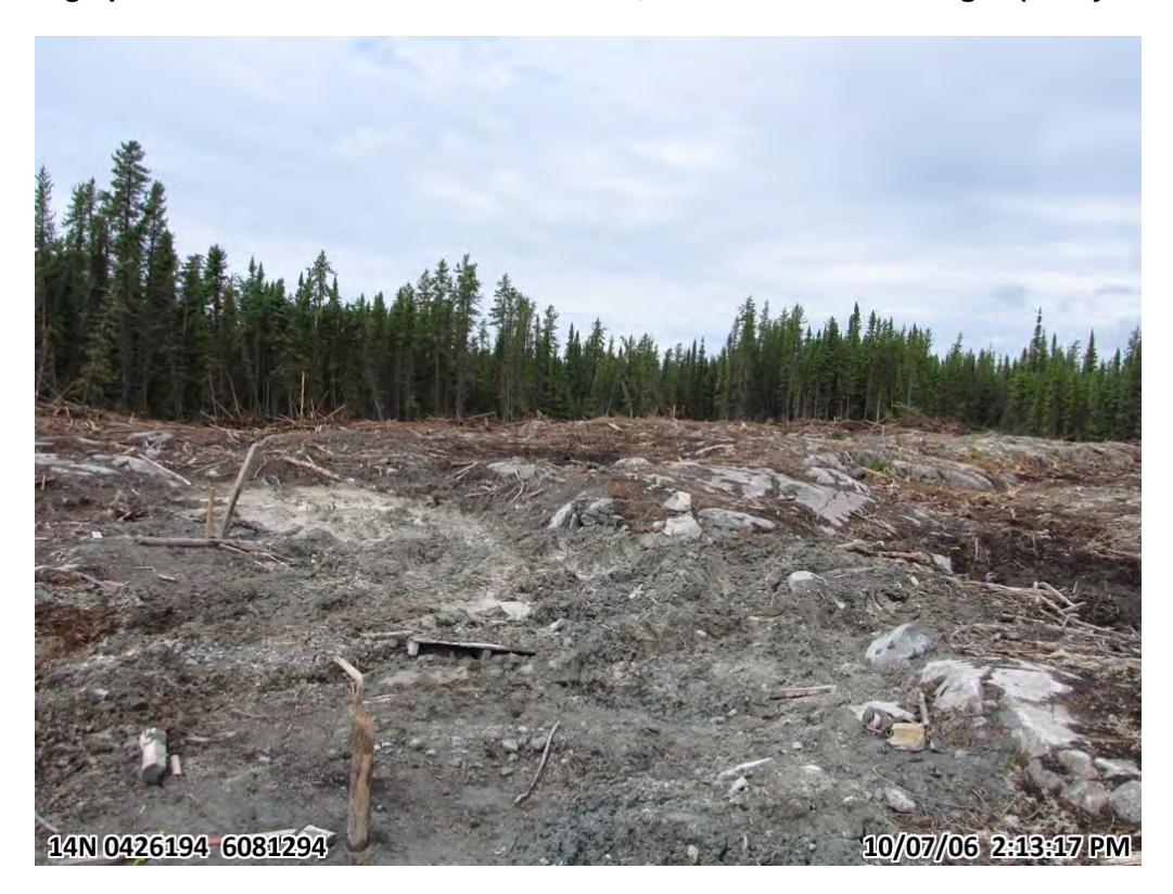
Photograph 18. Panoramic of cleared Lalor site, numerous bedrock ridges (6 July 2010)