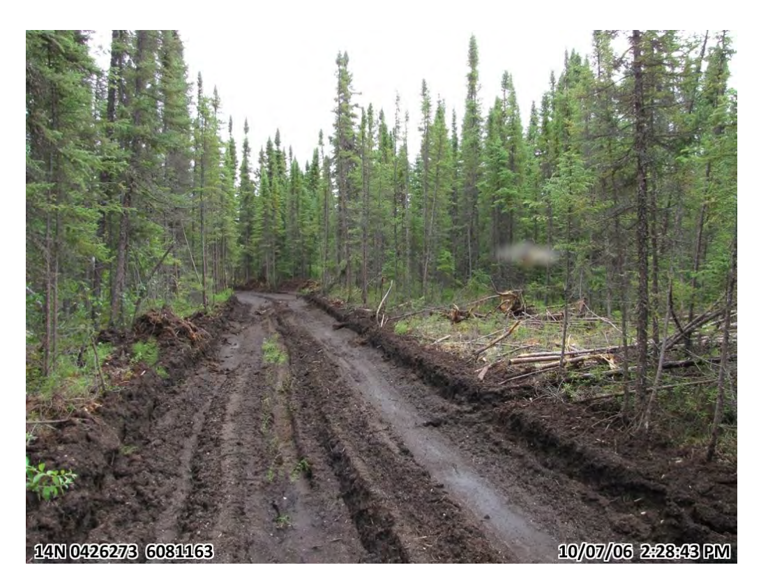
Photograph 21. Drill road off south side of the Lalor site (6 July 2010)