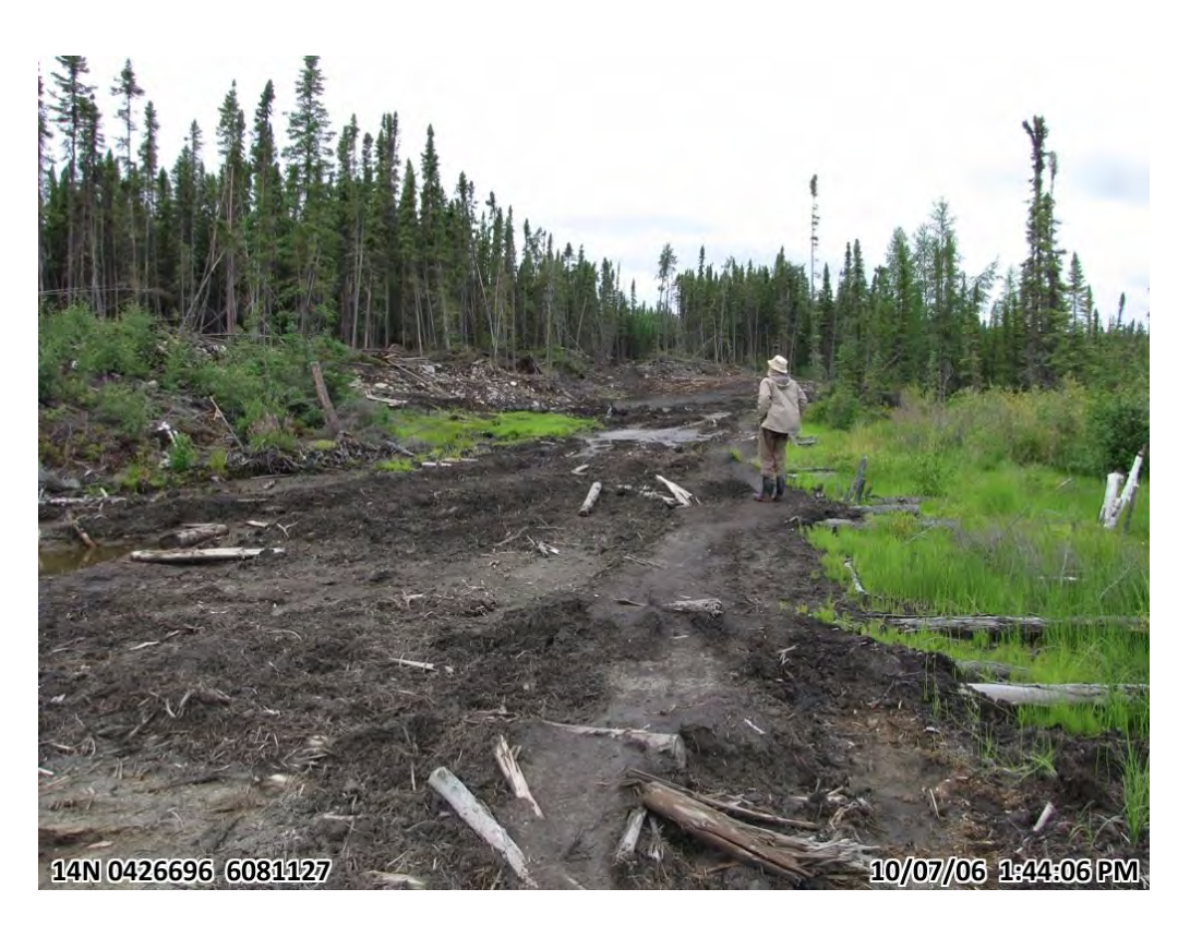
Photograph 03. Wetland at end of former drill road (6 July 2010)