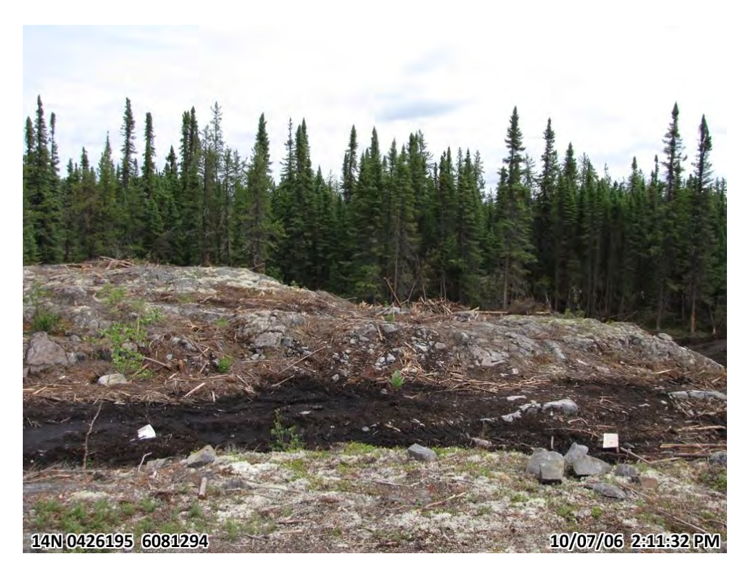
Photograph 11. Panoramic of cleared Lalor site, numerous bedrock ridges (6 July 2010)