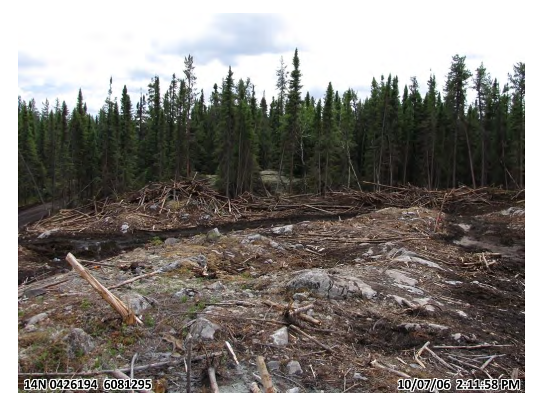
Photograph 13. Panoramic of cleared Lalor site, numerous bedrock ridges (6 July 2010)