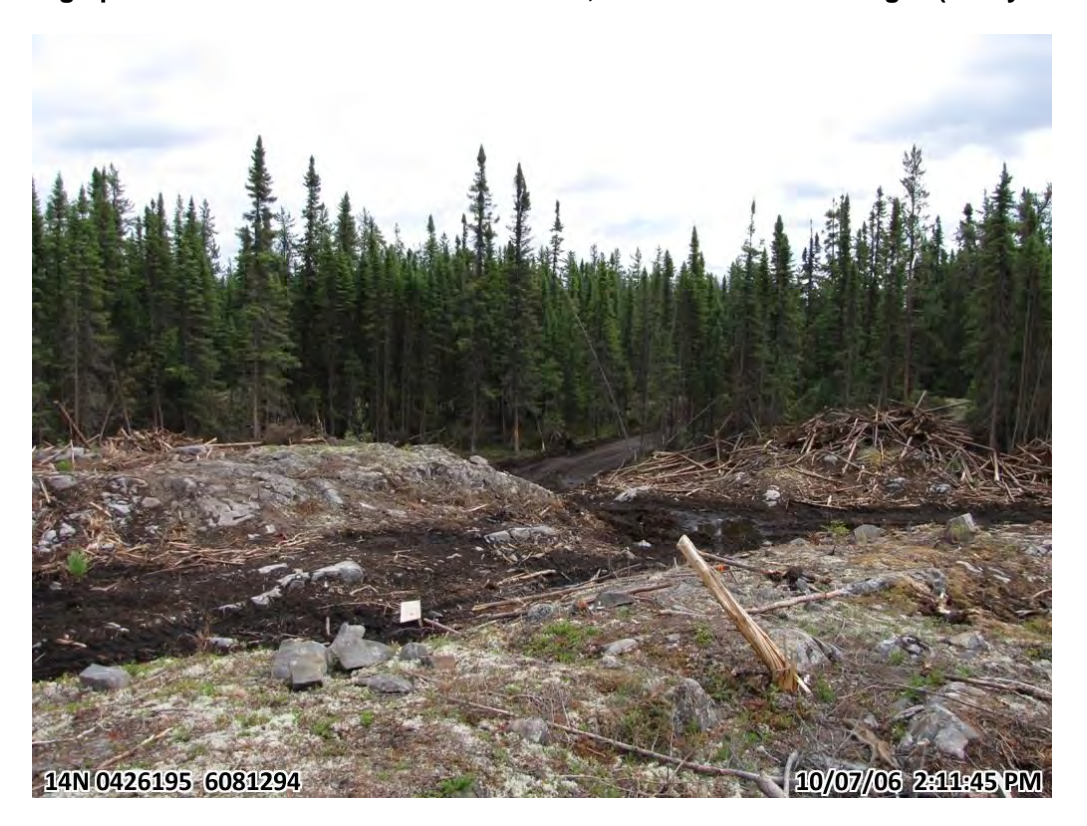
Photograph 12. Panoramic of cleared Lalor site, numerous bedrock ridges (6 July 2010)