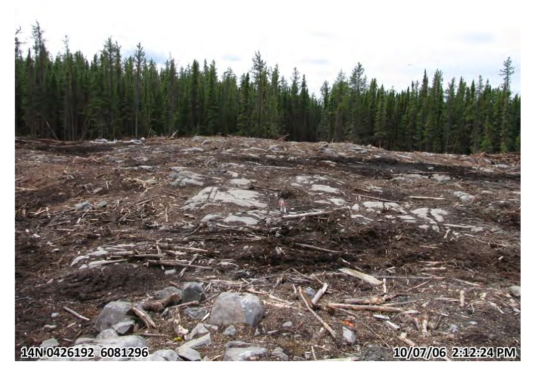
Photograph 15. Panoramic of cleared Lalor site, numerous bedrock ridges (6 July 2010)