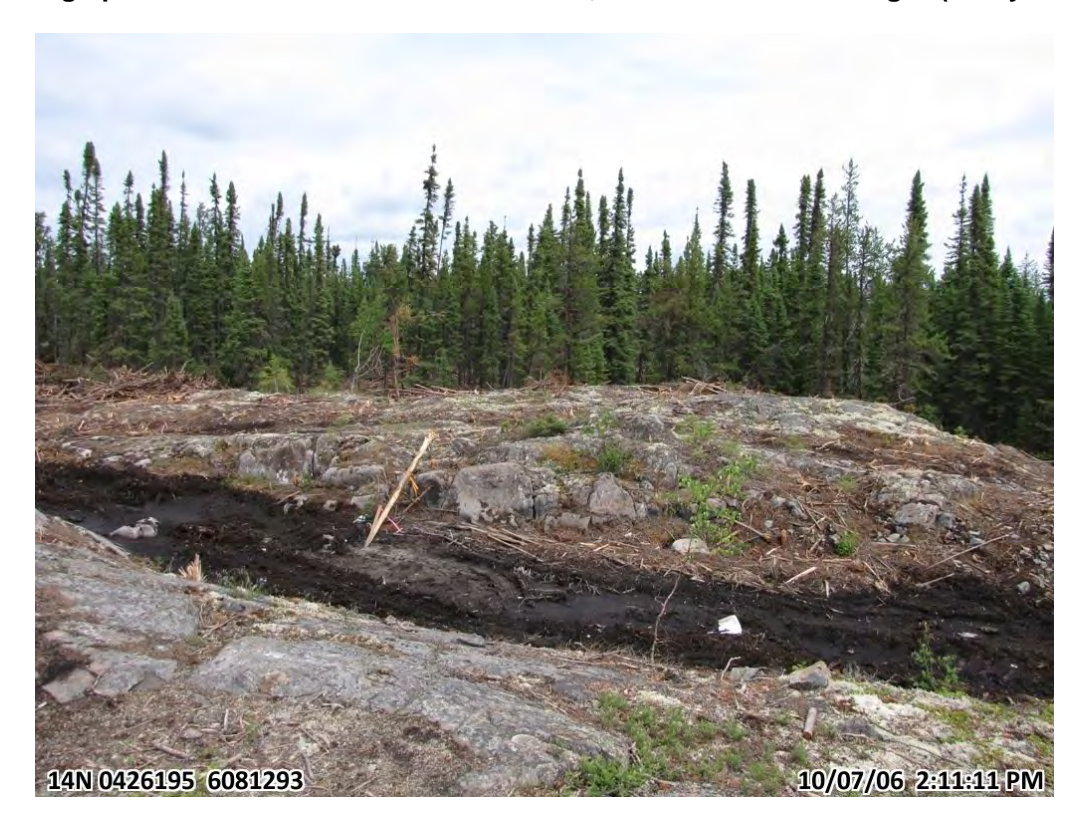
Photograph 10. Panoramic of cleared Lalor site, numerous bedrock ridges (6 July 2010)