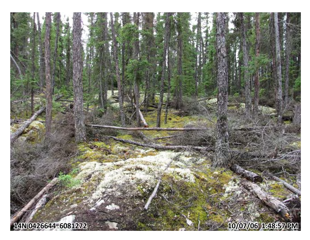
Photograph 05. Lichen and sphagnum to east of Lalor site (6 July 2010)