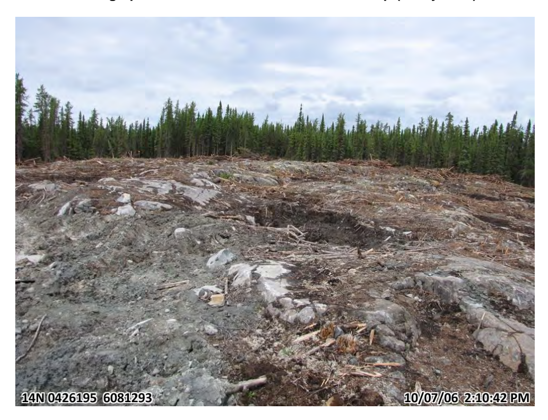
Photograph 08. Panoramic of cleared Lalor site, numerous bedrock ridges (6 July 2010)