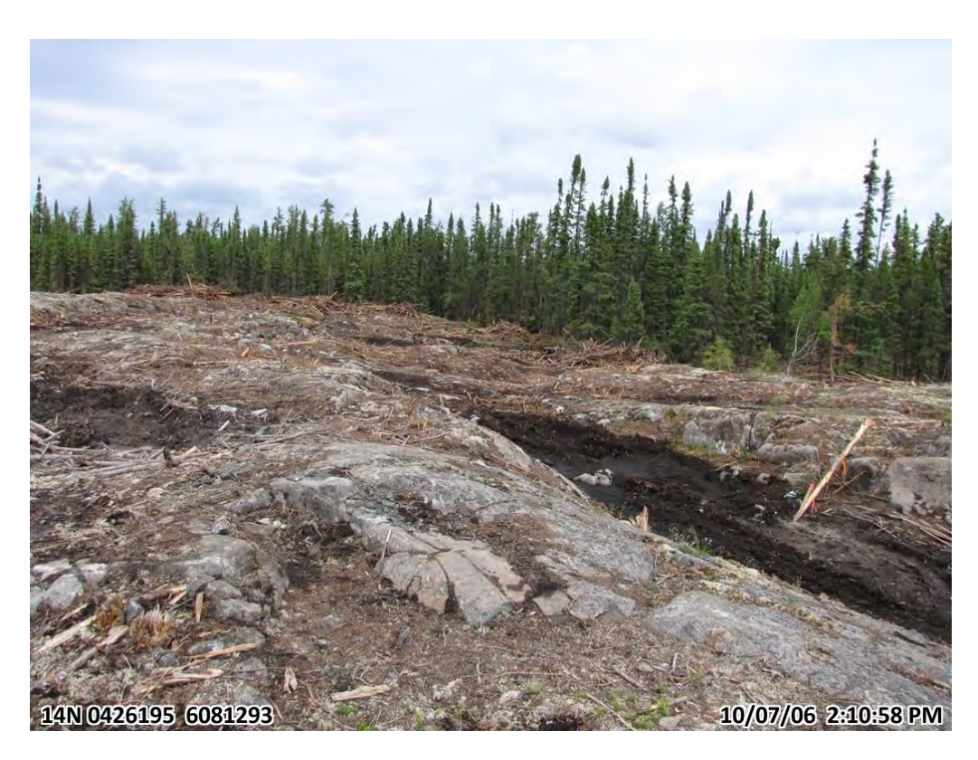
Photograph 09. Panoramic of cleared Lalor site, numerous bedrock ridges (6 July 2010)