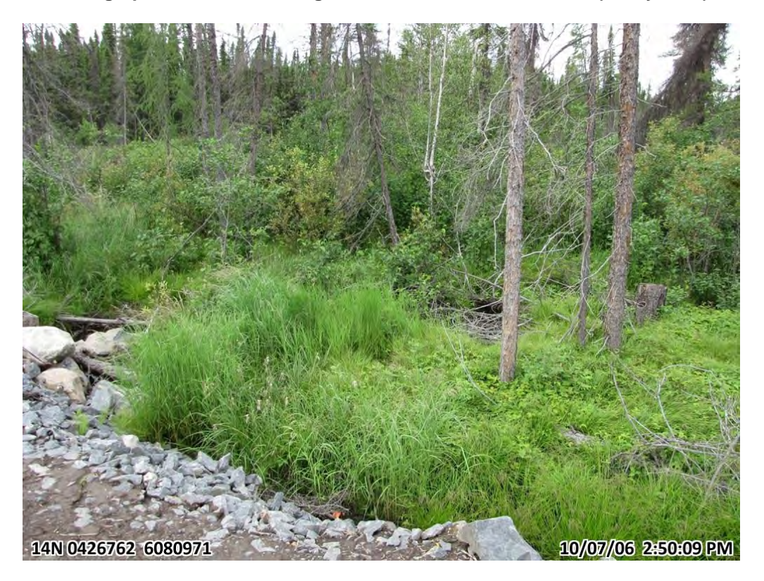
Photograph 24. Grasses at cleared drill site at end of former drill road (6 July 2010)