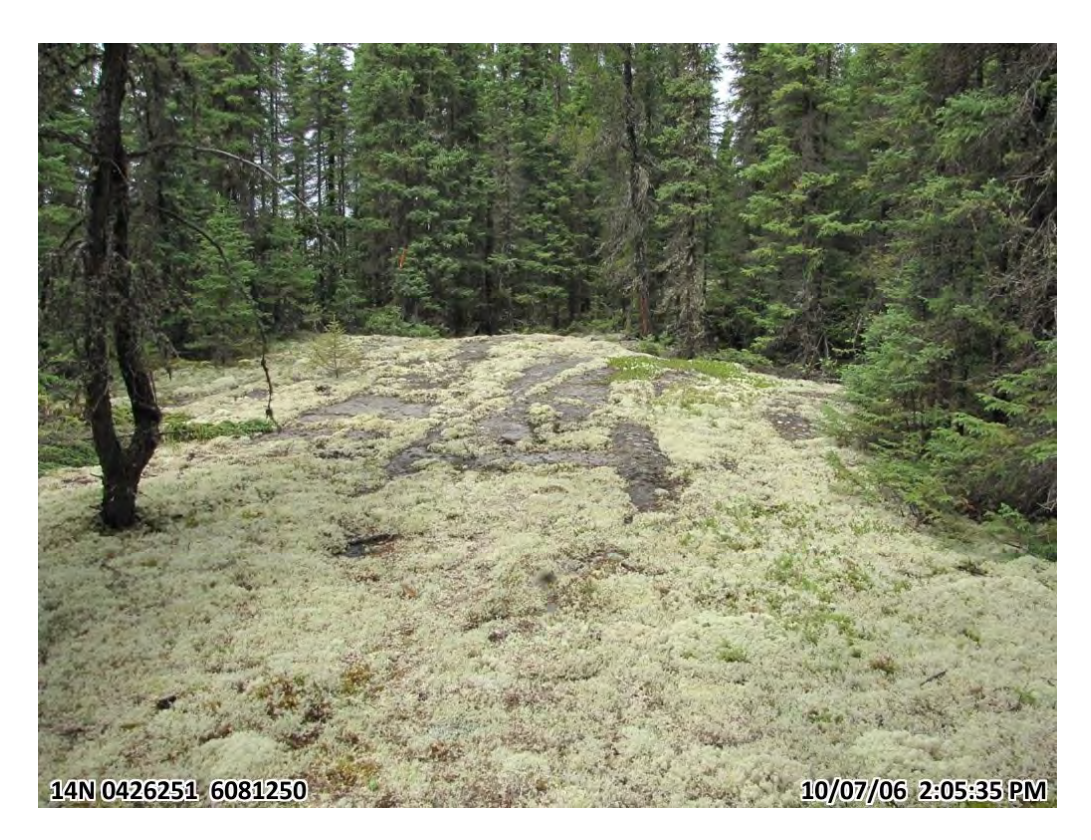
Photograph 07. Lichen cover on bedrock outcrop (6 July 2010)