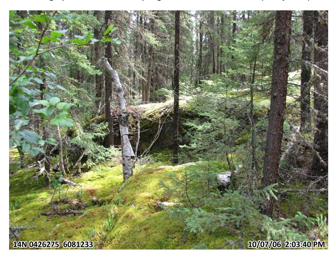
Photograph 06. Deep sphagnum to east of proposed Lalor Concentrator site, Black Spruce canopy (6 July 2010)