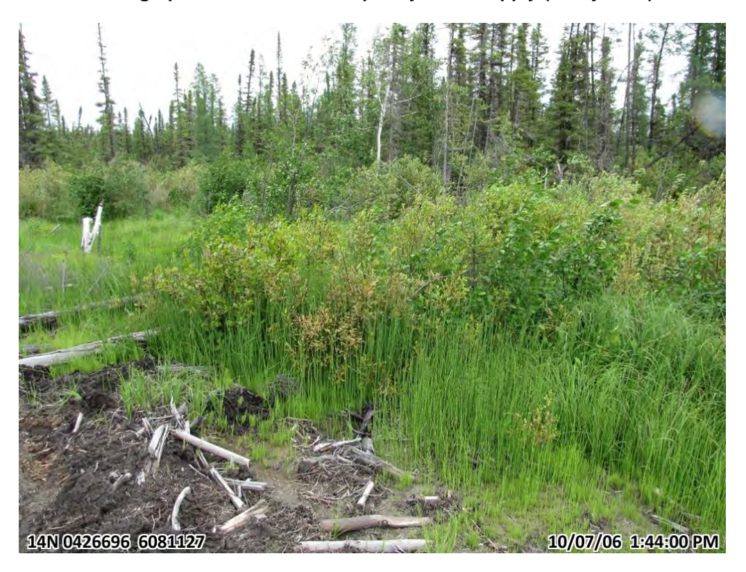
Photograph 02. Wetland at end of former drill road (6 July 2010)