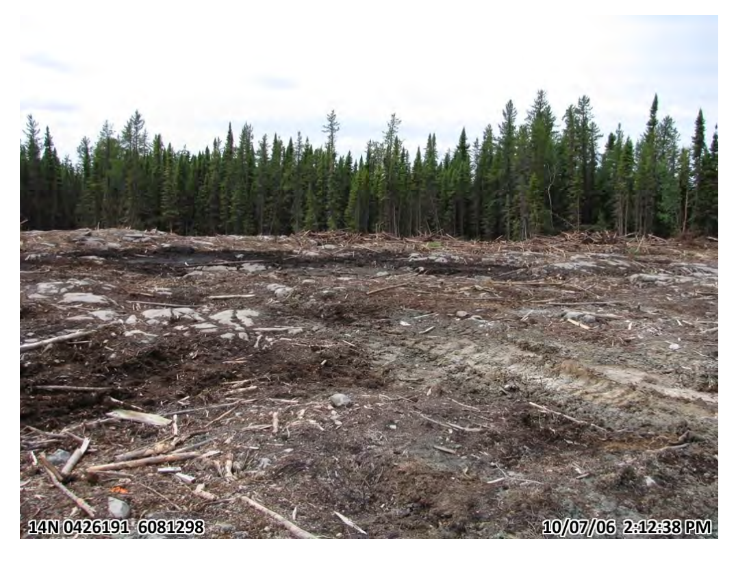
Photograph 16. Panoramic of cleared Lalor site, numerous bedrock ridges (6 July 2010)