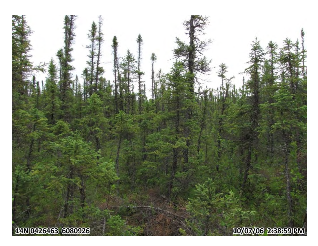
Photograph 23. Treed muskeg to south side of the Lalor site (6 July 2010)