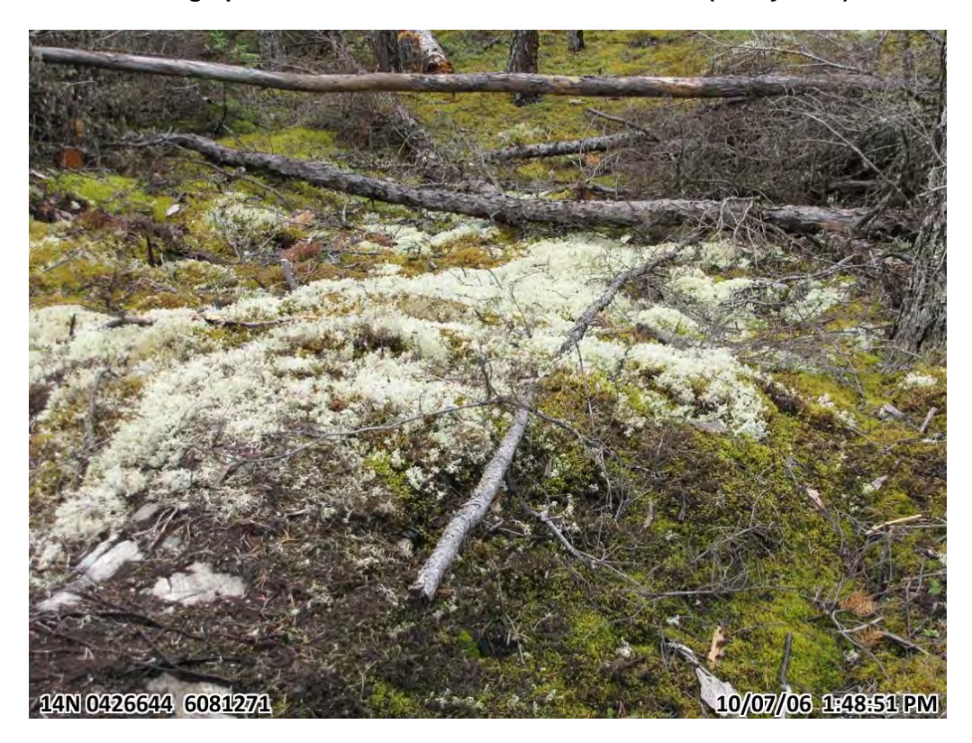
Photograph 04. Lichen and sphagnum to east of Lalor site (6 July 2010)