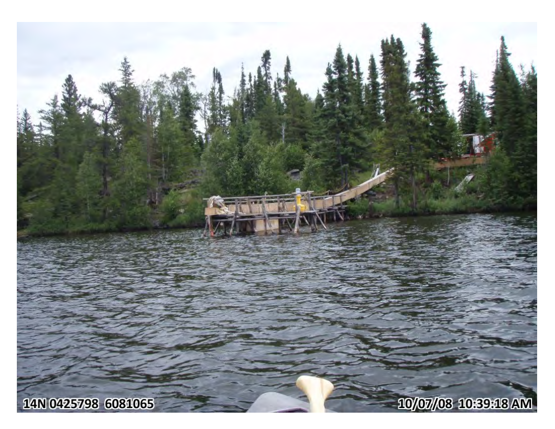
Photograph 01. Lalor Lake temporary water supply (8 July 2010)