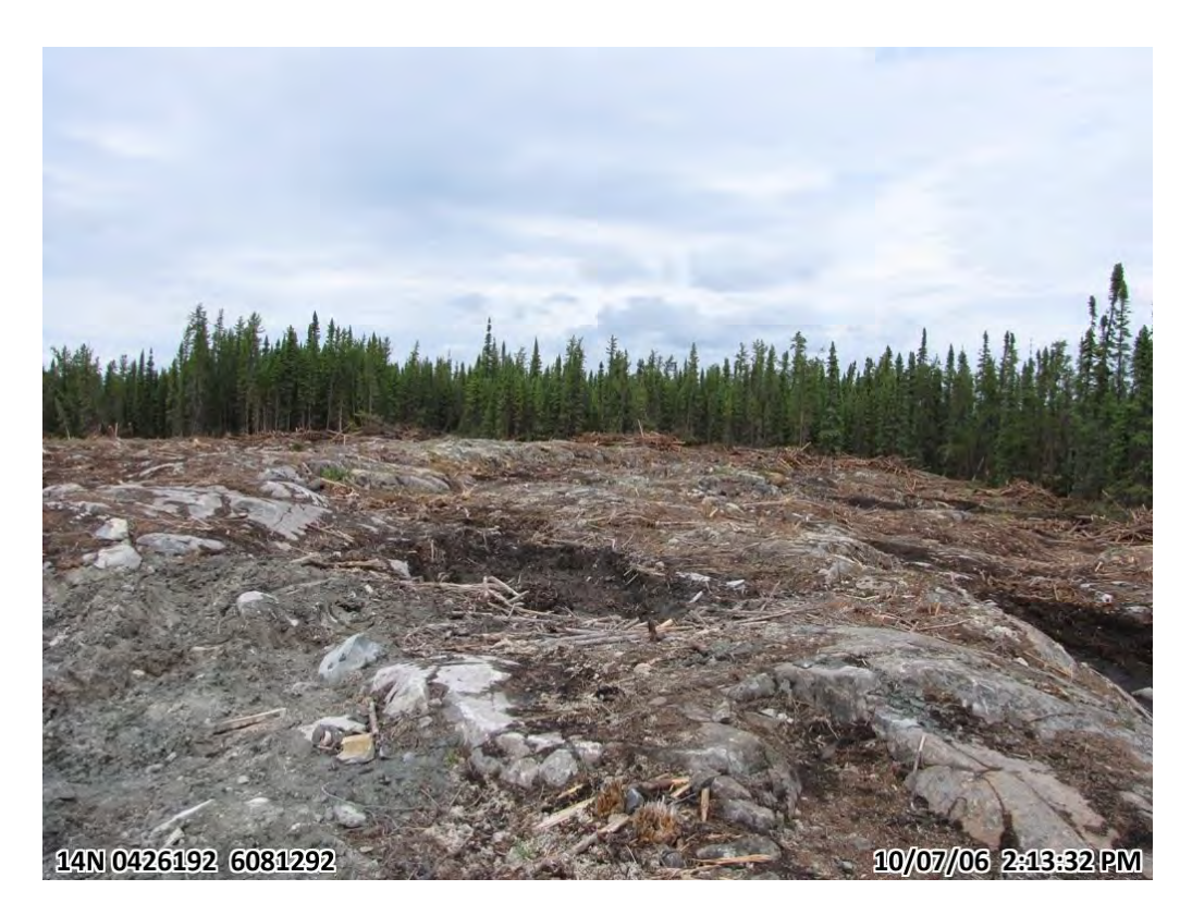
Photograph 19. Panoramic of cleared Lalor site, numerous bedrock ridges (6 July 2010)