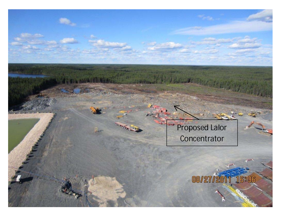
Photo 2 - Location of the proposed Lalor Concentrator, looking north.

Photo 1 - Aerial view of the Lalor site, looking northwest and showing the location of the proposed Lalor Concentrator.