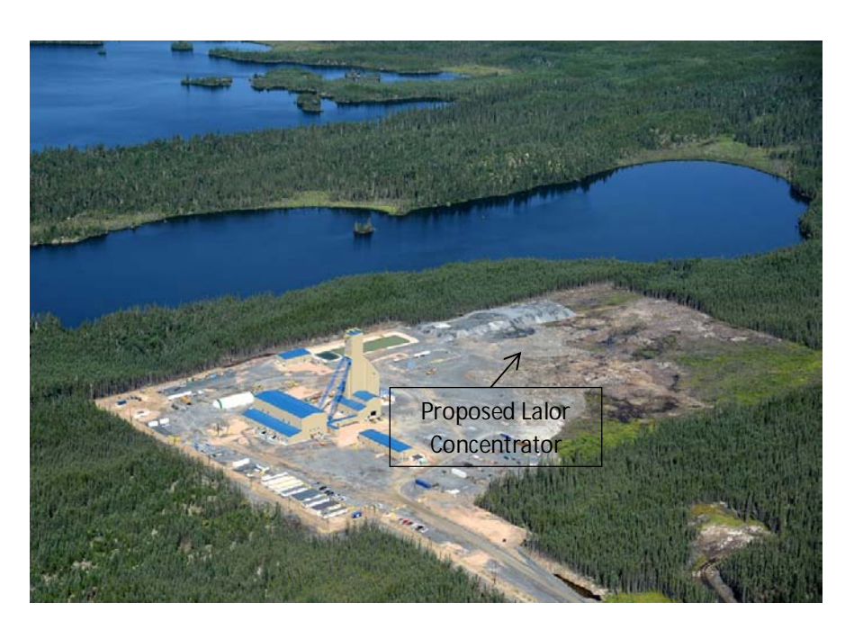
Photo 1 - Aerial view of the Lalor site, looking northwest and showing the location of the proposed Lalor Concentrator.