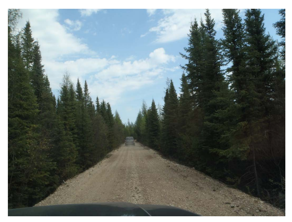
Photo 4: Corridor of the Pipeline System (along the former rail bed).

Photo 3 - Corridor of the Pipeline System (along the Lalor Access Road from Lalor site to PR 395).