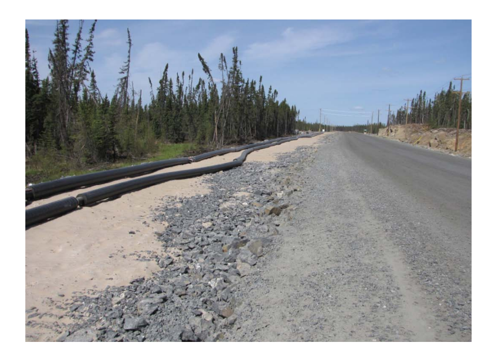
Photo 3 - Corridor of the Pipeline System (along the Lalor Access Road from Lalor site to PR 395).