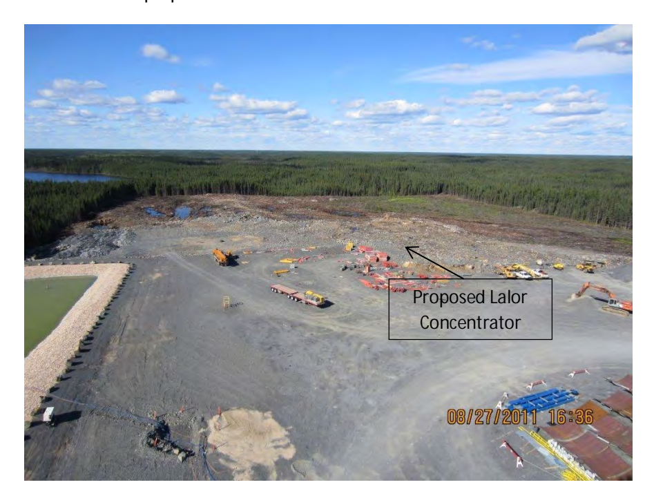
Photo 2 - Location of the proposed Lalor Concentrator, looking north.