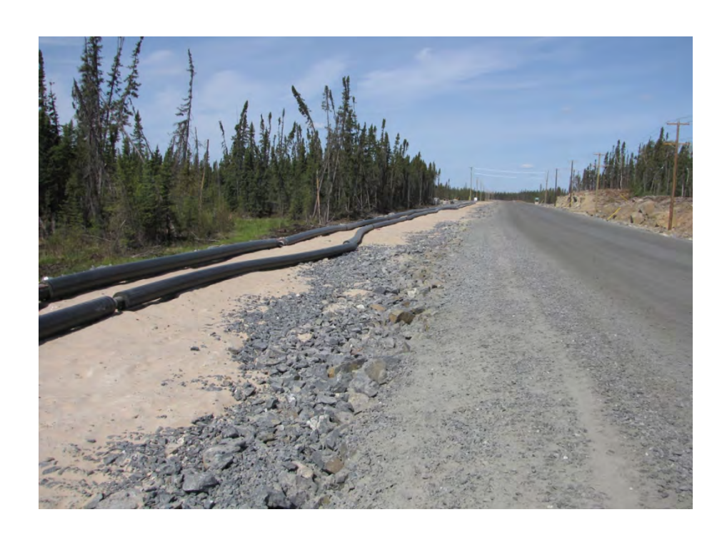
Photo 3 - Corridor of the Pipeline System (along the Lalor Access Road from Lalor site to PR 395).