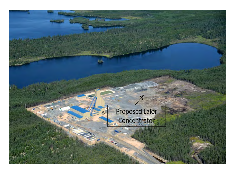
Photo 1 - Aerial view of the Lalor site, looking northwest and showing the location of the proposed Lalor Concentrator.