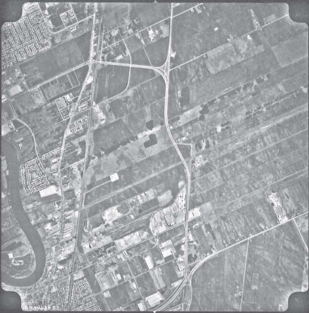
Lockheed Survey Corporation, 1967