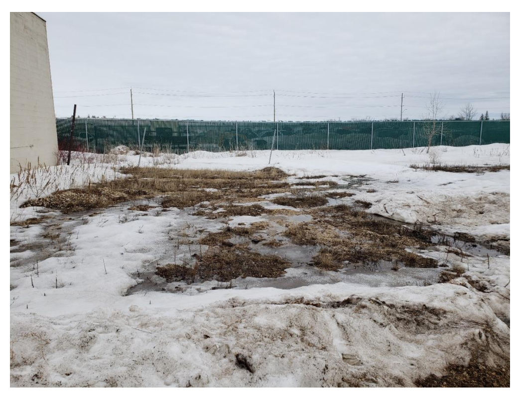
Figure 4 – View of Expansion Area Prior to Expansion Start