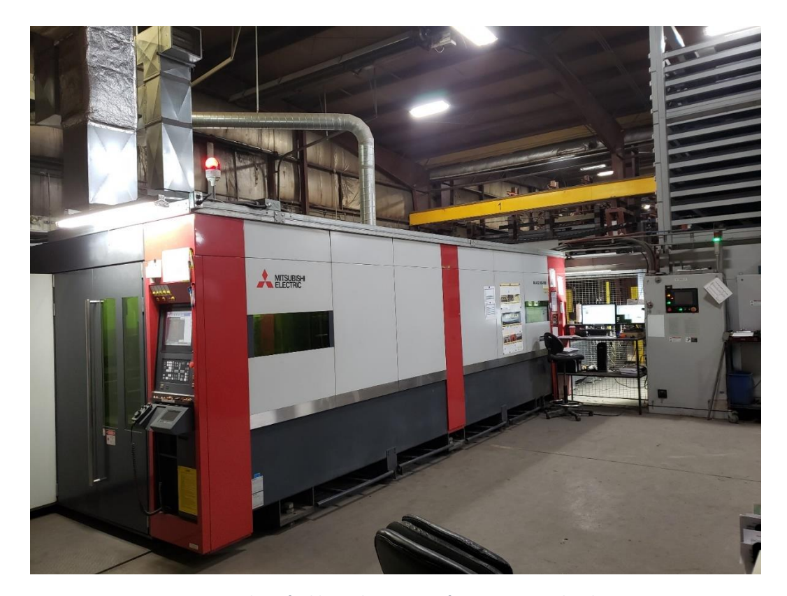
Figure 1-Example 1 of Additional Equipment for Expansion-Flat Sheet Laser