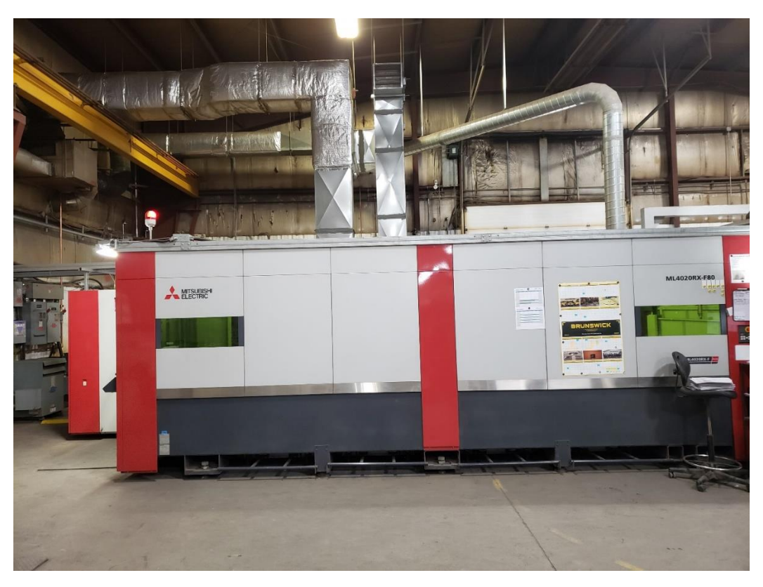
Figure 2 - Example 2 of Additional Equipment for Expansion – Flat Sheet Laser