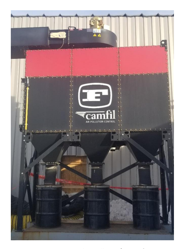
Figure 3 – Laser dust collector/air purifier