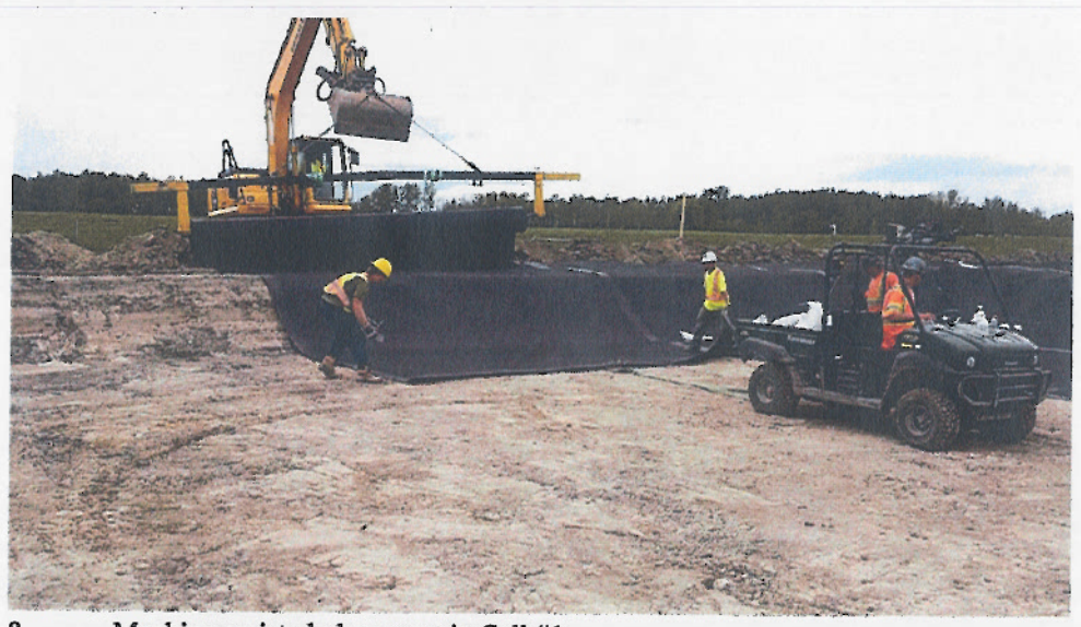
8. Machine assisted placement in Cell #1