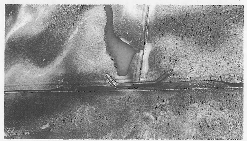
16. T- weld reinforcement detail along butt seams