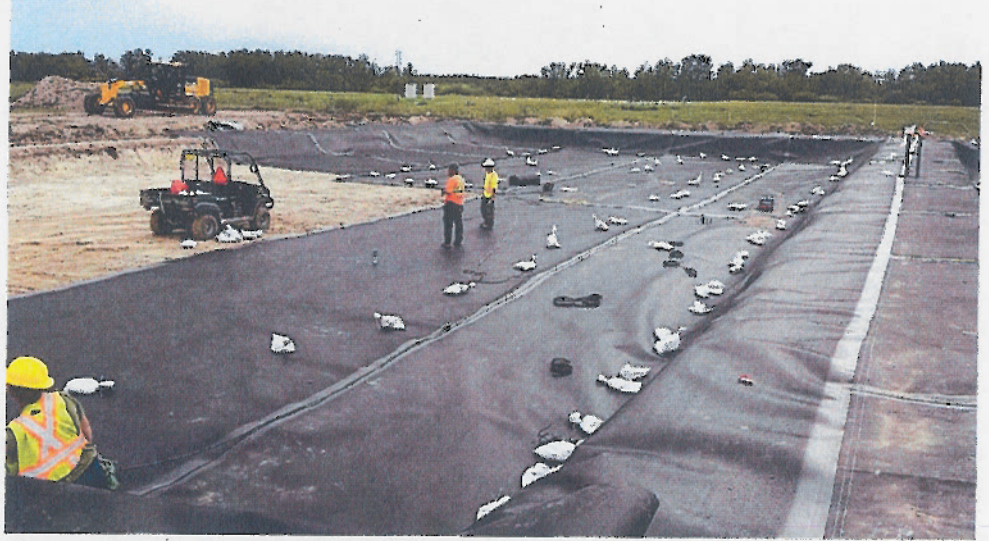
10. Partially Completed Cell #1