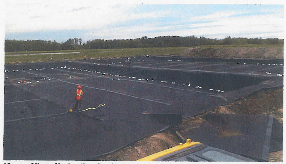
12. View of both cells - final butt seam welding