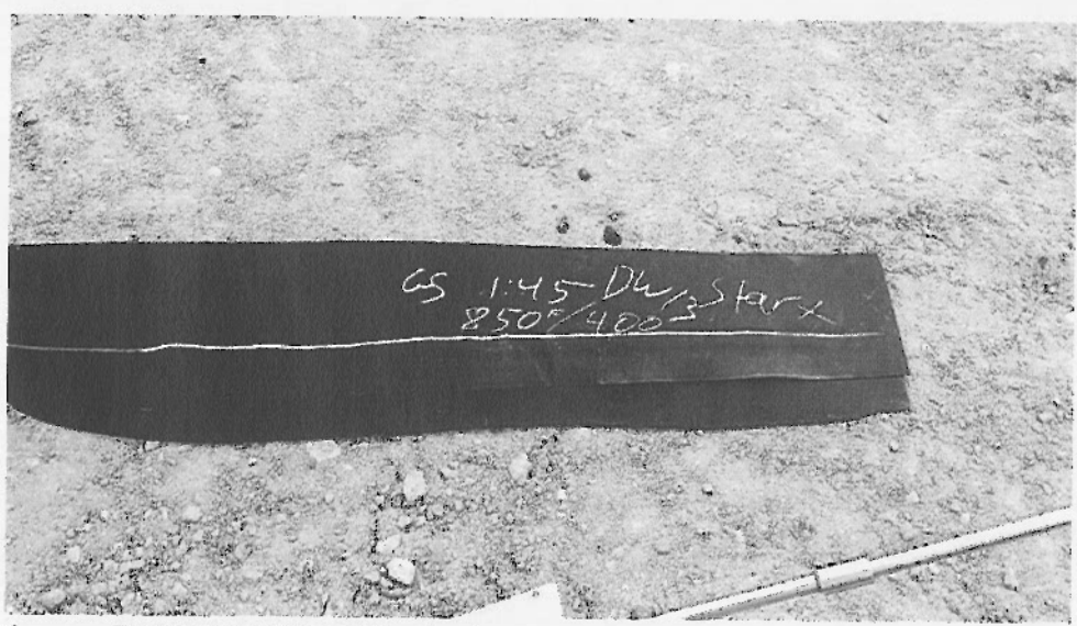
6. Test Seam before welding begins