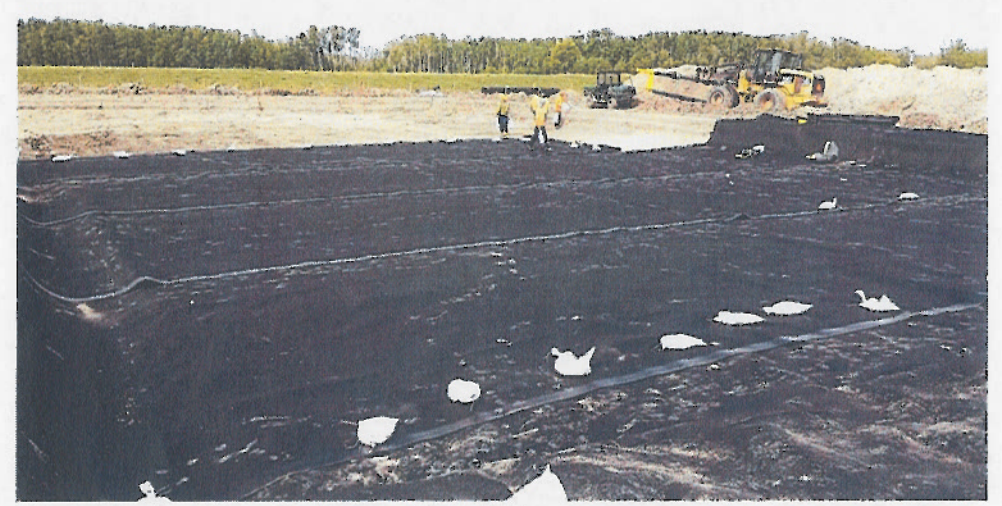
2. Part way through placement in Cell #2