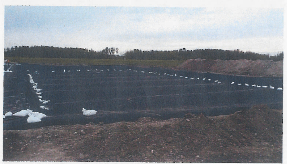
14. Cell #2 Placement and Wedge Welding Complete