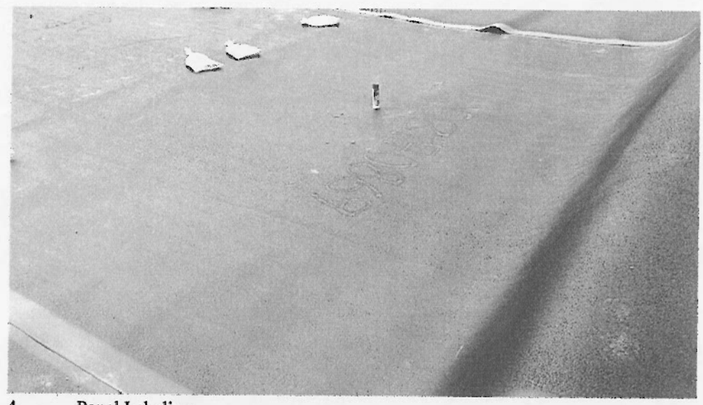
4. Panel Labeling