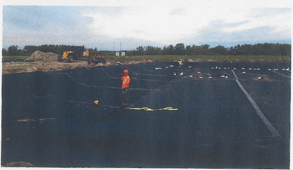
11. Completed placement in Cell #1