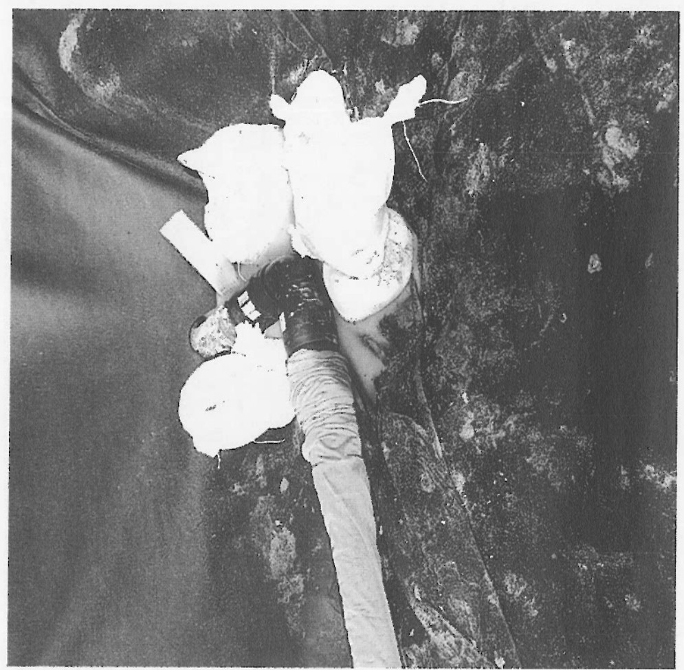
19. Finished Pipe Penetration in Cell #1 – with geo-cushion and drain pipe