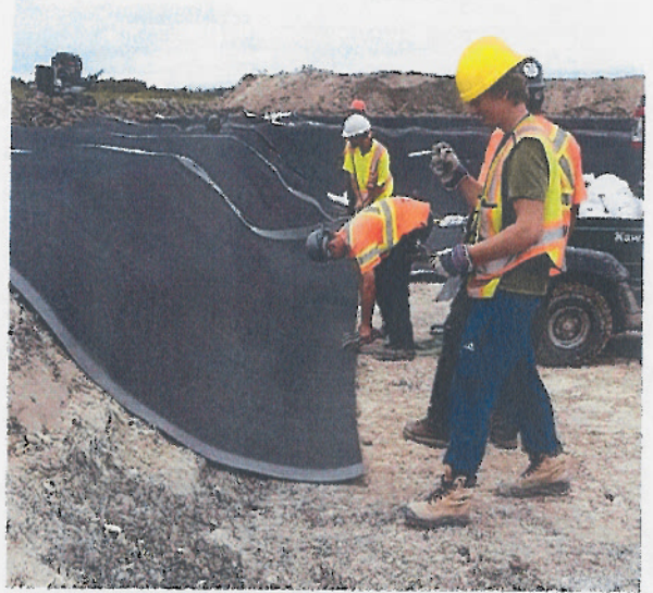
9. Clamp detail – 1/2" diameter bars on clamp prevent marring of liner