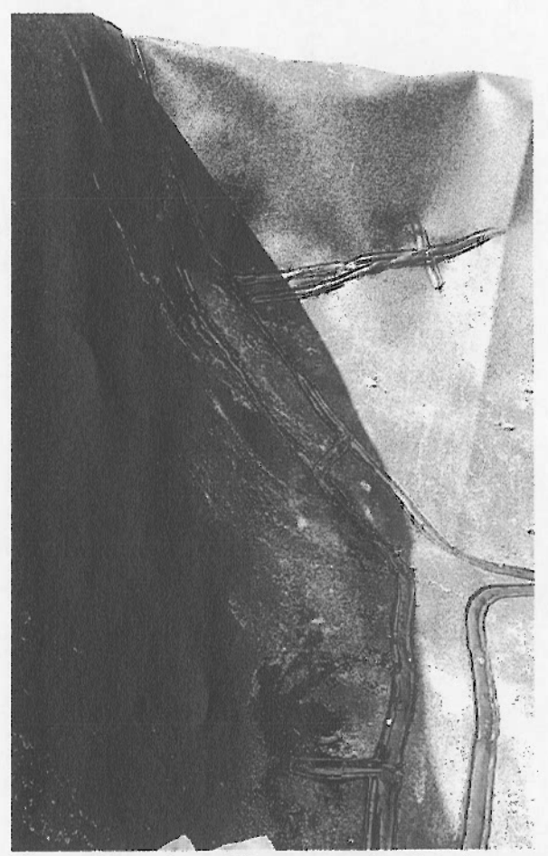
17. Extrusion welding on complex sloped corner