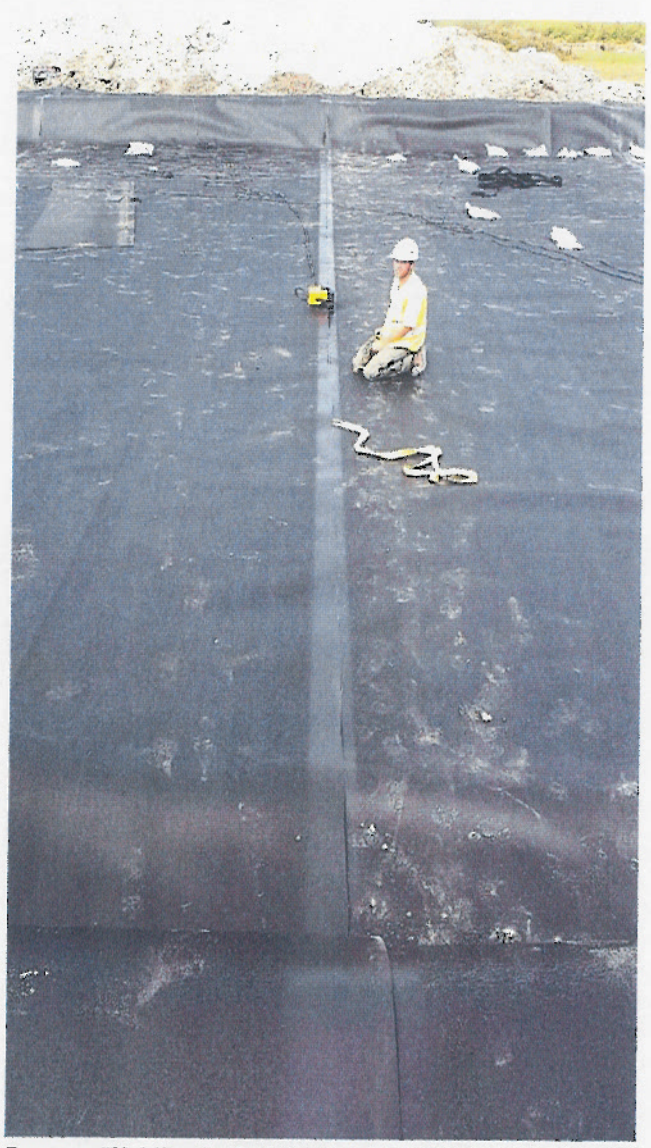
7. Welding in Cell #2- white line indicates 125 mm (5") overlap