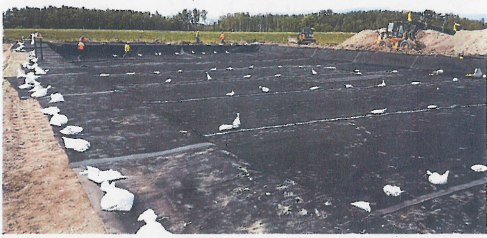
3. Cell #2 Placement Complete