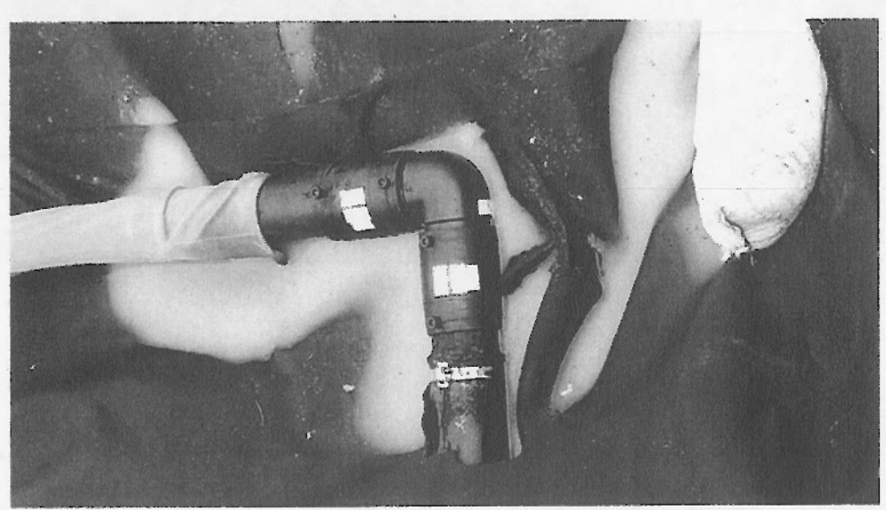
18. Finished Pipe Penetration in Cell #2 (with geo-cushion and drain pipe)