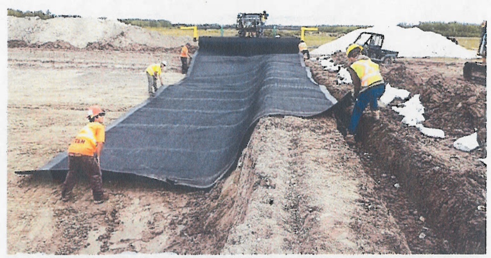
1. Placing First Roll in Cell #2 by hand