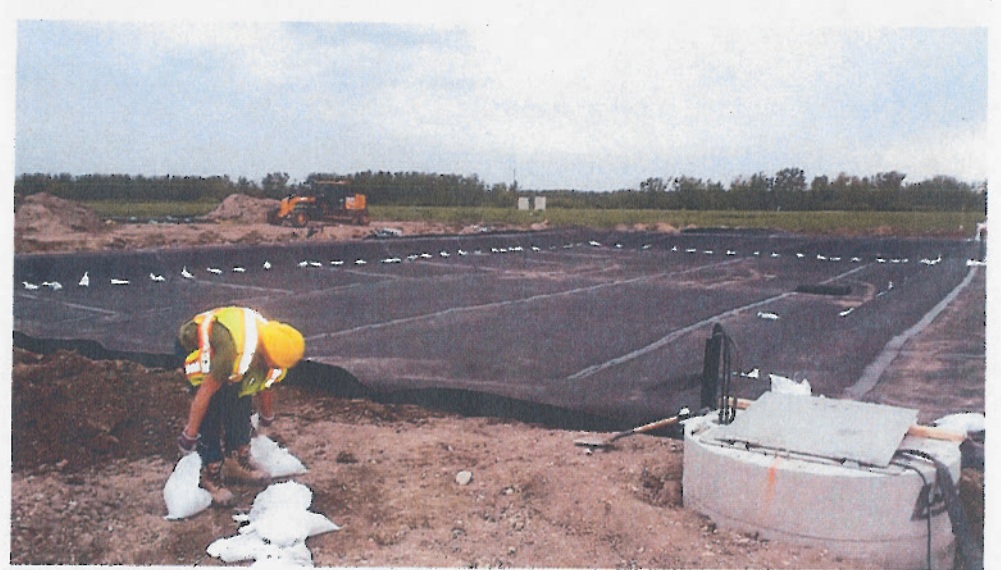
13. Cell #1 Placement and Wedge Welding Complete