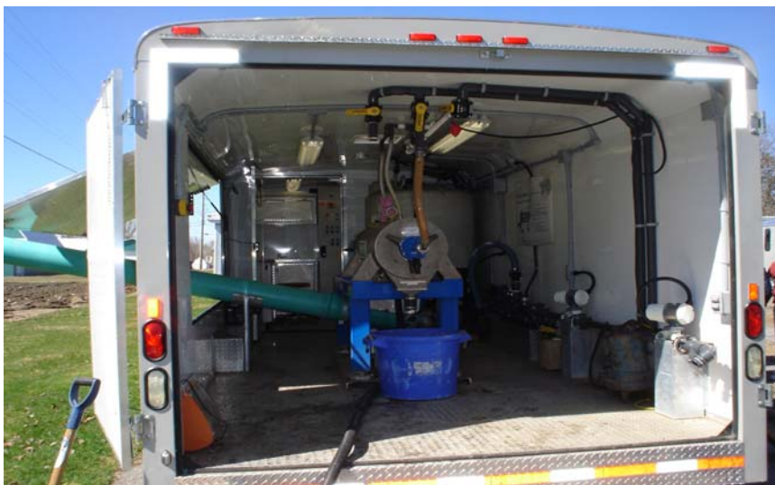
Figure 1. The Mobile Unit on a Manitoba Pig Farm.