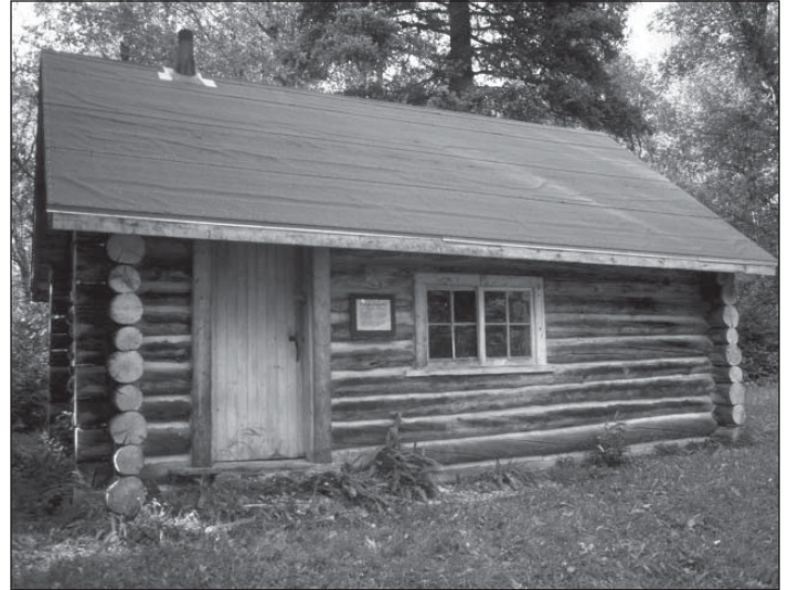
Ranger Sinclair Cabin

The vision statement will help guide future park management decisions, and will assist in resolving future issues not specifically addressed in the management plan.