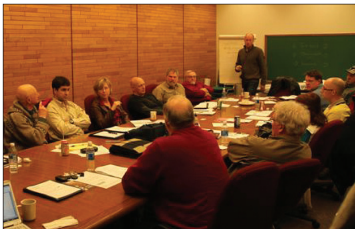
Duck Mountain Provincial Park Trails Working Group

Off-road vehicle use, and particularly ATV use, has increased significantly in Manitoba over the past 10 years. With this increase, negative vehicle impacts on park landscapes have become more apparent. Wet weather conditions in recent years have accelerated the deterioration of trails in some areas.