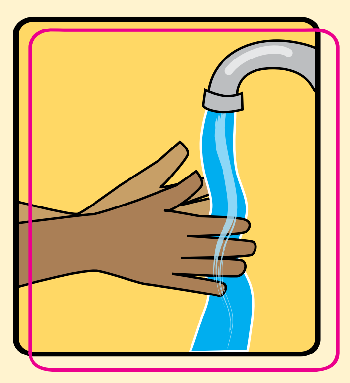
1. Wet hands under warm running water.