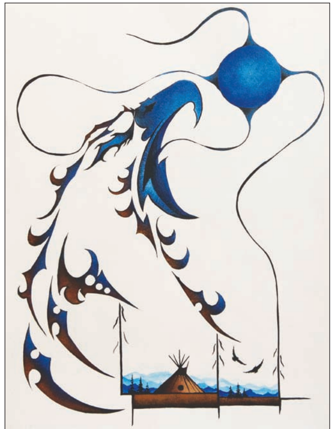
Title: Sleeping with Spirit #2

See Appendix B for recent investments that support the foundation of this strategic plan.