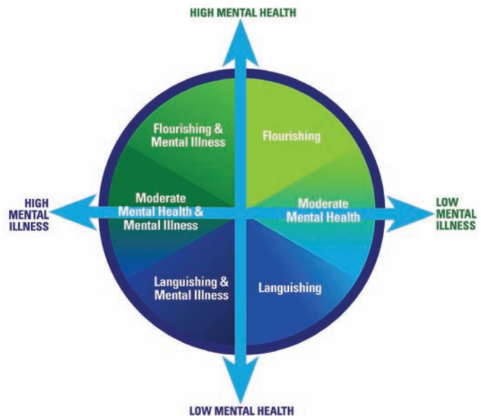
Dual continua model (Keyes, 2005)

Research in mental health demonstrates that factors contributing to positive mental health and well-being - defined as flourishing - and the factors that contribute to poor mental health - defined as languishing - can be measured. 43 The significance of this research is that it illustrates that individuals may have a mental illness and still flourish if they experience the features of positive mental health. Also a significant finding is that individuals without a diagnosed mental illness may have low mental health consistent with the definition of languishing and be at risk of developing a mental illness.