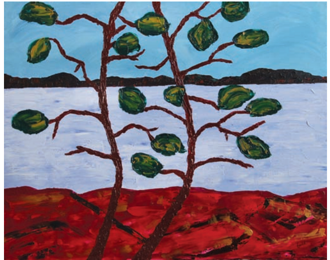
Title: Warm Shore

In 2007, the Healthy Child Manitoba Strategy was legislated in The Healthy Child Manitoba Act . The Healthy Child Committee of Cabinet includes all ministers whose portfolios incorporate issues affecting children, youth and families. The work of the Province's Healthy Child Advisory Committee – with representatives from parent-child coalitions, communities and sectors across Manitoba – was also addressed under this legislation. The Healthy Child Manitoba Strategy is a nationally-recognized policy model based on holistic and integrated structures.