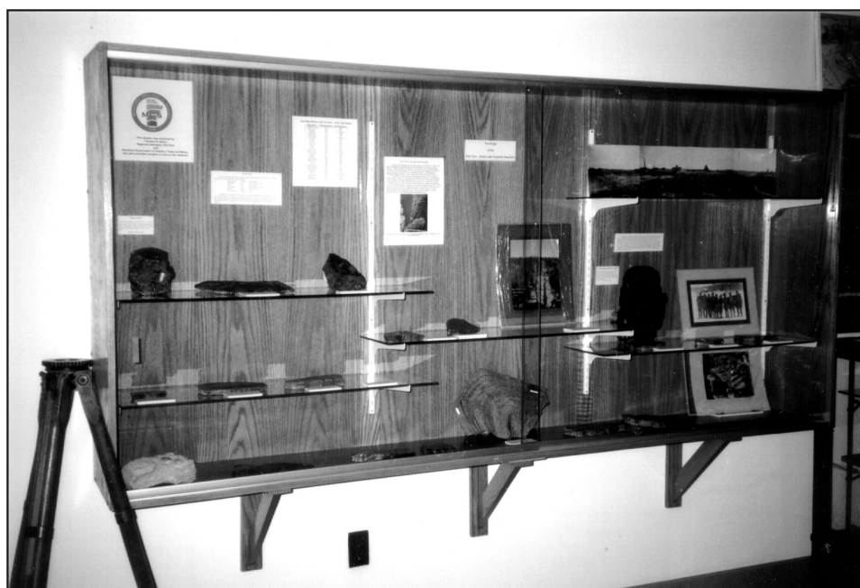
Figure GS-5-1: Manitoba Geological Survey display in the Flin Flon Station Museum, showing the origin of volcanogenic massive sulphide deposits using samples from the base-metal mines of the region.