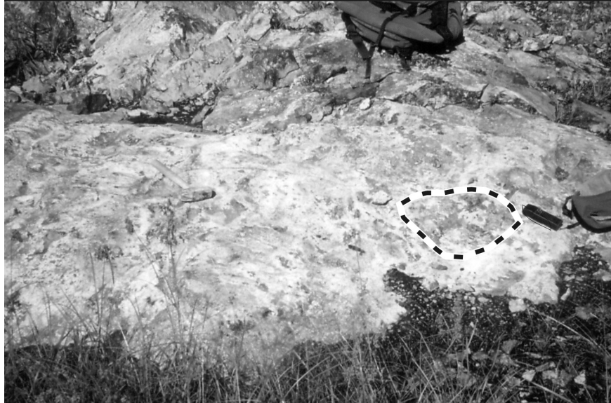
Figure GS-25-2: Anorthositic gabbro hosting sulphide-bearing semi-digested boulders (boulder outlined for better visibility).