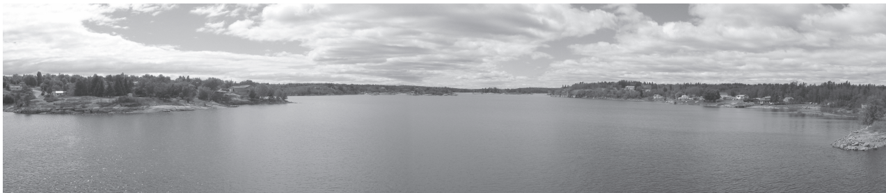
Figure GS-19-1: The Winnipeg River, immediately downstream of Lake of the Woods.

During the 2004 field season, tree-ring data was collected at 11 locations within the Winnipeg River basin, with most of them falling in an area roughly demarcated by the communities of Kenora, Thunder Bay and Fort Frances in Ontario (Figure GS-19-2). Sampling concentrated on the three longest-lived tree species in this area — eastern white pine ( Pinus strobus ), red pine ( Pinus resinosa ) and eastern white cedar ( Thuja