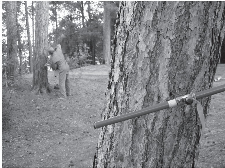
Figure GS-19-3: Collecting tree cores from red pine ( Pinus resinosa ) at Gordon Lake, Ontario.

Arizona. These specimens, along with those collected in 2004, will be measured during the 2005/06 academic year, and the data generated will be used to characterize tree growth in the Winnipeg River region over the last two to three centuries. Subsequent analysis will determine if this data can be used to estimate the past occurrence and severity of drought in the Winnipeg River system, and place recent droughts within a longer context.