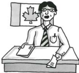
federal government worker: a person who works for the government.