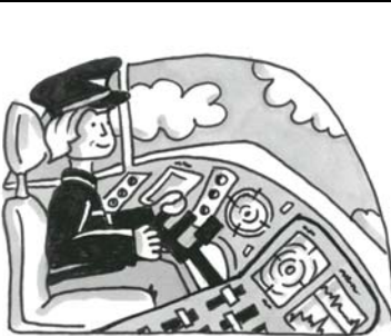
pilot: a person who flies a plane.