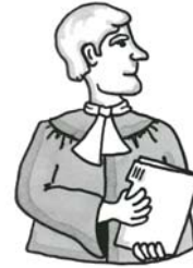
professional lawyer: a person who works for the justice system.