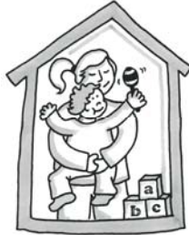
babysitter: a person who looks after young children at home.