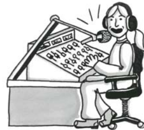
broadcaster: a person who works for radio or television.