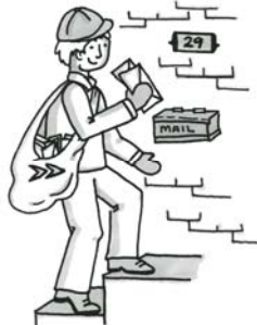
Canada Post worker: a person who works for the Canadian government mail system.