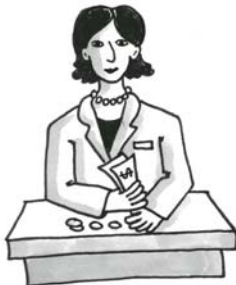
bank teller: a person who works at a bank.