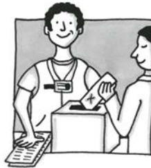
federal election worker: a person who works for Elections Canada