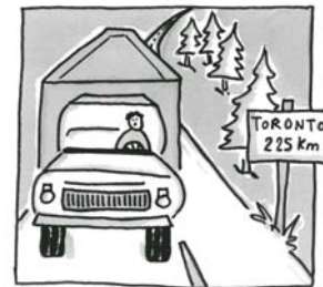
Long haul truck driver: a person who drives a truck for long distances.