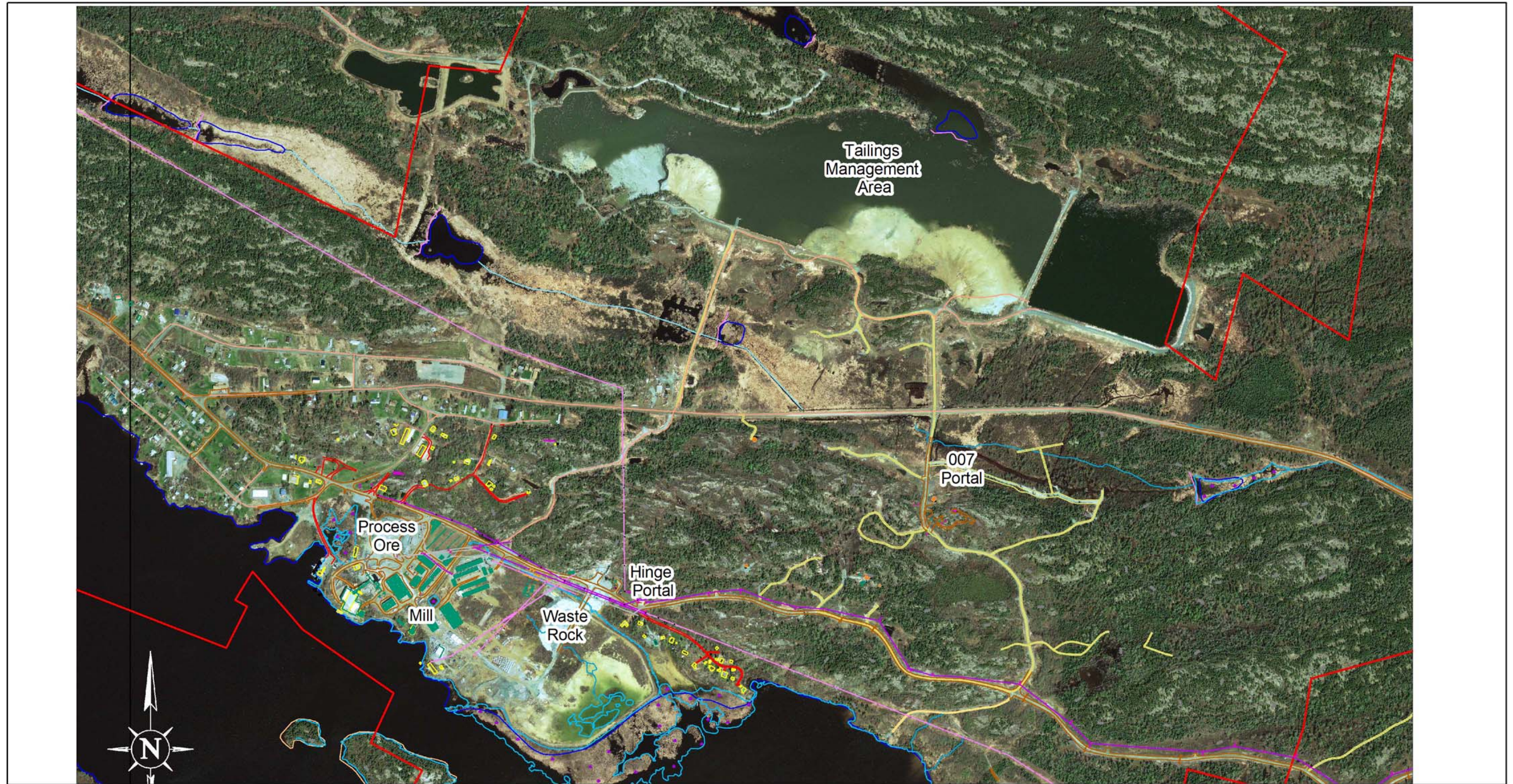
FIGURE 2 - Rice Lake Mill SITE LAYOUT