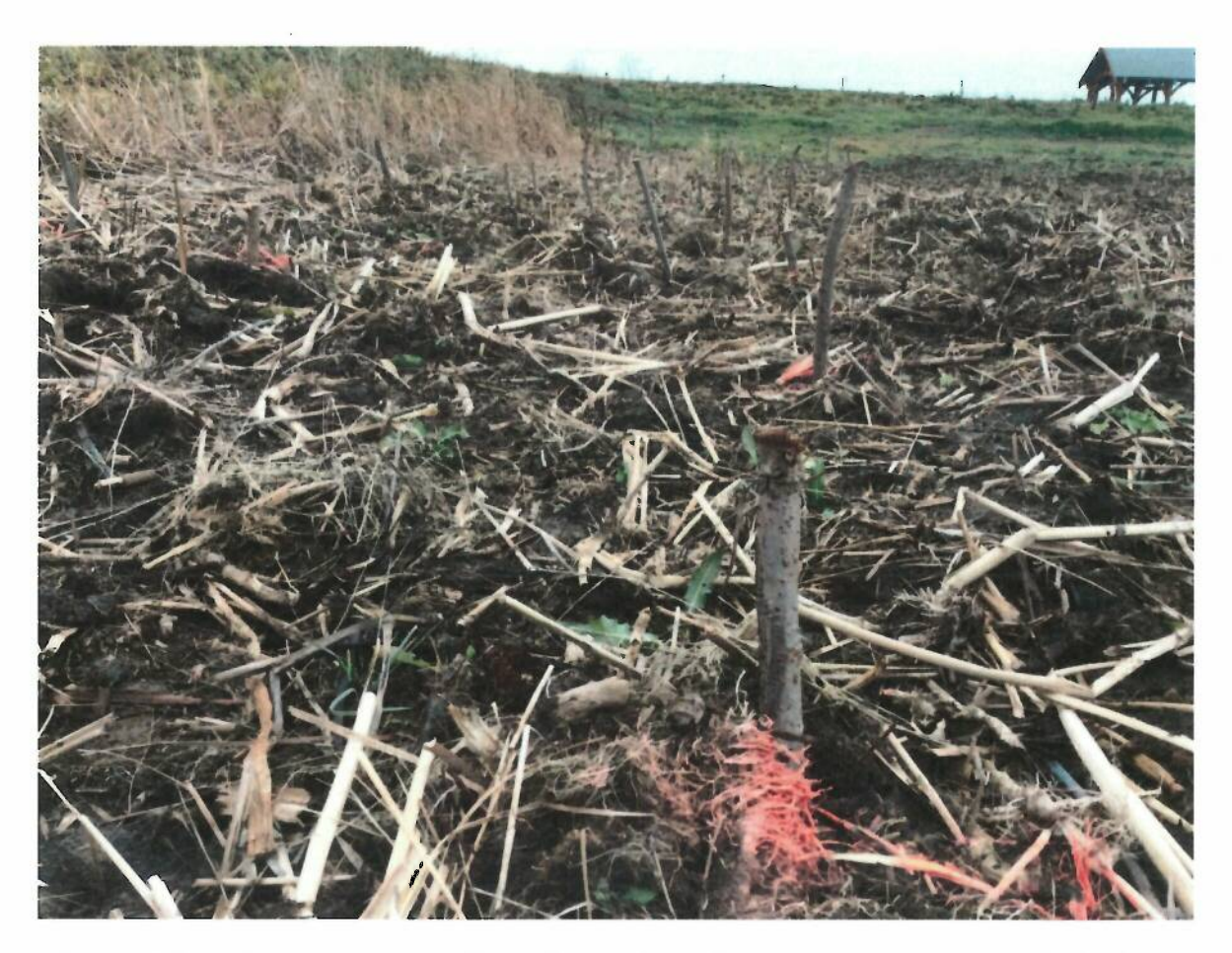
Figure 2. Willow plantings on north side of former dry cell. (Imagery date: October 29, 2018).