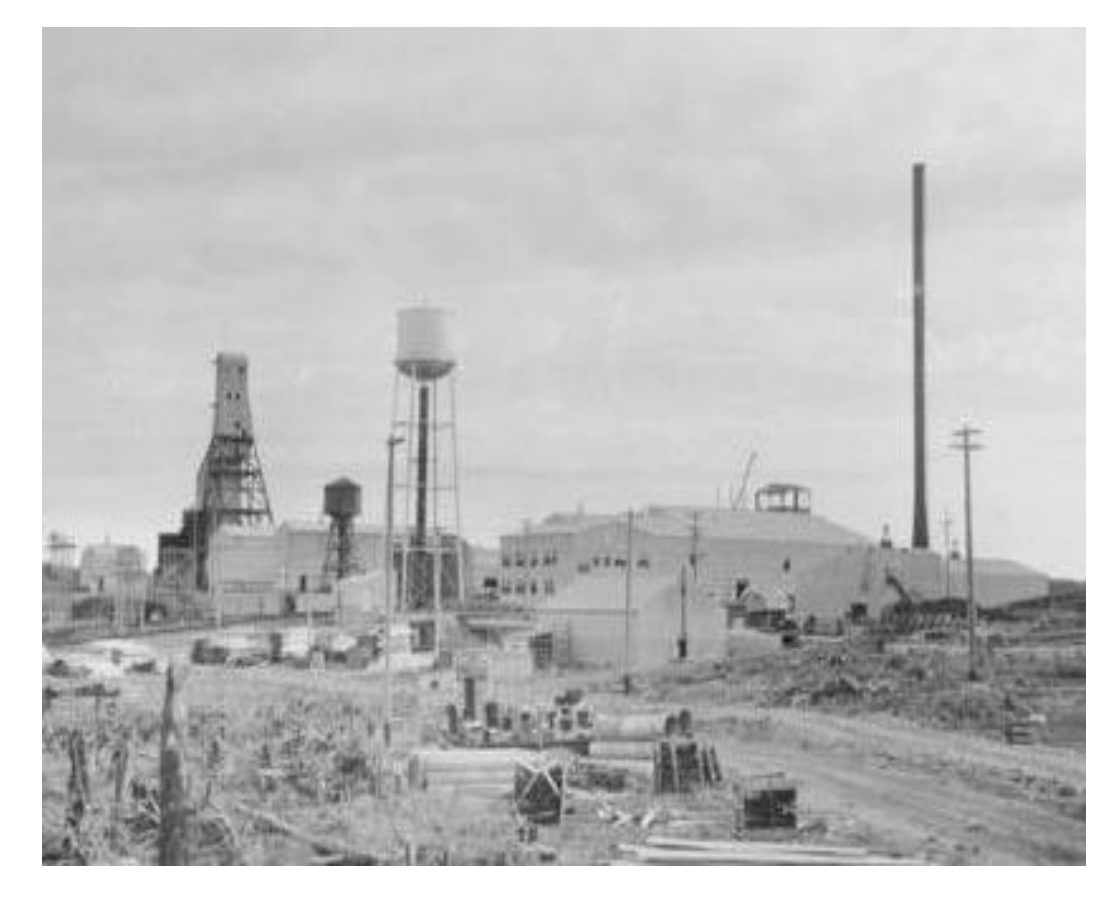
Town of Snow Lake (Circa 1950's)