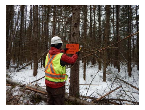
Photo 3: Timber salvage was conducted to provide fuelwood to neighbouring communities