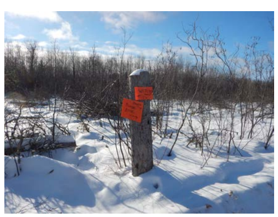
Photo 2: Environmental protection signage erected to help assist clearing crews

As the Project's EEMP requires and generates large amounts of data, the EPIMS was developed to manage, store and facilitate the transfer of Environmental Protection Program data and information amongst the Project team. The EPIMS will facilitate the transfer of knowledge and experiences encountered on a daily basis during construction activities from environmental inspectors and community environmental monitors to specialists that are responsible for monitoring project effects on a real time basis. As well, monitoring results and mitigation measure adaptations will be communicated back to construction staff and contractors.