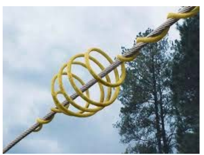
Photo 6: Bird diverters will help prevent bird strikes

The presence of transmission lines in proximity to areas of high bird activity may lead to bird – wire collisions. Manitoba Hydro has committed to installing bird diverters along transmission line sections that transect areas of high bird activity. Pre-construction surveys identified sensitive sites for birds, which were used to select locations for bird diverters. Bird-wire collision monitoring will initiate in 2017, after the transmission lines and bird deterrents are installed.