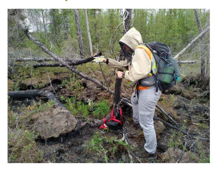
Photo 8: Installation of passive audio recorders to monitor for bird species of conservation concern