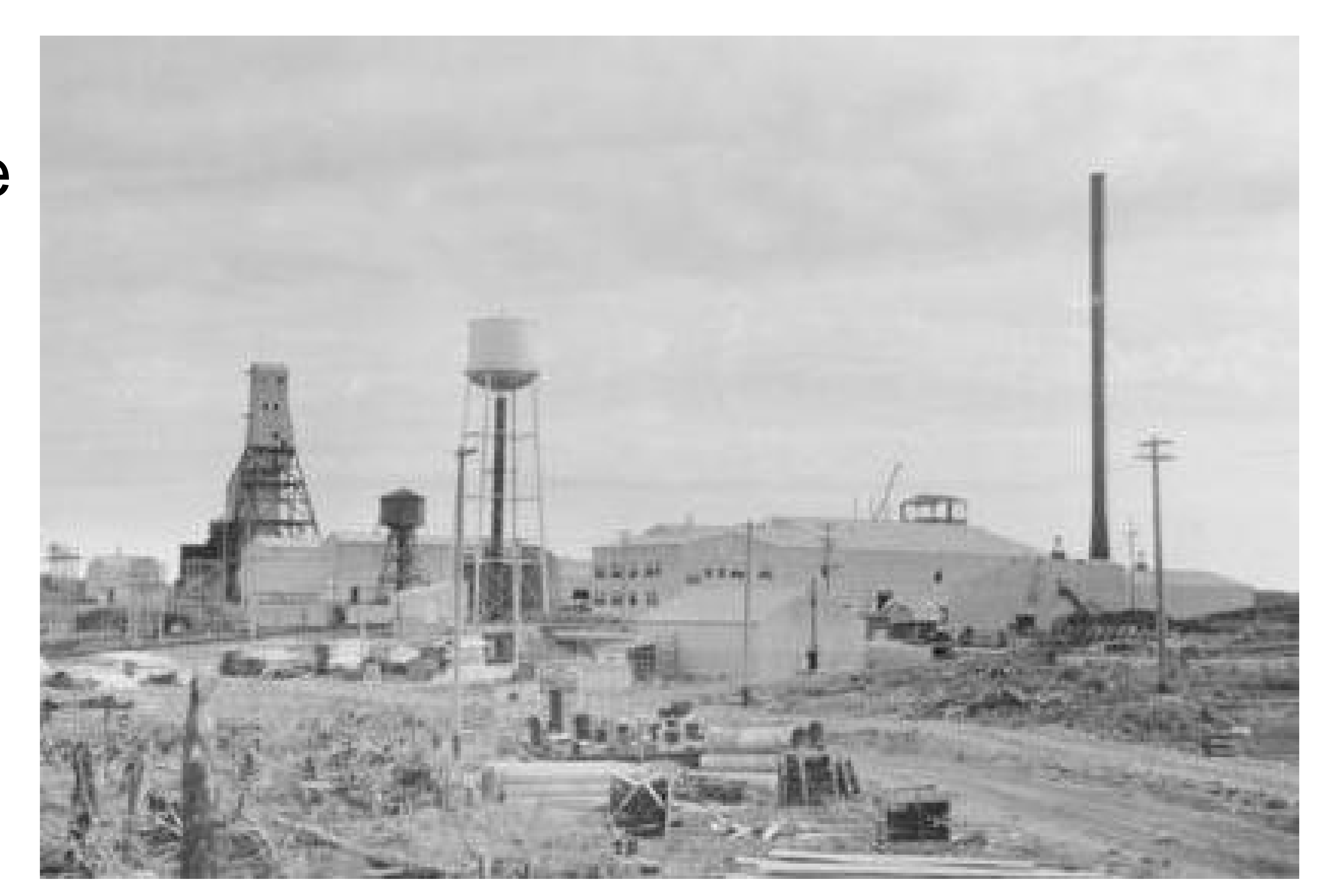
Town of Snow Lake (Circa 1950's)