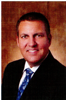
Cliff Cullen Minister

A handwritten signature in black ink that reads 'Cliff Cullen'.