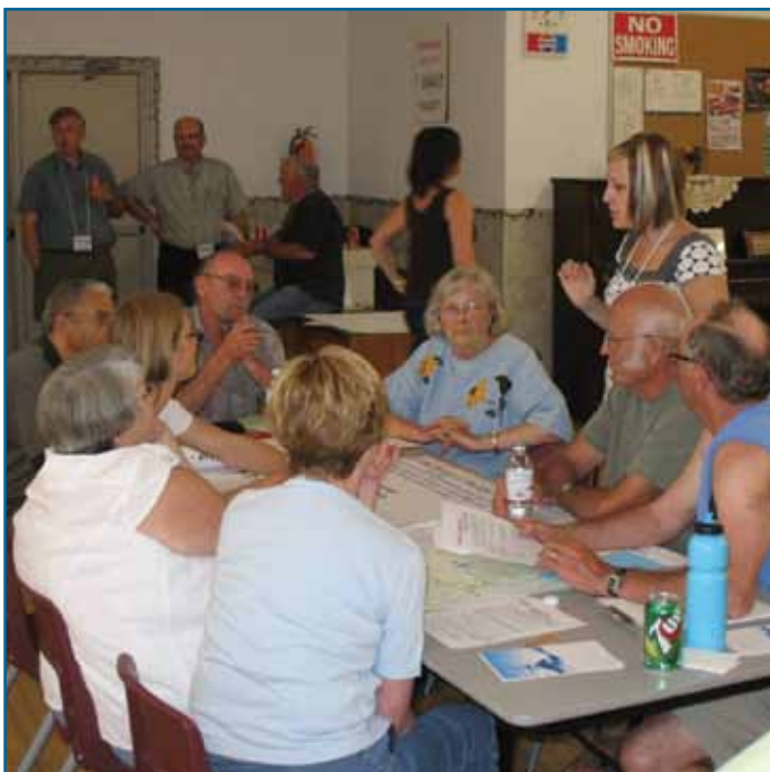
Integrated Watershed Management Plan - Public Consultation

For more information on the sustainable management of land and water resources in your watershed, contact your conservation district today: