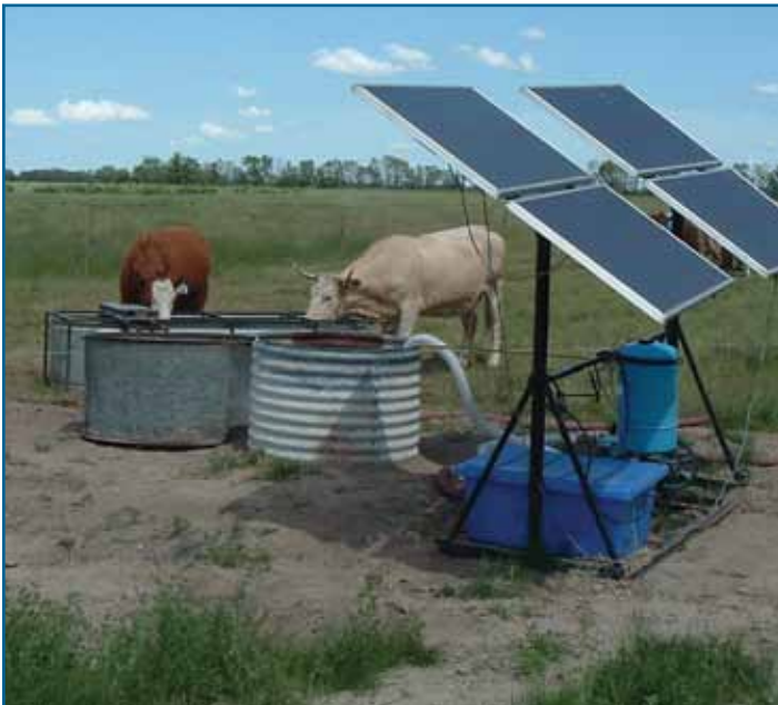
Riparian Management - Fencing and Off-site Watering System

Careful management of our natural resources is essential for sustainable economic growth in harmony with the environment. The Conservation Districts Program in your watershed is tailor-made to reflect the issues and needs of local residents in a sustainable manner.