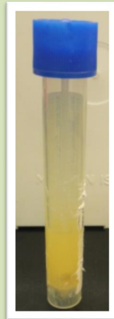
Spoiled viral transport medium. Do not use if fluid is yellow.