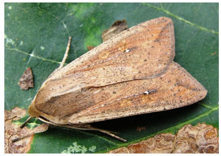
Figure 4. Armyworm moth.

Armyworm moths have pale brown forewings, each with a single small white spot. Make sure to count only armyworm moths, as other moths may also end up in the trap.