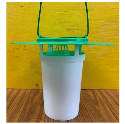
Figure 2. Shuttlecock attached to lid