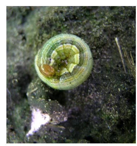
Figure 5. Armyworm larva