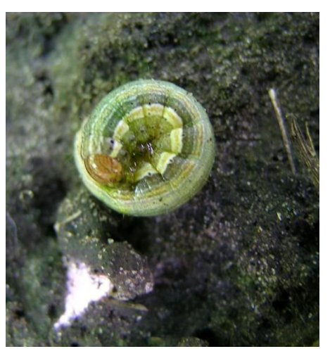
Figure 5. Armyworm larva