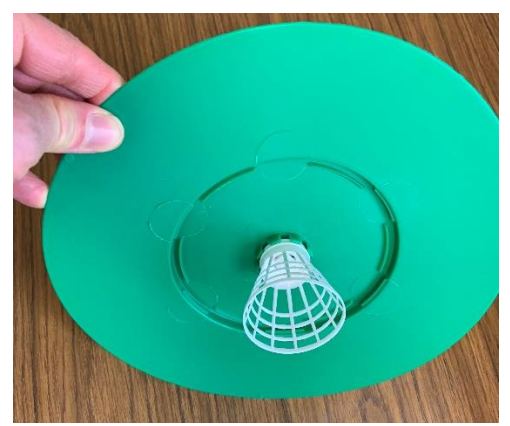
Figure 2. Shuttlecock attached to lid