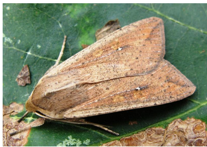
Figure 4. Armyworm moth.

Armyworm moths have pale brown forewings, each with a single small white spot. Make sure to count only armyworm moths, as other moths may also end up in the trap.