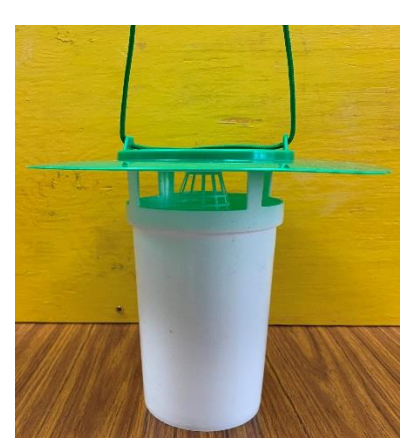
Figure 3. Multipher trap assembled