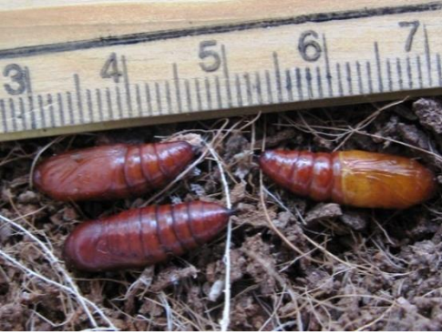
Figure 5. Bertha armyworm pupae

Pupae are reddish brown, about 0.5 to 1.8 cm (0.2 to 0.7 inches) and tapered with flexible, terminal abdominal segments. Bertha armyworm pupae are indistinguishable from other cutworm pupae.