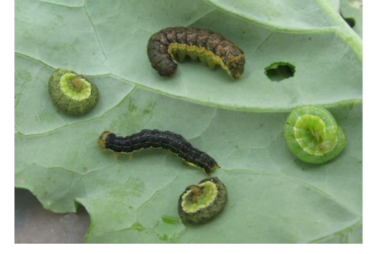
Figure 4. Mature larvae of bertha armyworm can vary in colour