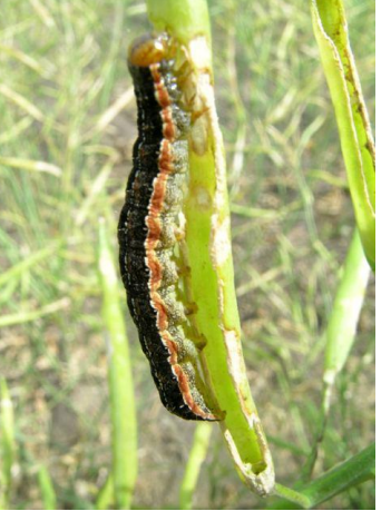
Figure 1. Bertha armyworm larva

Infestations may be localized or spread over large areas. Crop losses can be minimized if high populations are detected early.