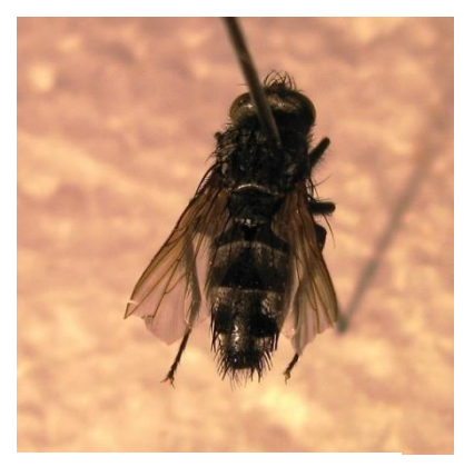
Figure 8. Athrycia cineria

Predators of bertha armyworms have not been well studied. Vertebrate predators, particularly birds, may be important during periods of high populations of larvae.