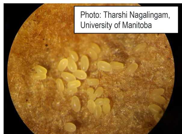
Figure 5. Eggs of striped flea beetle.

Eggs: Females deposit about 100 smooth, yellow, elongate, oval eggs (0.38 to 0.46 mm by 0.18 to 0.25 mm wide) either singly or in groups of three or four in the soil adjacent to the