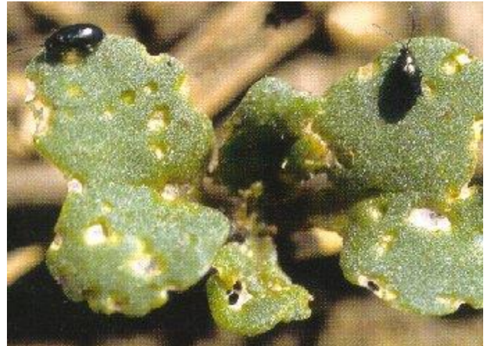
Figure 1. Flea beetles and feeding pits

The economic impact of flea beetles on crop production varies with population densities of flea beetles, and growing conditions for the crop. Yield losses of about 10 percent are common where flea beetles are abundant even when the crop is protected with insecticides.