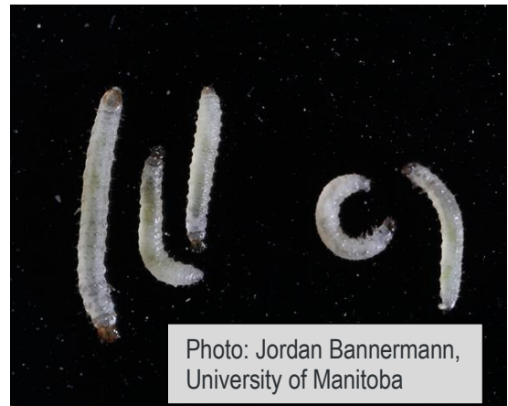
Figure 6. Larvae of striped flea beetle.

Adult: Adult emergence from the pupal stage begins after mid-July and continues until early September. The beetles feed on the leaves, stems and pods of cruciferous plants. Development from egg to adult takes about seven weeks. In late August and September adults move into leaf litter and debris to overwinter.