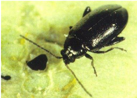
Figure 3. Crucifer flea beetle

Striped flea beetle adults are black with distinctive yellow stripes on their elytra (Figure 4).