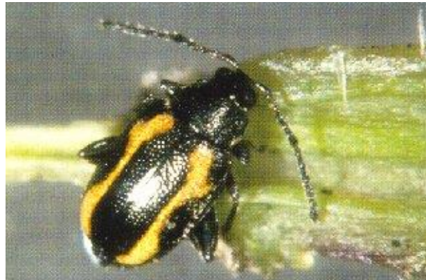
Figure 4. Striped flea beetle

Each species has a single generation per year, although adults appear twice during the growing season. In the spring, overwintered adults emerge and feed on canola seedlings. Striped flea beetles emerge 1 to 4 weeks earlier than crucifer flea beetles. In the fall, it is the offspring of the overwintering adults that are observed feeding on canola leaves, stems and seed pods.