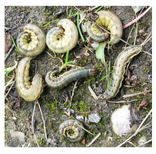
Fig. 3. Armyworm larvae

Guidelines for monitoring larvae of armyworm can be found at: <a href="https://www.gov.mb.ca/agriculture/crops/insects/true-armyworm.html">https://www.gov.mb.ca/agriculture/crops/insects/true-armyworm.html</a>