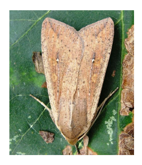
Fig. 2. Armyworm moth