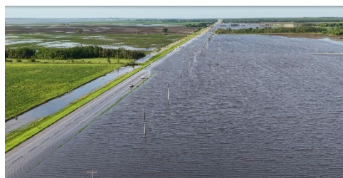
Heavy rains, Flooded highway 7 Interlake region, Photo credit Darren Bond

To find interactive soil temperature/moisture and air temperature information see Agri-Maps Current Weather viewer