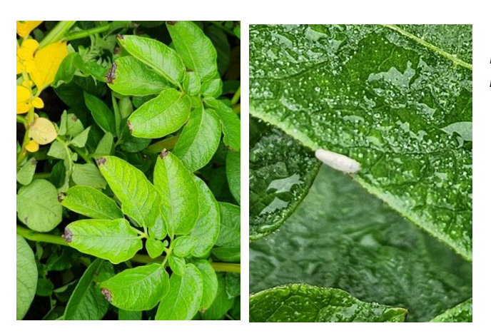
Fig. 3. Hopper burn on leaf tips (a)(far left) is caused by Potato leafhoppers (b).