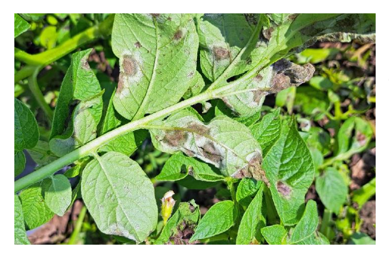
Fig. 5. US #23 infection on potato in Aliston area, ON, July 17.

If you suspect late blight in your area, please contact vikram.bisht@gov.mb.ca