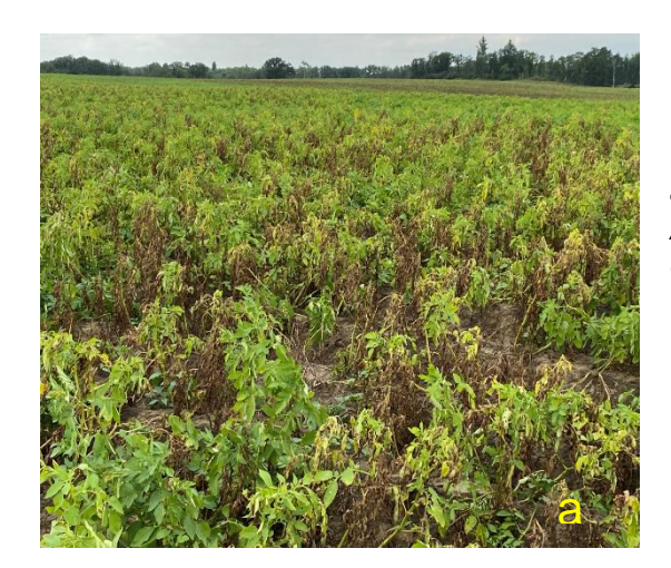
Fig.4a, b, c. Early dying due to Verticillium wilt (a) and also black dot (b). Photos: Vikram Bisht, Manitoba Agriculture). c: Early dying with Verticillium and black dot. Photo: Kurtis McKee (JP Wiebe farms).

• Early blight continues to be reported from more fields on Rangers and early maturing varieties. Protective fungicide applications are continuing where needed.