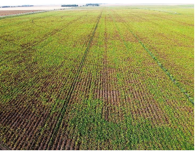
Fig.5. There are significant differences between fields, in early dying due to Verticillium wilt and black dot. (a) Field with very low incidence of early dying compared to (b) very high levels Photos: Vikram Bisht, Manitoba Agriculture).