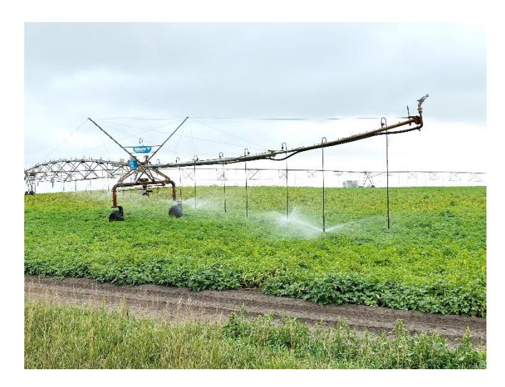
Fig. 3. Irrigation is still ongoing to meet the crop water demand. Last week had very scant rains across Manitoba.