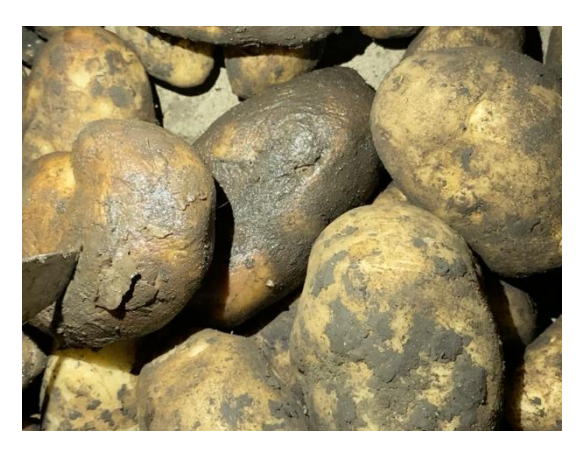
Fig.3. Overnight freezing temperatures had affected a few fields which had not been harvested by Oct. 9-11 and then Oct. 14-15.