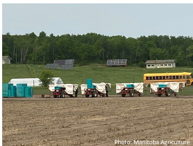
Figure 4. Asparagus Harvesting Buggies May 29, 2025

Asparagus producers report average to slightly above average yields and spear thickness. The frost and rainfall in mid-May shut down harvesting on some fields for up to several days, but harvesting has since resumed with no adverse effects reported on yield or quality. Some recent reports from producers have noted spear thickness is narrower than what they were harvesting earlier in the season.