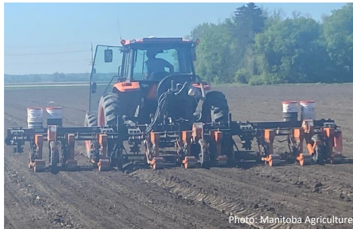
Figure 1. Parsnip Planting May 22, 2025

Vegetable transplanting and seeding is underway. Several farms reported that excess rainfall in mid-May stopped and/or slowed transplanting and seeding, but conditions improved to where all producers reported they were back in the field before the last week of May. The majority of vegetable producers have reported their planting is on schedule and have completed between 70% and 90% by the end of May.