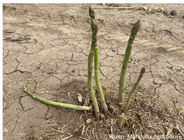
Figure 5. Asparagus Spears May 29, 2025