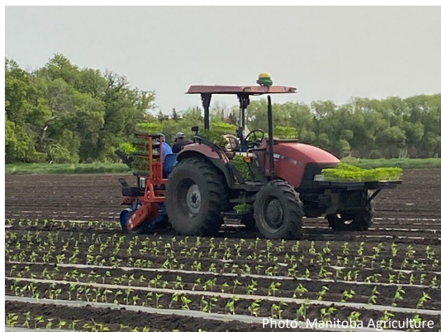
Figure 8. Transplanting Pepper Seedlings May 29, 2025

Producers report between 60% and 80% of pepper acreage was planted as of May 30, 2025.