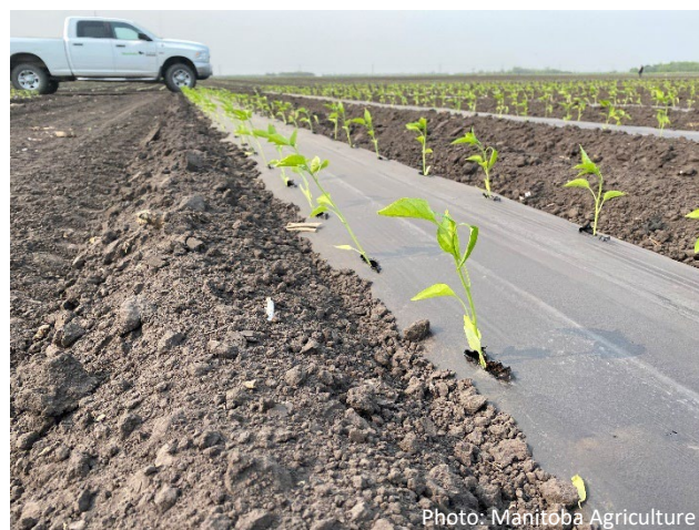
Figure 9. Freshly Transplanted Pepper Seedlings May 29, 2025