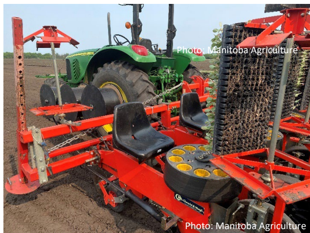
Figure 6. Transplanter with Cabbage Seedlings May 29, 2025

Vegetable producers report that between 60% and 90% of cabbage planting was completed as of May 30, 2025