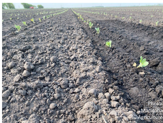
Figure 7. Freshly Transplanted Cabbage Seedlings May 29, 2025

Producers report between 60% and 80% of pepper acreage was planted as of May 30, 2025.